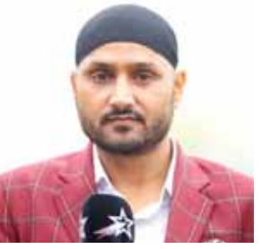
add greater fillip." The second Test, a day/night affair to be played with the pink ball, will begin at Adelaide Oval on Friday. Harbhajan described the move to play Washington Sundar over R Ashwin and Ravindra Jadeja in the series opener as a massive step. "Washington had showed during the New Zealand series that he is ready to take over the mantle from Ashwin in coming days," the "Turbanator" said. When asked if Ashwin's age is a factor, he said: "I don't think 38 is old. He is not a 58-year-old. But yes, after so many years, the shoulders do experience fatigue and wear and tear, so the zip can just be a bit less."

PTI ■ NEW DELHI Captain Rohit Sharma will either open or bat at number three in the Adelaide Test against Australia, reckoned former India off-spinner Harbhajan Singh on Monday while ruling out the possibility of a senior star coming in at number five or six. KL Rahul and Yashasvi Jaiswal added a record 201 runs for the opening stand during the second innings of the Perth Test, which the visitors won by 295 runs with plenty of time left in the match. "I don't see Rohit coming in at number five or six. Either Rohit will open with Yashasvi Jaiswal, with KL Rahul coming in at number three, or he will bat no later than number three," Harbhajan told PTI on the sidelines of the inauguration of the World Tennis League here. "Number six for Rohit wouldn't be in best interest of the team. Your top four in batting order should be the four pillars and someone like Rohit at the top would only