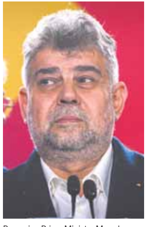
Romanian Prime Minister Marcel Ciolacu, of the Social Democratic Party or PSD, speaks after exit polls in the country's parliamentary elections, in Bucharest, Romania.

through our common will, Romania is reborn," he said. "We are here ... generation after generation, proving that nothing can defeat a united nation. In 2020, the AUR party went from relative obscurity to gaining 9 per cent in a parliamentary vote, allowing it to enter parliament. The party — which proclaims to stand for "family, nation, faith, and freedom" — doubled its support in Sunday's vote to 18.2 per cent. Cristian Andrei, a political consultant based in Bucharest, says the increased parliamentary seats for the far-right will make forming a majority government difficult for the pro-Western parties because they are historically opposition parties and could struggle to reach agreements. "It's not a unified majority, it's a very fragmented one and full of hatred among the parties," he said. "The European side won a majority ... but a majority is very difficult to build, because all those pro-European parties are not enemies, but they fought a lot in the past." In 2021, despite historically being Romania's two main opposition parties that have dominated post-communist politics, the Social Democratic Party and the National Liberal Party formed an unlikely but increasingly strained coalition together with a small ethnic Hungarian party, which exited the Cabinet last year after a power-sharing dispute.