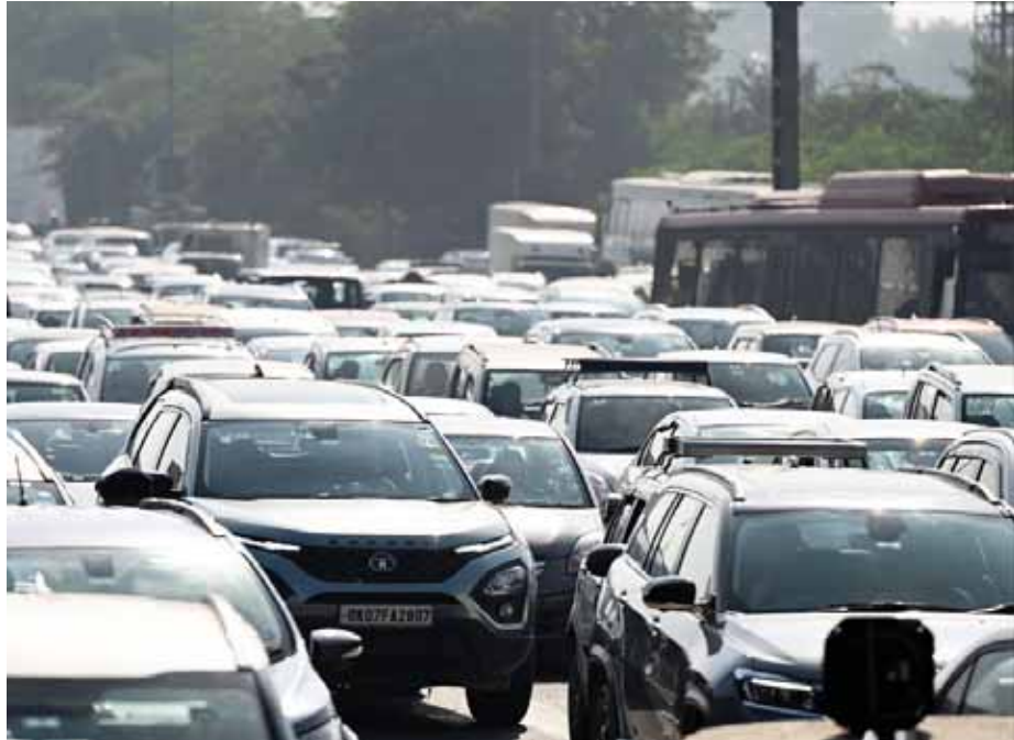
Vehicles stuck in a traffic jam on a road on the Noida-Greater Noida Expressway.

they have agreed to retreat, for now, following talks with officials from Noida, Greater Noida and Yamuna Expressway Industrial Development Authority (YEIDA). While giving the officials one week's time to accept their demands, the protesting farmers decided to camp at the Rashtriya Dalit Prerna Sthal in Noida. The farmers claimed they would march towards Delhi if their demands were not met within a week. Earlier, the Supreme Court has asked Punjab farmer leader Jagjit Singh Dallewal, who is on a fast-unto-death at the Khanauri border point to press for the acceptance of farmers' demands, to persuade the protesting farmers not to obstruct highways and cause inconvenience to people. Visuals showed a long queue of vehicles in several parts of Delhi-NCR amid heavy security deployment and police barricading. A video posted on social media shows cars moving at a snail's speed on the Chilla border, while on the DND, all vehicles in at least 10 lanes seem to be at a standstill. The police set up barricades at Charkha Chowk near Amity University and then at Mahamaya Flyover and Dalit Prerna Sthal on the stretch.