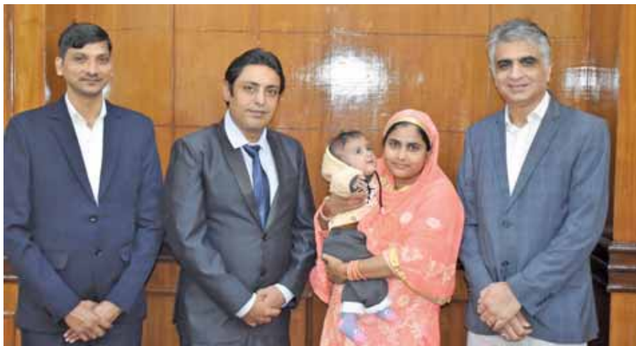
Sarvodaya Hospital, Faridabad achieved medical breakthrough by treating a 5-month-old baby for congenital hearing impairment making him the youngest in India to undergo a cochlear implant surgery.

The 17th edition of CPHI & PMEC India, organised by Informa Markets in India took place at the India Expo Centre, Greater Noida, Delhi-NCR. Over 50,000 global industry professionals, including key decision-makers, gathered to explore new partnerships and growth opportunities. The expo featured forward-thinking discussions on sustainability, digital transformation, and the future of pharma, with a special focus on empowering women in the industry.