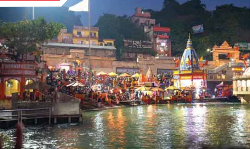
Devotees attend 'Ganga Aarti' at Har Ki Pauri, in Haridwar