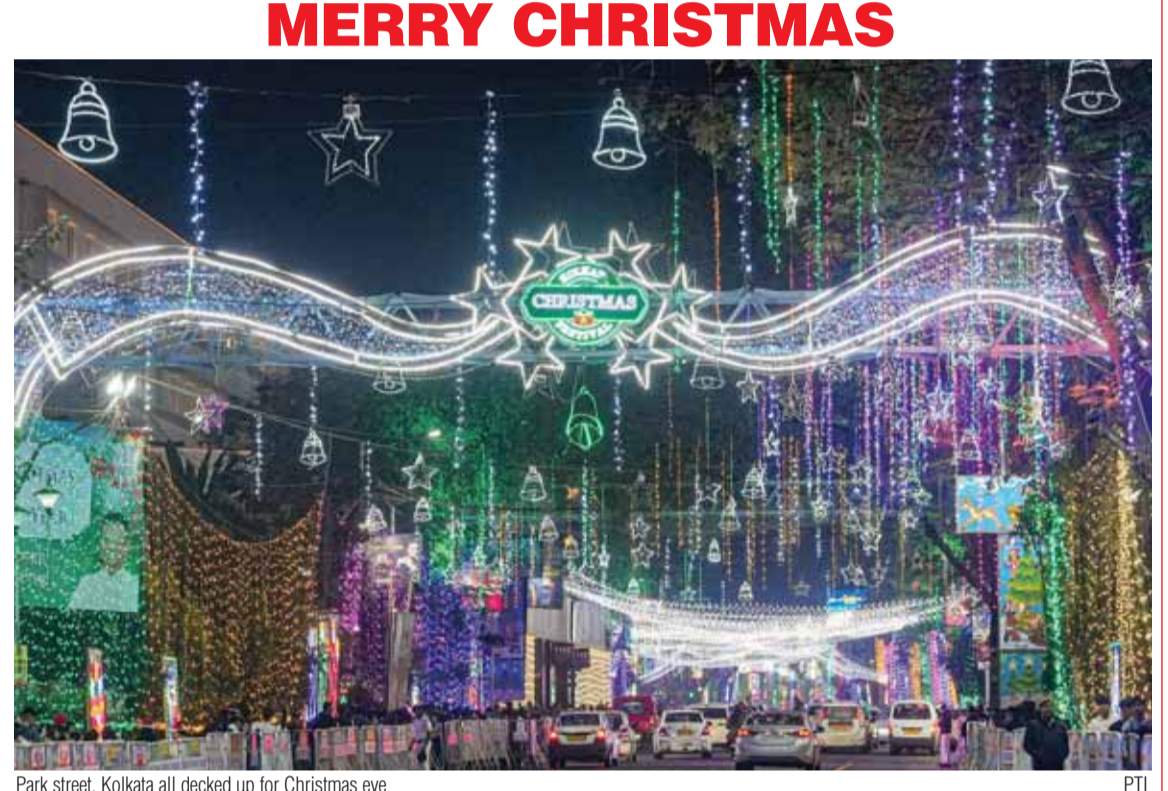
Park street, Kolkata all decked up for Christmas eve

In a major reshuffle, former Union Home Secretary Ajay Kumar Bhalla has been appointed as Manipur Governor amid ongoing trouble in the north eastern State. Some of the other States where change was effected according to a Rashtrapati Bhawan communique includes former Union Minister and army chief Vijay Kumar Singh was appointed as Mizoram Governor, while Arif Mohammed Khan was moved to Bihar as Governor. In a surprise move following the resignation of Raghuraj Das as Odisha governor, Hari Babu Kambhampati was appointed as the new man for the State's gubernatorial post. Das has served earlier as Chief Minister of Jharkhand and State Bharatiya Janata Party (BJP) President as well.