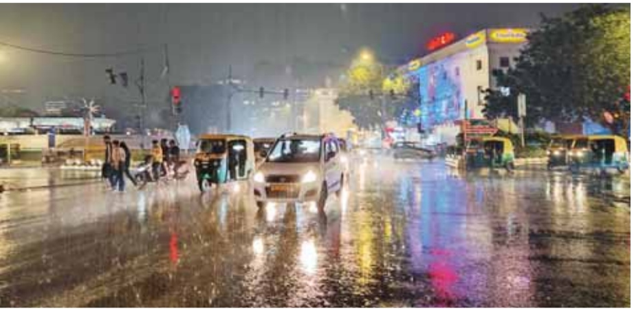
Light rainfall lashed several parts of Delhi on Tuesday evening, temperatures are expected to drop further in the next two days

PUBLISHED FROM: DELHI | LUCKNOW | BHOPAL | BHUBANESWAR | RANCHI | RAIPUR | CHANDIGARH | DEHRADUN | HYDERABAD | VIJAYWADA