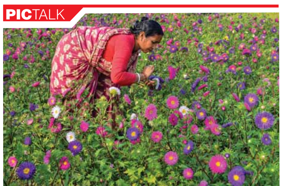
A woman plucks aster flowers at an orchard, in Nadia

geoning market and investment opportunities, offers Kuwait an attractive destination for its sovereign wealth fund. During his discussions, PM Modi noted the shared aspirations of both nations: building a prosperous 'New Kuwait' and transforming India into a developed nation by 2047. By aligning these goals, the two countries can establish a partnership that drives mutual growth. Modi's visit was not limited to economic discussions; it also celebrated the cultural ties that bind the two nations. The Prime Minister met with individuals who have contributed to fostering Indo-Kuwaiti relations, including Abdullah Al-Baroun, a translator who brought Indian epics like the 'Ramayana' and 'Mahabharata' to Arabic-speaking audiences. As India and Kuwait look to the future, the visit has set the stage for a relationship that goes beyond traditional energy ties. The integration of India's technological expertise with Kuwait's developmental ambitions holds the promise of transformative progress. Furthermore, the strong presence of the Indian diaspora serves as a bridge, fostering deeper connections and mutual understanding. By strengthening this partnership, India and Kuwait are not only enriching their bilateral relationship but also contributing to stability and development in the region.