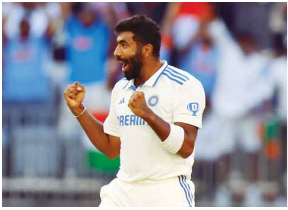
against the best batsmen of his era. "His ability to make it hard for batsmen to score runs with his probing line and length, allied to his guile and determination, made him the champion that he was. Bumrah, though less overtly

PTI ■ SYDNEY Jasprit Bumrah embodies the qualities of pace legends such as Dennis Lillee, Andy Roberts and Richard Hadlee but at the same time is forging his own legacy, one that is set to inspire future generations of pacemen, feels former India coach Greg Chappell. He also said that Bumrah is the only player standing between Australia and the Border Gavaskar Trophy. "What sets Bumrah apart is his combination of skills: (Malcolm) Marshall's adaptability, Lillee's aggression, Richard Hadlee's control, Roberts' strategy, Wasim (Akram) and Waqar's (Younis) reverse swing, (Glenn) McGrath's precision, (Dale) Steyn's explosiveness, and (Kagiso) Rabada's modern versatility." "As Nasser Hussain aptly observed, "He's the complete bowler. As he has had back