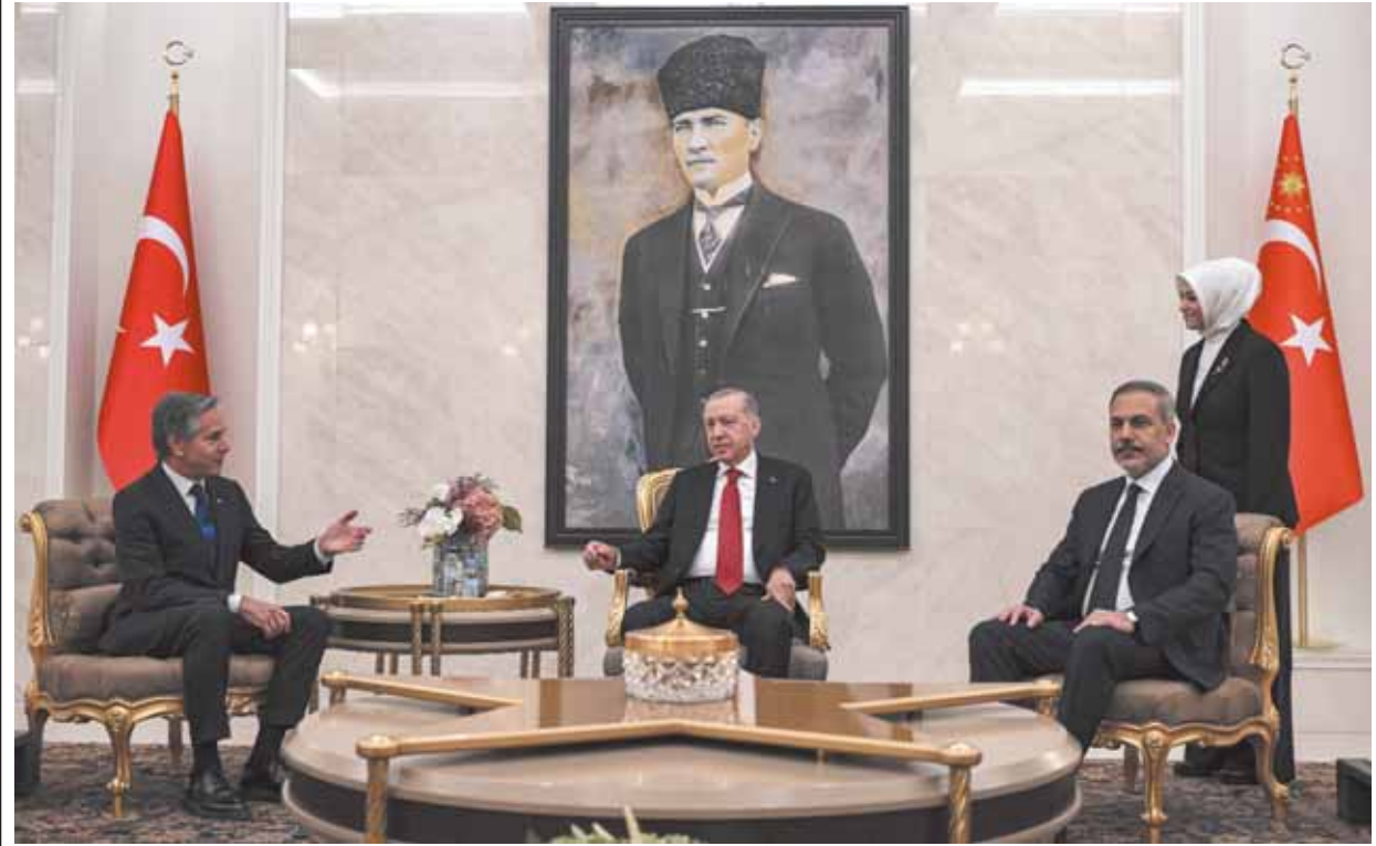
US Secretary of State Antony Blinken, left, meets with Turkey's President Recep Tayyip Erdogan, middle, and Foreign Minister Hakan Fidan, at Ankara Esenboga Airport.

doing, was also expelled from Denmark permanently, and he was denied the right to participate in the management of a business in Denmark or abroad without being personally and unlimitedly liable for the company's obligations. He has lodged an appeal against the Glostrup district court's verdict in the High Court. According to the Danish Prosecution Service (AnklageMyndigheden), the British national was convicted of committing fraud of a "particularly serious nature for 9,025,205,871 kroner (GBP 1bn) and attempted fraud for an additional 553,346,302 kroner during a period from 2012 to 2015".