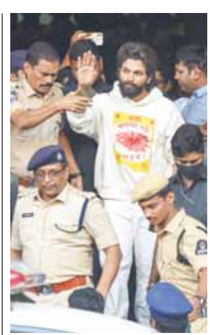
Telugu actor Allu Arjun leaves from Gandhi Hospital after a medical check-up following his arrest, in Hyderabad

received no communication from IndiGo regarding the ongoing delays. Despite promises of lounge access as compensation, the lounge at Istanbul Airport was overcrowded and unable to accommodate all the stranded travellers, they claimed on social media. "We are aware of the delays on the IndiGo flight connections to Istanbul. We accord the highest priority towards customer convenience and our teams are available at all contact points to assist customers," IndiGo said in a statement on Friday. The airline also apologised for the "inconvenience" caused to the passengers. Some passengers also shared pictures of people stuck at the airport. In a post on X, a passenger said, "first time to India and stranded at the Istanbul Airport for the last 24 hours because the IndiGo flight keeps cancelling. No food. No clarity. No representative. No compensation. Pathetic treatment". "Lot of people stranded at the airport due to pathetic services by @IndiGo6E and @TurkishAirlines operators. Never book flights with them as they don't value passengers time. You can never be on time with @IndiGo6E," another passenger said in a post on X.