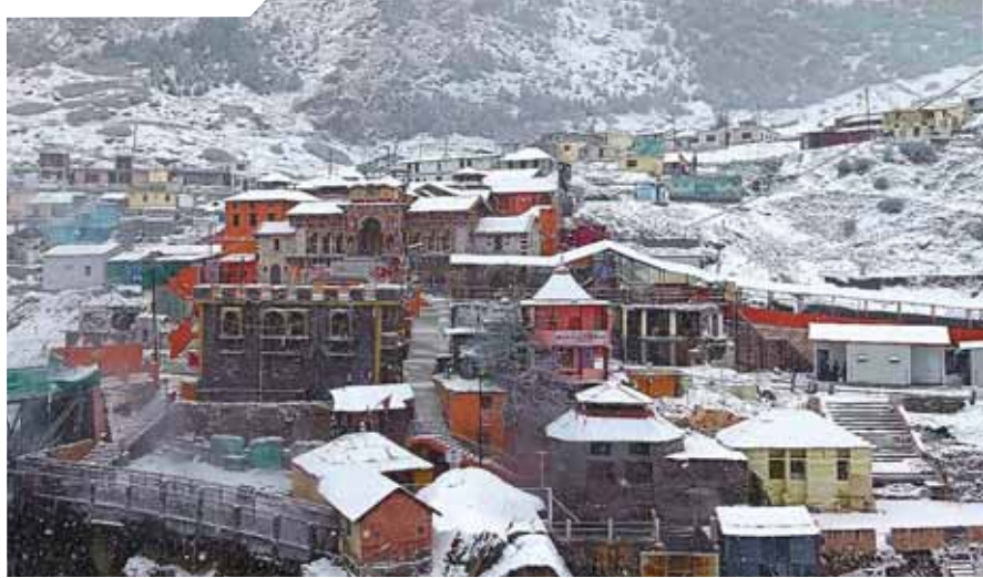
Badrinath Dham receives the first snowfall of the season, in Chamoli