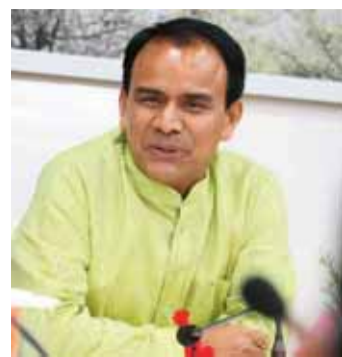
States when it comes to working for elimination of TB.

The Health department has stepped up efforts to identify and treat tuberculosis patients in the State under the National Tuberculosis Elimination Programme (NTEP). A mobile testing van will be operated soon in the five plain districts. This testing van will conduct door to door testing of sputum of the patients. Those found positive for TB will be connected with the treatment.