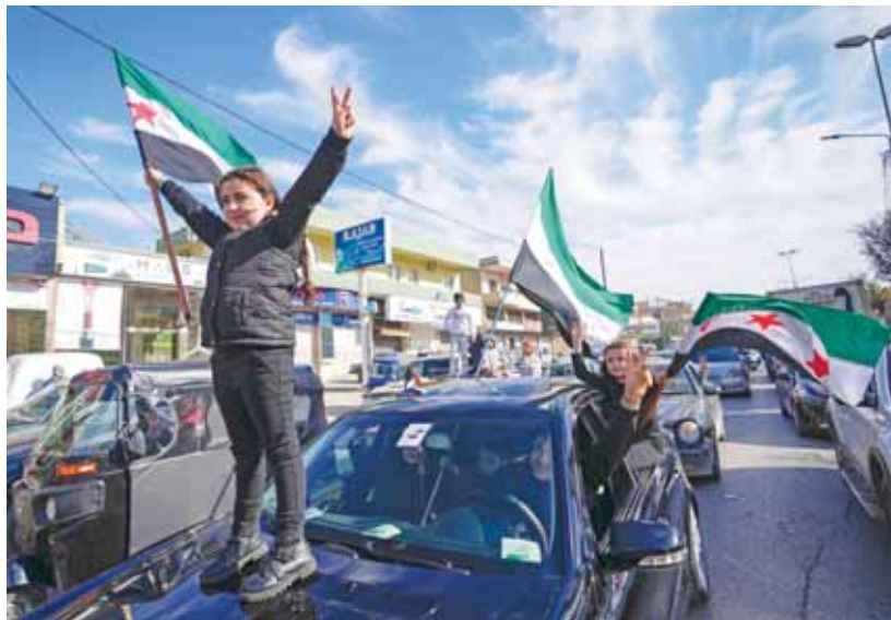
Syrians celebrate the fall of Bashar Assad's government in the town of Bar Elias, Lebanon, near the border with Syria

Joyful crowds gathered in central squares in Damascus, waving the Syrian revolutionary flag in scenes that recalled the early days of the Arab Spring uprising, before a brutal crackdown and the rise of an insurgency plunged the country into a nearly 14-year civil war. Others gleefully ransacked the presidential palace and the Assad family residence after President Bashar Assad and other top officials vanished, their whereabouts unknown. Russia, a close ally, said