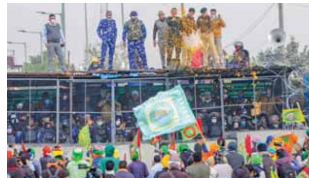
Police personnel shower flowers on farmers agitating at Shambhu border, in Patiala district

After the farmers started the foot march on Sunday, they were halted by the multilayered barricading erected by the Haryana Police at the entry point to Haryana from Punjab. A heated argument took place between protesting farmer 'jatha' and security personnel. Haryana Police asked the farmers to show them the requisite