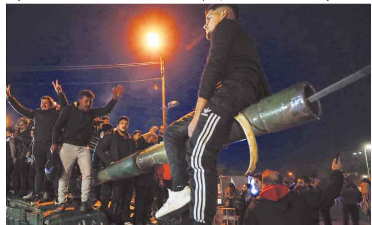
Syrians celebrate the arrival of opposition fighters in Damascus on Sunday.

Syria" "The Syrian people have experienced appalling suffering," the chancellor said in an emailed statement. "The end of Assad's rule over Syria is therefore good news." Airstrikes reported in the area of the Mezzeh military airport: An Associated Press journalist in Damascus reported airstrikes in the area of the Mezzeh military airport, southwest of the capital Sunday. The airport has previously been targeted in Israeli airstrikes, but it was not immediately clear who launched Sunday's strike. Opposition forces announce curfew in Damascus: The command of the Syrian armed opposition says it will impose Sunday a curfew in Damascus, starting at 4 pm local time till 5 am on Monday. The Military Operations Administration, which posted the decision on Telegram, did not give a reason for the curfew. France welcomes the fall of Bashar Assad: The French