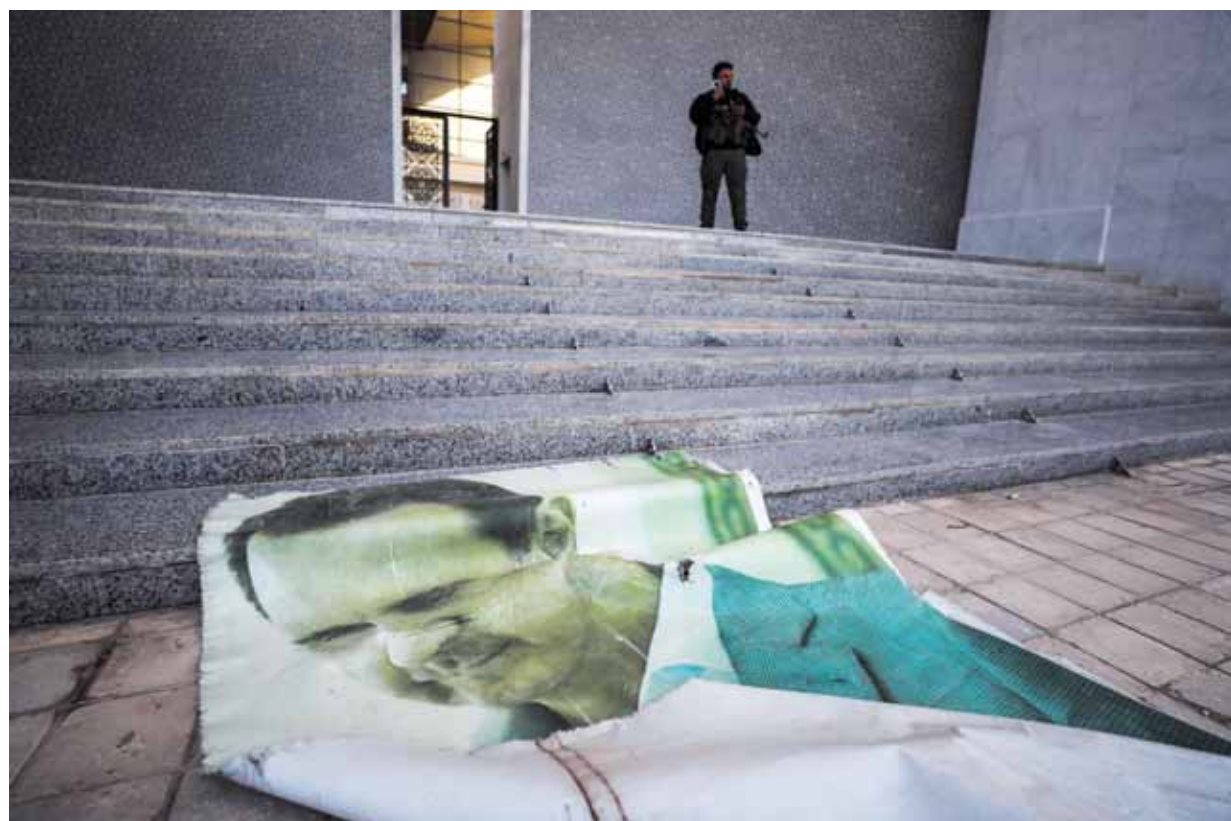
A giant picture of Syrian President Bashar Assad lies on the ground as a Syrian opposition fighter stands nearby, inside the Presidential Palace in Damascus, Syria on Sunday.

lowing the downfall of Syria's Bashar Assad. Many welcomed Assad's ouster after decades of repression under his rule and that of his father Hafez Assad. Others, however, expressed concerns about the future of Syria, mostly given the extremist past of rebel commanders, especially Abu Mohammed al-Golani who leads Hayat Tahrir al-Sham, labelled a terrorist by the United States. EU top diplomat welcomes Bashar Assad's ouster: The European Union's top diplomat welcomed the fall of Bashar Assad and said that the collapse of his rule underlines how weak his supporters in Moscow and Tehran have become. "The end of Assad's dictatorship is a positive and long-awaited development," EU for-