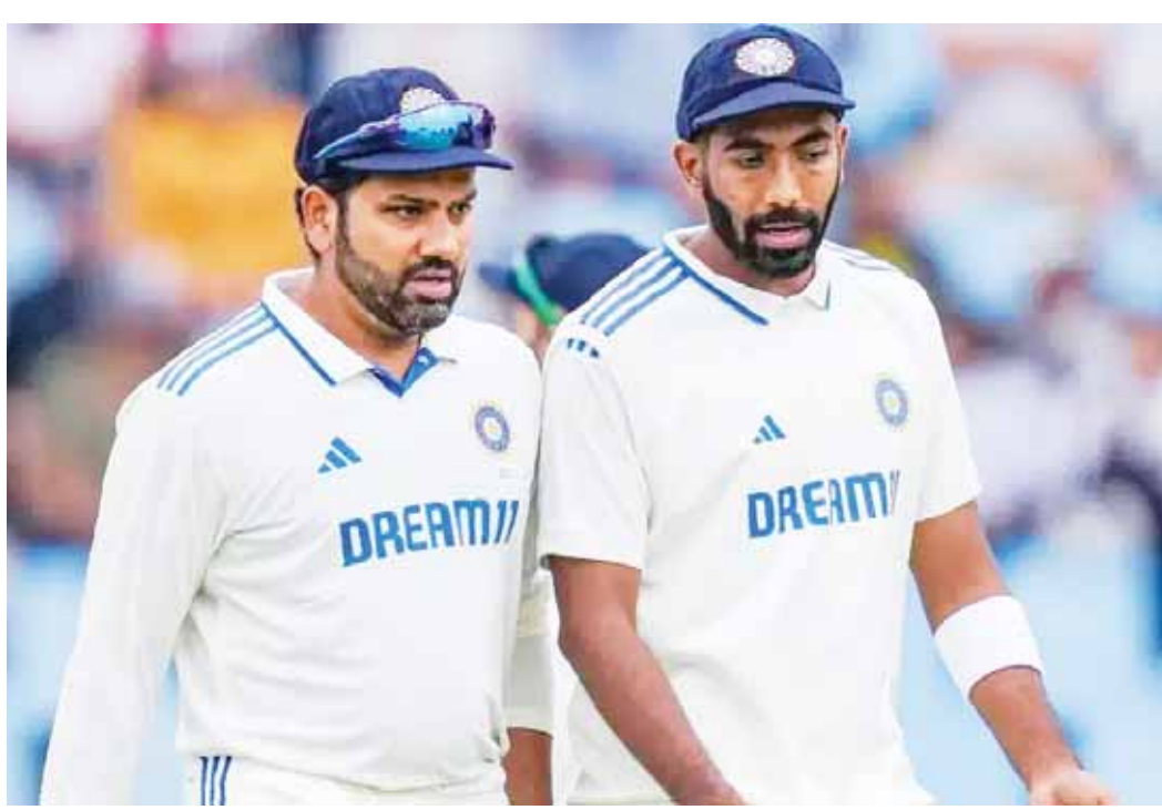
because then what confidence does the team get? "It happens, sometimes the team doesn't get what it wants. He came up against a good batsman who put pressure on him. But he has a heart and a passion so we should back such (qualities in a player)," Rohit said. "The player might think that you give me one match but leave me out in the next. This is not good

PTI ■ ADELAIDE Jasprit Bumrah is only human and cannot always shoulder the responsibility of bowling opposition out all by himself, skipper Rohit Sharma said on Sunday, urging others to share the load with the premier fast bowler. India lost to Australia by 10 wickets in the second Test and during the home team's first innings, only Bumrah stood out with a four-wicket haul. "We are not just playing with one bowler. There are other bowlers also who will have to take responsibility and get the job done for the team, be it (Mohammed) Siraj, Harshit Rana, Nitish Reddy, Akash Deep or Prasadh (Krishna)," skipper Rohit had a loud and clear message for his bowling unit. The captain understands that there is a bit of inexperience in the line-up and they will grow in confidence with time. "These bowlers have just arrived in Test cricket, it's important to give them confidence. Whenever they play a match, it's important to give them confidence. We keep planning and discussing. But you