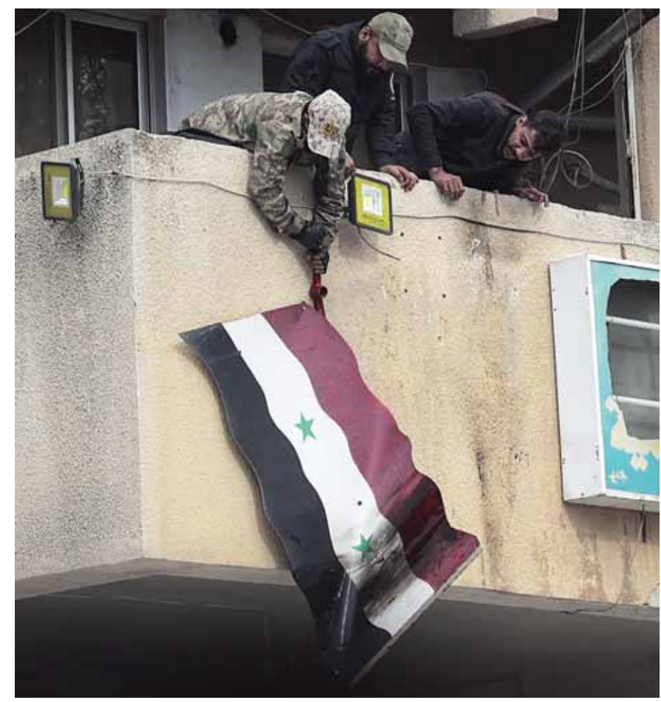
Syrian opposition fighters remove a government Syrian flag from an official building in Salamiyah, east of Hama, Syria

Qaida. "This new organisation has no affiliation to any external entity," he said in the video, filmed wearing military garb and a turban. The move paved the way for al-Golani to assert full control over fracturing militant groups. A year later, his alliance rebranded again as Hayat Tahrir al-Sham — meaning Organisation for Liberating Syria — as the groups merged, consolidating al-Golani's power in northwest Syria's Idlib province. HTS later clashed with independent Islamist militants who opposed the merger, further emboldening al-Golani and his group as the leading power in northwestern Syria, able to rule with an iron fist. With his power consolidated, al-Golani set in motion a transformation that few could have imagined. Replacing his military garb with shirt and trousers, he began calling for religious tolerance and pluralism. He appealed to the Druze community in Idlib, which the Nusra Front had previously targeted, and visited the families of Kurds who were killed by Turkish-backed militias. In 2021, al-Golani had his first interview with an American journalist on PBS. Wearing a blazer, with his short hair gelled back, the now more soft-spoken HTS leader said that his group posed no threat to the West and that sanctions imposed against it were unjust. "Yes, we have criticised Western policies," he said. "But to wage a war against the United States or Europe from Syria, that's not true. We didn't say we wanted to fight."