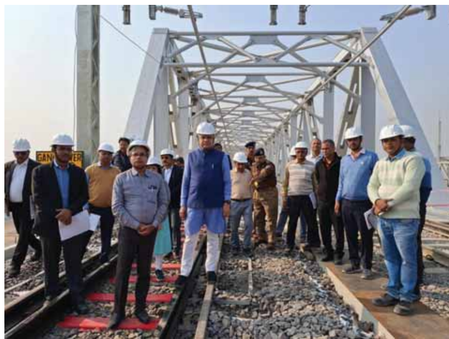
Railway and Information Broadcasting Minister Ashwini Vaishnaw on Sunday inspected the to be commissioned 2.2 kilometres double line New Railway Bridge over Ganga in Prayagraj where the Mahakumbh is scheduled early next year. The Old bridge was single line and of more than 100 years which will be decommissioned shortly. The work for the New Ganga Bridge started in October 2020 and will be commissioned soon by Prime Minister Narendra Modi. Railways also announced that it will run 13000 trains for the Mahakumbh between early January 2025 till February 2025.

minister said. In a grand consistory held in the Vatican on Saturday, 51-year-old Koovakad was elevated to the rank of cardinal by Pope Francis. The ceremony, held at the famous St Peter's Basilica and attended by clergy and dignitaries from around the world, witnessed the induction of 21 new cardinals from various countries. The ceremony began at 8.30 pm (IST) marking a procession with 21 cardinal-designated to the altar of St Peter's Basilica. Later, the Pope addressed the gathering and handed over the ceremonial cap and ring to the cardinal-designate, followed by a certificate accompanied by prayers. Koovakad's appointment brings the total number of Indian cardinals to six, further strengthening the country's representation at the Vatican.