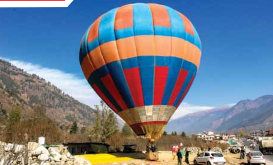
Tourists gear up to take a hot air balloon ride in Manali