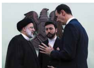
FILE: Syrian President Bashar Assad (right) speaks with Iranian President Ebrahim Raisi (left).

noon Sunday, there was "no serious threat" to the security of Russia's military bases there. Russia has waged a military campaign in Syria since September 2015, teaming up with Iran to allow Assad's government to fight armed opposition groups and reclaim control over most of the country. While Russia now concentrates the bulk of its military resources in Ukraine, it has maintained a military foothold in Syria and keeps troops at its bases there.