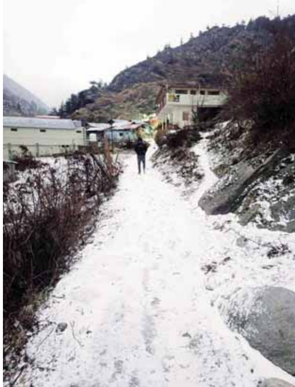
A view of Harshil valley in Uttarkashi after light snowfall on Sunday

Meanwhile, the State Meteorological Centre has forecast that very light rain is likely to occur at isolated places in Dehradun, Uttarkashi, Chamoli, Rudrapur, Pauri, Tehri, Nainital, Almora, Champawat, Pithoragarh and Bageshwar districts and dry weather will