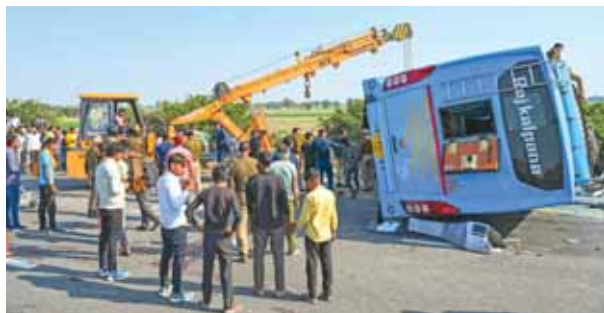
Rescue work underway after a double-decker bus collided with a tanker on Agra-Lucknow Expressway, in Kannauj district, Uttar Pradesh. At least six people were killed and 40 others suffered injuries, according to officials PTI

This line will be an extension of the presently operational Shaheed Sthal (New Bus Adda) - Rithala (Red Line) corridor and will boost connectivity in the north western parts of the national capital in areas such as Narela, Bawana, parts of Rohini etc.