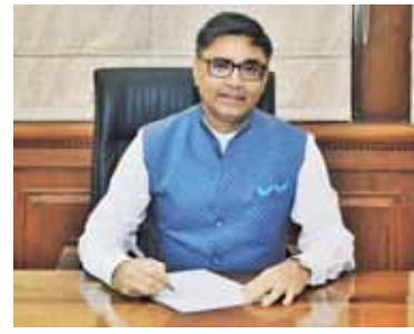
Foreign Secretary Vikram Misri

India last week said the interim government in Bangladesh must live up to its responsibility of protecting all minorities as it expressed serious concern over the "surge" of extremist rhetoric and increasing incidents of violence against Hindus. India had also hoped that the case relating to Das, arrested on a charge of sedition, would