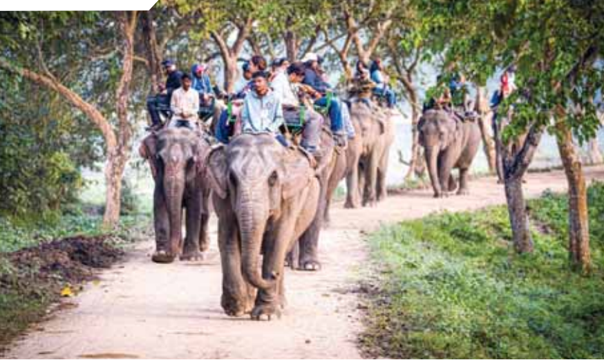
Tourists on an elephant safari at the Kaziranga National Park, in Golaghat