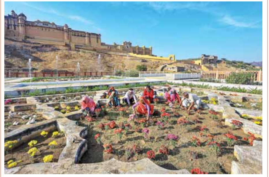
Beautification work in progress ahead of the Rising Rajasthan Global Investment Summit, at Kesar Kyari Garden of historical 'Amber Fort', in Jaipur