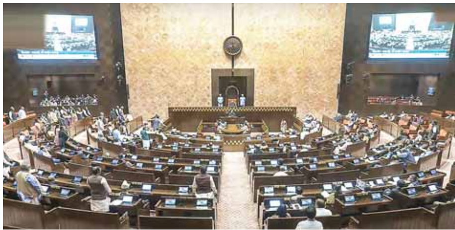
Rajya Sabha Chairman Jagdeep Dhankar conducts proceedings in the House during the Winter session of Parliament

While Leader of Opposition Mallikarjun Kharge said the Chairman should not have named the member without an investigation being completed, Leader of the House JP Nadda accused the Opposition of showing eagerness on "some issues" while wanting to cover up other issues. Singhvi Friday termed the "recovery" of cash from his