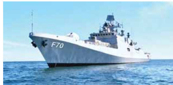
The new sentinel of the seas

The Indian Navy will commission its latest multi-role stealth guided missile frigate INS Tushil, an upgraded Krivak III class frigate, at Kaliningrad in Russia on December 9. The commissioning of INS Tushil — a 125 metre, 3900 ton ship which is a blend of Russian and Indian cutting edge technologies and best practices in warship construction — will take place at an event to be presided over by Defence Minister Rajnath Singh and attended by many high ranking Russian and Indian government and defence officials. INS Tushil is an upgraded Krivak III class frigate from Project 1135.6, of which six are already in service. The six frigates of this class that are