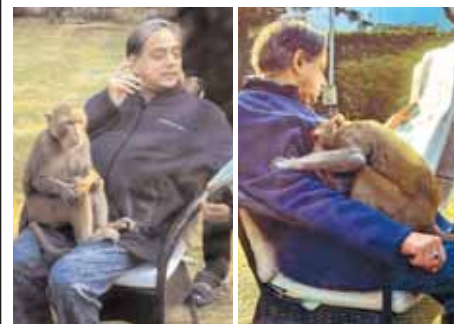
Congress leader Shashi Tharoor reads a newspaper while a monkey sits on his lap