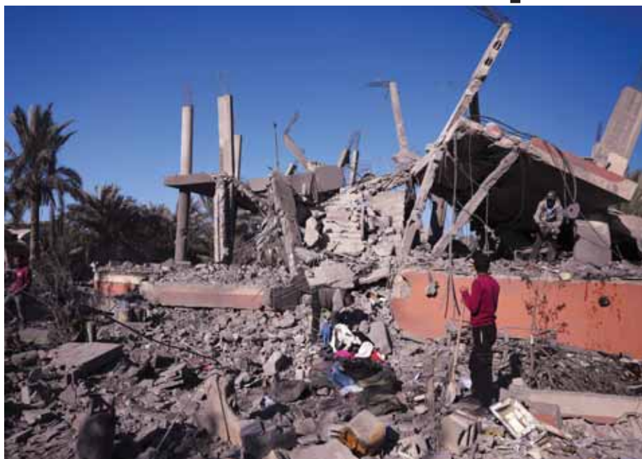
Palestinians check the rubble of a destroyed building following an overnight Israeli strike in Deir al-Balah, Gaza Strip, Wednesday.

Israel's blistering retaliatory offensive has killed at least 44,500 Palestinians, more than half of them women and children, according to Gaza's Health Ministry, which does not say how many of the dead were combatants. Israel says it has killed over 17,000 militants,