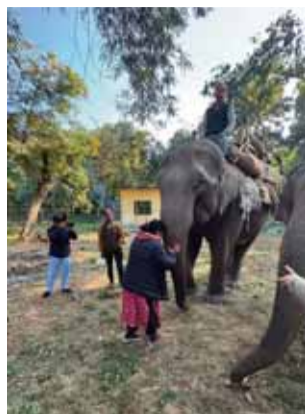
species. "Kotdwar is just four hours away from Delhi-NCR, making it a convenient and attractive tourist destination for

The State Assembly Speaker Ritu Khanduri Bhushan embarked on a special jungle safari with the local youths in Pakharo Range of Kotdwar that falls under the iconic Jim Corbett National Park on Wednesday. The object behind this safari was stated to increase awareness about the biodiversity and environmental heritage of the area. Besides, it was aimed at boosting tourism and employment generation opportunities in Kotdwar.