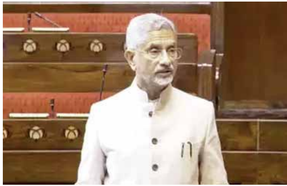
He said with the task of disengagement completed, it is now our expectation that discussions would commence in regard to the remaining issues that we had placed on the agenda.

said disengagement has now been achieved in full in eastern Ladakh through a step-by-step process, culminating in Depsang and Demchok. He had earlier made an identical statement in the Lok Sabha on Tuesday. Jaishankar, in his statement, said India was and remains very clear that the three key principles must be observed in all circumstances, he said explaining: "one: both sides should strictly respect and observe the Line of Actual Control (LAC), two: neither side should attempt to unilaterally alter the status quo, and three: agreements and understandings reached in the past must be fully abided by in their entirety". "Our relationship has progressed in many domains, but was obviously negatively affected by recent events. We are clear that the maintenance of peace and tranquility in border areas is a pre-requisite for the development of our ties. In the coming days, we will be discussing both de-escalation as well as effective management of our activities in the border areas," he said.