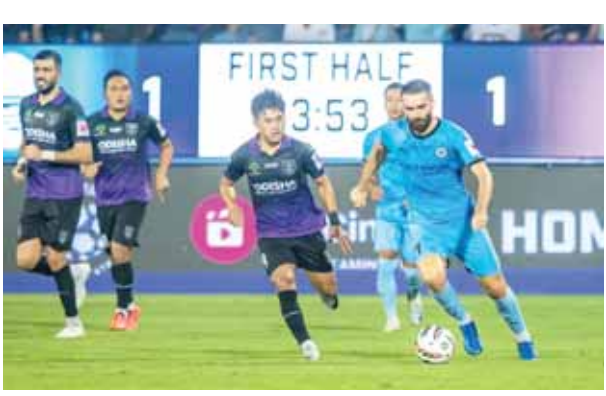
not just an incredible player but also a fantastic human being. "We'll miss him on the pitch, but I'm sure he'll continue to support us off it. He's one of the best professionals I've worked with, and I wish him a speedy recovery." Despite this loss, the team remains focused and ready for the challenges ahead. Mumbai have been unbeaten in its earlier six clashes versus Odisha, having been successful on four occasions and drawing twice. Only against FC Goa (13 games) and Chennaiyin FC (9 games) does the side have a