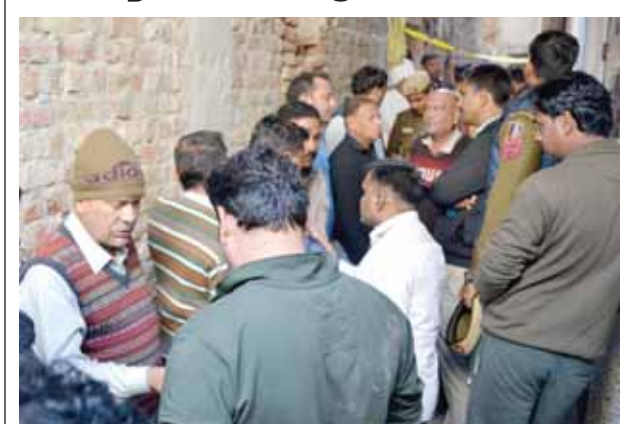
Police personnel and others at a house at Neb Sarai area where a middle-aged couple and their daughter were found dead