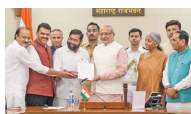
BJP leader Devendra Fadnavis with Shiv Sena chief Eknath Shinde, NCP chief Ajit Pawar and BJP Central Observers Nirmala Sitharaman and Vijay Rupani meet Maharashtra Governor C P Radhakrishnan to stake claim to form the new Maharashtra Government