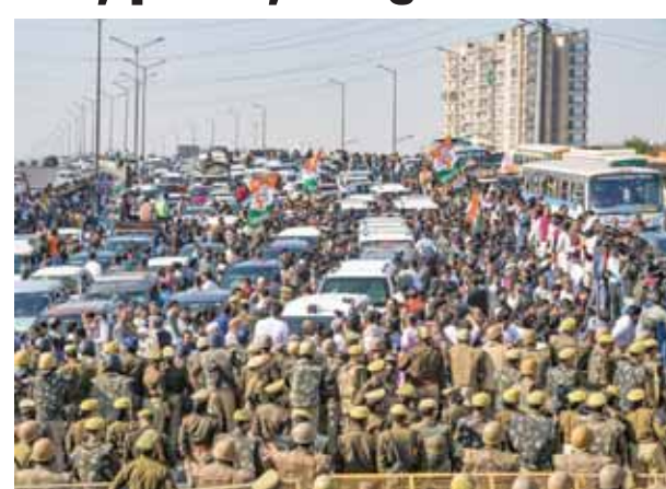
Police stop Leader of Opposition in the Lok Sabha Rahul Gandhi and Congress supporters at the Ghazipur border while they were on the way to visit the violence-hit Sambhal district, in Ghaziabad

so dire that the angry crowd clashed with Congress workers. Vehicles were seen clogging the roads for several kilometres. Several commuters shared their grievances with The Pioneer, and slammed the Congress leaders for blocking the traffic during the morning peak hours. "My daughter is having an examination in Meerut at 1 pm. I have been stuck in traffic for the past two hours. If politicians want to protest, they can sit on the side of the