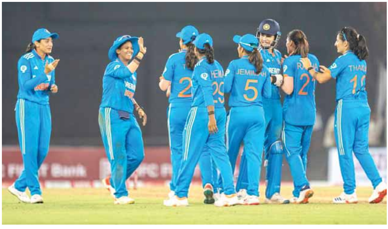
consistency this year. With much at stake, her captaincy and batting have come under scrutiny following India's early exit from the T20 World Cup. Additionally, she will face increased pressure after failing to score in double figures in the last ODI series against Australia. The likes of Jemimah Rodrigues and Deepti Sharma will also be keen to get big scores. The Indian team will miss

The series will give skipper Kaur and coach Amol Majumdar a perfect opportunity to bolster their preparations for the ODI World Cup at home next year. Australia will be without regular skipper Alyssa Healy, who is nursing a knee injury. Additionally, the hosts have not played in this format since March and will be aiming to shake off the rust. "(India) have got superstars ... Always hard-fought and crucial key moments in every game, and while we're at home we're expecting a lot of India support," Australia captain Tahlia McGrath said. For India, Smriti Mandhana will bear the responsibility of providing a solid start with the bat. Besides two single digit scores, the flamboyant opener has been in fine form this year, scoring 448 runs at an impressive average of around 75 in her last six ODIs. Kaur's form will be a significant concern for India, as she has struggled with