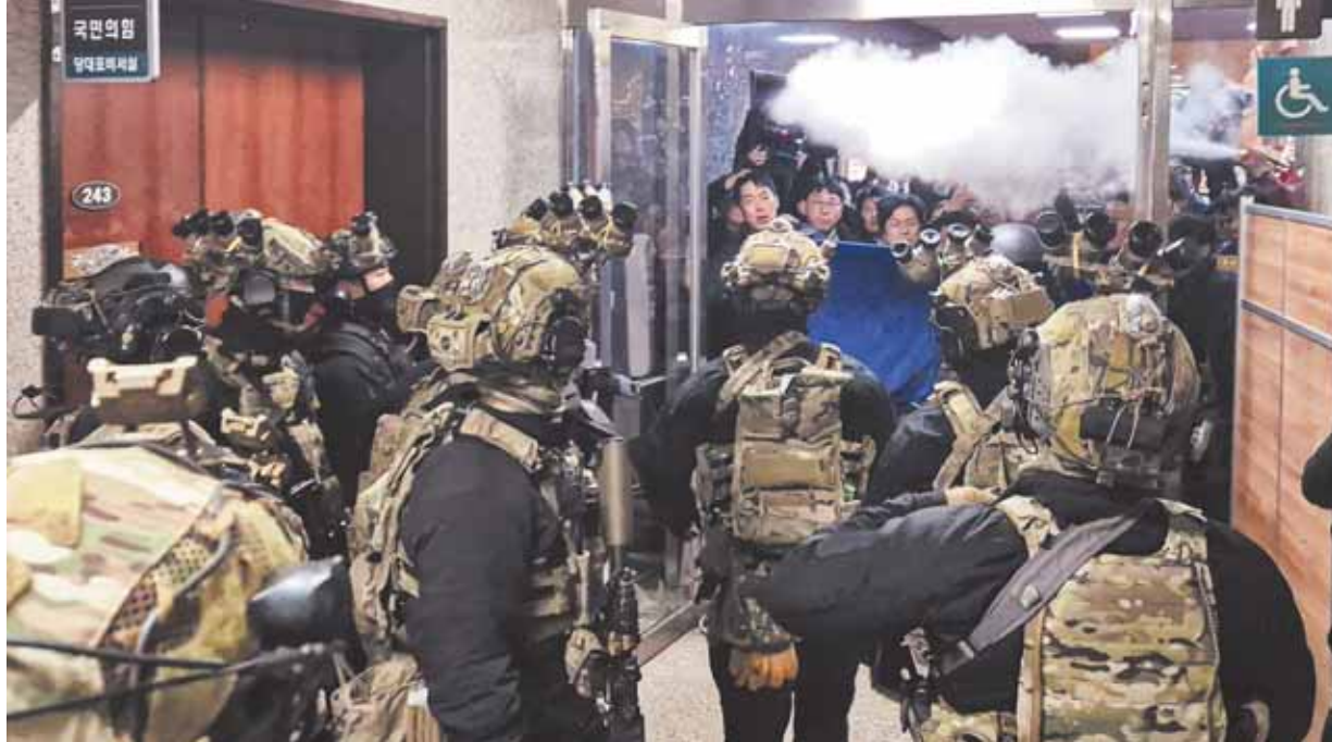
A National Assembly staff sprays fire extinguishers to block soldiers entering the main hall of the National Assembly in Seoul, South Korea, Wednesday.

In his speech announcing the abrupt order Tuesday night, Yoon vowed to eliminate "anti-state" forces and continued to criticise the Democratic Party's attempts to impeach key government officials and senior prosecutors. But martial law lasted only about six hours, as the National Assembly voted to overrule Yoon before his Cabinet formally lifted it around 4:30 a.m. The Democratic Party, which holds a majority in the 300-seat parliament, said Wednesday that its lawmakers decided to call on Yoon to quit immediately or they would take steps to