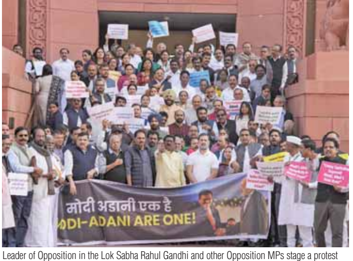
Leader of Opposition in the Lok Sabha Rahul Gandhi and other Opposition MPs stage a protest during the Winter session of Parliament

DEEPAK KUMAR JHA ■ NEW DELHI Fissures are visible in the Opposition's Congress led INDIA Bloc, after the grand old party's massive defeats in the recent Maharashtra and Haryana Assembly elections and not much appreciated performance in the State polls of Jharkhand and Jammu and Kashmir where the party contested with its alliance partners, Jharkhand Mukti Morcha (JMM) and National Conference (NC), respectively. Rather one of the key allies in INDIA Bloc, Trinamool Congress (TMC), on Tuesday pitched for their party supreme West Bengal Chief Minister Mamata Banerjee be made the Bloc leader for all practical purposes, as the woman leader has a "100 per cent record" to take the Bharatiya Janata Party (BJP). Partners like TMC, Samajwadi Party (SP) have raised eyebrows as the alliance could not work in the bypolls of Uttar Pradesh other States and the defeats have been shouldered on Congress. Congress found itself without its key allies, including the SP and TMC during a joint Opposition protest in the Parliament complex on Tuesday.