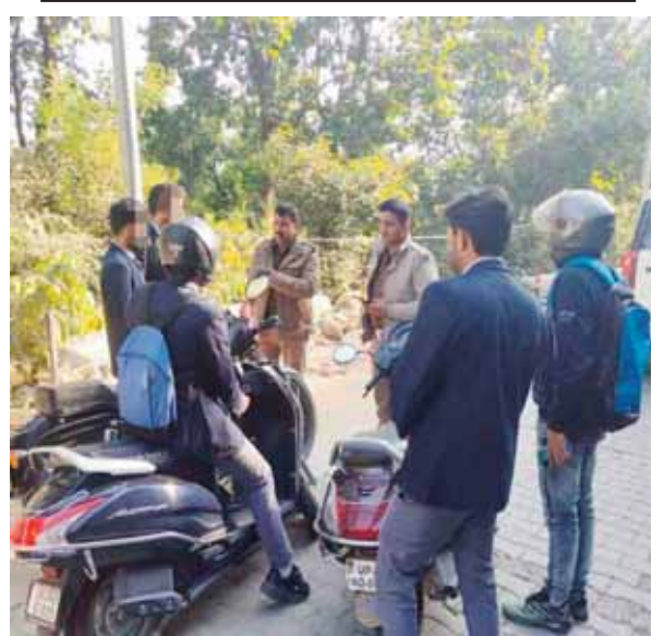
Police penalise riders for traffic violation in Dehradun. At least 271 vehicle users were penalised in the district for violating traffic rules on Tuesday

ers would be appointed in Hindi, while 59 in history, 130 in social science, 130 in economics and 67 in geography would be appointed. In the general category 69 guest teachers would be appointed in Chamoli district, 46 in Rudraprayag, 119 in Pauri, 54 in Tehri, two in Dehradun, one in Haridwar, 17 in Uttarkashi, 58 in Almora, 21 in Nainital, 23 in Bageshwar, 64 in Pithoragarh, 29 in Champawat and eight in Udham Singh Nagar. The minister claimed that the appointment of guest teachers will help in smooth functioning of the schools in remote areas.