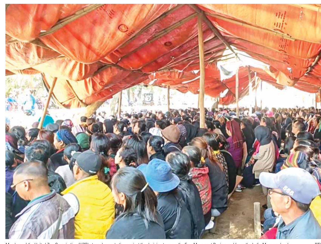
Members of the United Zou Organization (UZO) stage demonstration against the decision to scrap the Free Movement Regime and fence the India-Myanmar border.

Chandigarh has become the country's first administrative unit where 100 per cent implementation of the three criminal laws has been done with Prime Minister Narendra Modi on Tuesday saying these new legislations are becoming protector of citizen's rights and the basis of ease of justice. The laws -- Bharatiya Nyaya Sanhita, Bharatiya Nagarik Suraksha Sanhita and Bharatiya Sakshya Adhiniyam - came into effect on July 1, replacing the British-era Indian Penal Code, Code of Criminal Procedure and the Indian Evidence Act, respectively. Chandigarh has become the country's first administrative unit where 100 per cent implementation of the three laws has been done. Speaking on the occasion, the prime minister said the new criminal laws represent a concrete step towards realising the ideals enshrined in the Constitution for the benefit of all citizens. He said the new laws came into effect at a time when country is moving ahead with the pledge of "Viksit Bharat" and 75 years of adoption of Constitution have been completed, thus the launch of the Bharatiya Nyaya Sanhita, rooted in constitutional values, is a significant occasion.