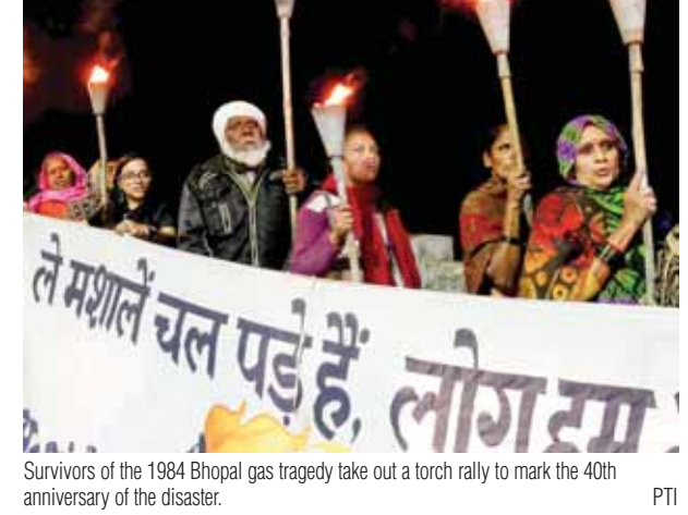
Survivors of the 1984 Bhopal gas tragedy take out a torch rally to mark the 40th anniversary of the disaster.