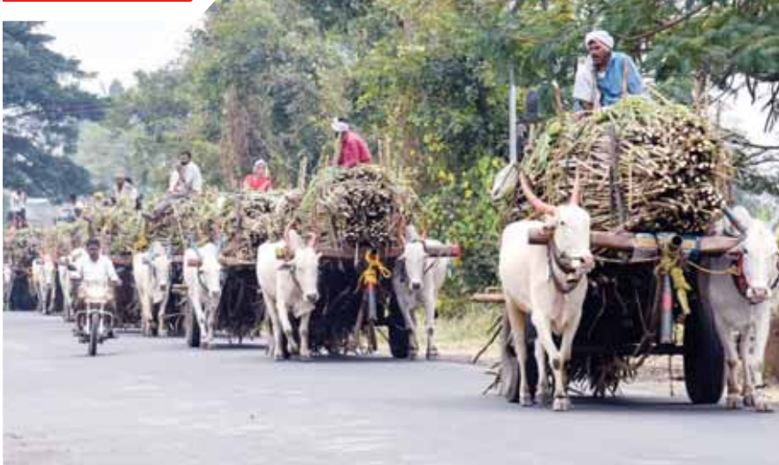
Bullock carts loaded with sugarcane head towards the Sugar Factory for crushing, in Karad