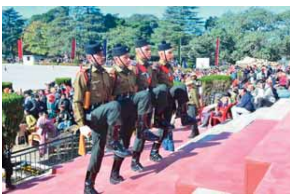
our for the Agniveers as they have been given the singular privilege of joining the Indian Army after getting trained in the Agniveer Course-04.

The batch successfully completed 31 weeks of strenuous training. The reviewing officer of the PoP was the commandant of the Garhwal Rifles regimental centre, Lansdowne. After reviewing the parade, he addressed the newly attested Agniveers. In his address to the young soldiers, the RO encouraged them to unflinchingly discharge their duties in the service of the nation. He emphasised that it was a matter of immense pride and hon-