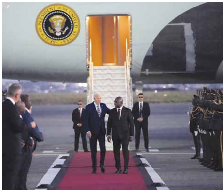
President Joe Biden is greeted by Angolan Foreign Minister Tete Antonio as he arrives at Quatro de Fevereiro international airport in the capital Luanda, Angola long-promised visit to Africa.