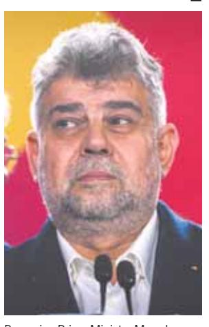
Romanian Prime Minister Marcel Ciolacu, of the Social Democratic Party or PSD, speaks after exit polls in the country's parliamentary elections, in Bucharest, Romania.

through our common will, Romania is reborn," he said. "We are here ... generation after generation, proving that nothing can defeat a united nation." In 2020, the AUR party went from relative obscurity to gaining 9 per cent in a parliamentary vote, allowing it to enter parliament. The party — which proclaims to stand for "family, nation, faith, and freedom" — doubled its support in Sunday's vote to 18.2 per cent. Cristian Andrei, a political consultant based in Bucharest, says the increased parliamentary seats for the far-right will make forming a majority government difficult for the pro-Western parties because they are historically opposition parties and could struggle to reach agreements. "It's not a unified majority, it's a very fragmented one and full of hatred among the parties," he said. "The European side won a majority ... but a majority is very difficult to build, because all those pro-European parties are not enemies, but they fought a lot in the past." In 2021, despite historically being Romania's two main opposition parties that have dominated post-communist politics, the Social Democratic Party and the National Liberal Party formed an unlikely but increasingly strained coalition together with a small ethnic Hungarian party, which exited the Cabinet last year after a power-sharing dispute.