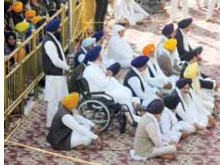
Sukhbir Singh Badal and other leaders of the previous SAD government during the hearing of 'tankhaiya' (guilty of religious misconduct) case by the Akal Takht