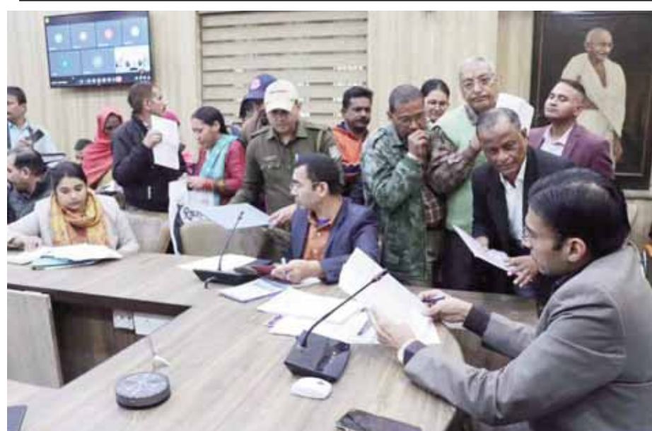
Dehradun district magistrate Savin Bansal addresses grievances of citizens at a public hearing held on Monday.

It was informed in the meeting that under the Uttarakhand water supply programme assisted by World Bank at a cost of Rs 975 crore, water supply is being provided for 16 hours in a day with 100 percent volume metering