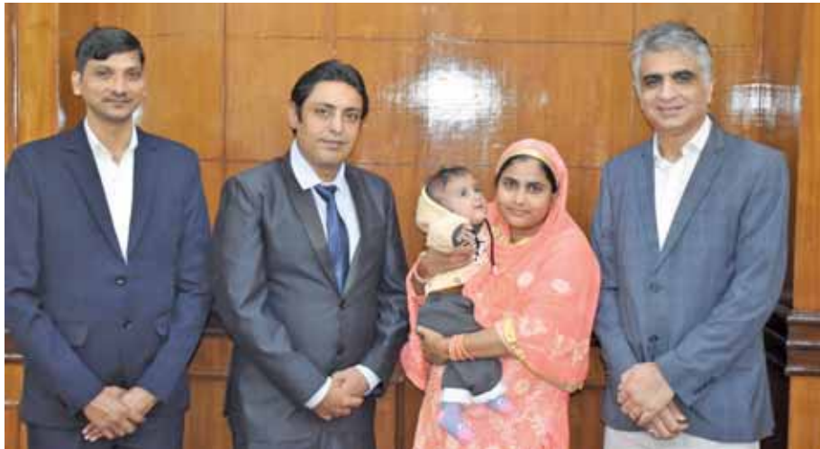
Sarvodaya Hospital, Faridabad achieved medical breakthrough by treating a 5-month-old baby for congenital hearing impairment making him the youngest in India to undergo a cochlear implant surgery.

The 17th edition of CPHI & PMEC India, organised by Informa Markets in India took place at the India Expo Centre, Greater Noida, Delhi-NCR. Over 50,000 global industry professionals, including key decision-makers, gathered to explore new partnerships and growth opportunities. The expo featured forward-thinking discussions on sustainability, digital transformation, and the future of pharma, with a special focus on empowering women in the industry.