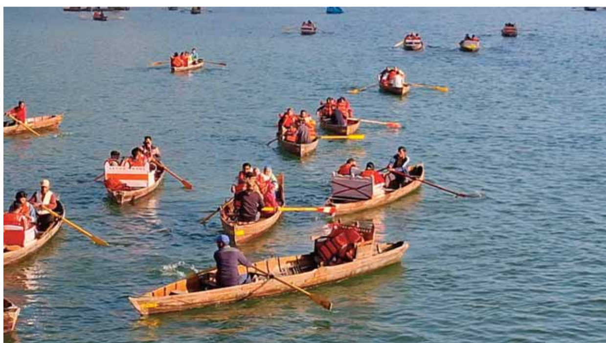
Tourists boating on Naini lake on the weekend in Nainital which saw visitors thronging the lake city