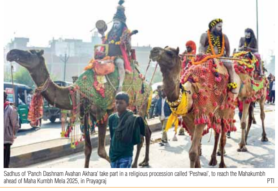
Sadhus of 'Panch Dashnam Avahan Akhara' take part in a religious procession called 'Peshwai', to reach the Mahakumbh ahead of Maha Kumbh Mela 2025, in Prayagraj