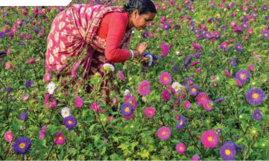
A woman plucks aster flowers at an orchard, in Nadia