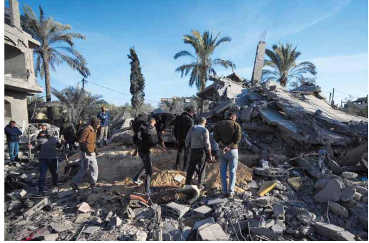
Palestinians look at home destroyed by an Israeli strike late Saturday in Deir al-Balah.

Holocaust, adamantly rejects such allegations. It says it has made great efforts to spare civilians and is only at war with Hamas, which it accuses of genocidal violence in the attack that ignited the war. War grinds on as winter sets in: Hamas-led militants stormed into southern Israel in a surprise attack on Oct. 7, 2023, killing some 1,200 peo-