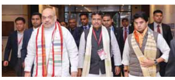
Home Minister Amit Shah with Union Minister for Development of North Eastern Region (DoNER) Jyotiraditya Scindia and Tripura Chief Minister Manik Saha at the 'Bankers Conclave' organised as part of the North Eastern Council, in Agartala.

PIONEER NEWS SERVICE ■ AGARTALA Union Home Minister Amit Shah on Saturday said the time has come for a change in approach of the police force with the end of insurgency in the northeast, in order to ensure that people get speedy justice. Shah, addressing the 72nd plenary of the North Eastern Council (NEC) here, said Prime Minister Narendra Modi has brought peace in the region by inking 20 peace accords in 10 years, leading to the surrender of 9,000 armed militants. "The police fought insurgency in the northeast for the past four decades. As insurgency has now ended, we need to change the approach of the force to ensure people get