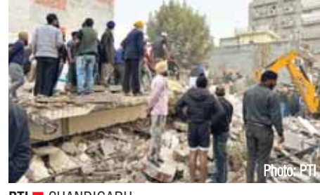
PTI ■ CHANDIGARH

Rescue operations were underway after a multistorey building collapsed in the Sohana village of Punjab's Mohali district on Saturday, officials said. Locals said some people were feared trapped under the debris. The district authorities launched a rescue operation. Two excavators were pressed into