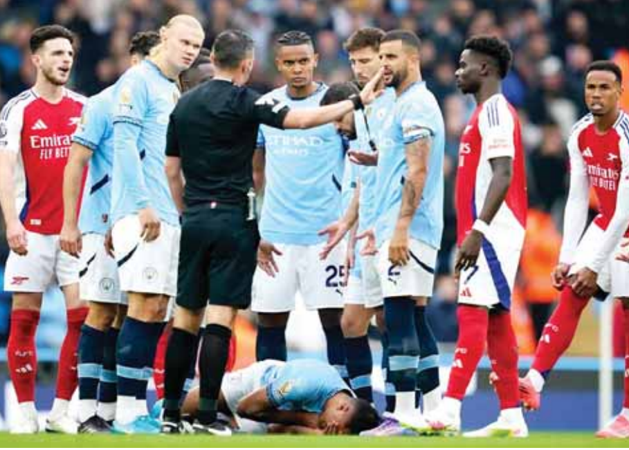
MANCHESTER

One of the most striking moments of soccer in 2024 was when Rodri hobbled onto a stage in Paris on crutches to receive the prestigious Ballon d'Or for best male player of the year. The Manchester City and Spain midfielder had been one of the most outspoken critics against the increasingly congested soccer calendar, warning that the lack of downtime was detrimental to players' performance and health. Then, just a month before the Oct. 28 award ceremony, he tore his ACL during a seemingly routine run in a Premier League game against Arsenal. Though such injuries have occurred throughout the history of the sport and aren't necessarily linked to overplaying, Rodri's season-ending injury became a visual representation of the physical toll of modern soccer at a time when the busy match schedule is facing legal challenges and the possibility of strike action. Top footballers are now routinely playing more than 60 games per season for club and country, while the game is getting faster and more