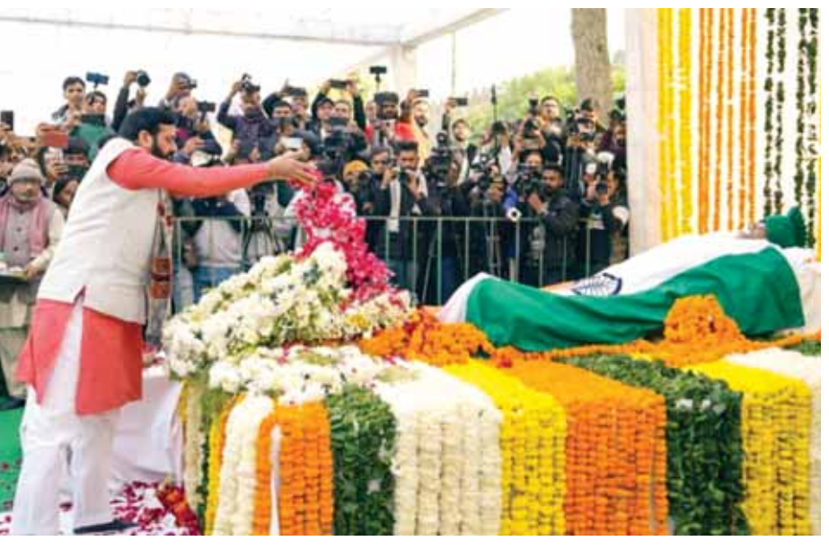
Haryana Chief Minister Nayab Saini pays last respect to the mortal remains of former Haryana chief minister Om Prakash Chautala during his last rites at Teja Khera farmhouse, in Sirsa.