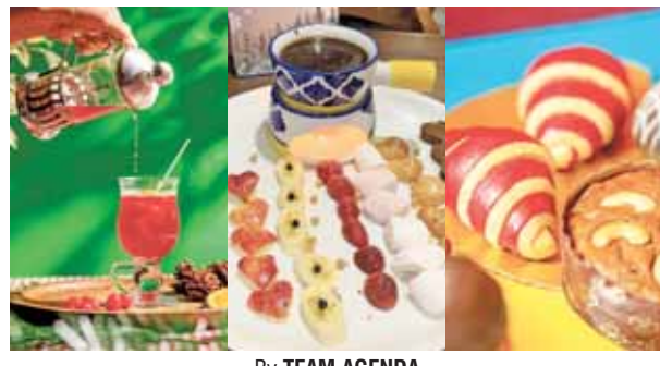
By TEAM AGENDA