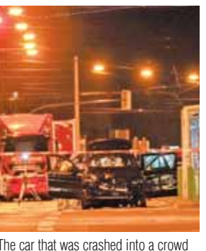
The car that was crashed into a crowd at the Magdeburg