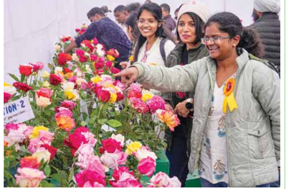
Visitors at the 'All India Winter Rose Show' organised by the New Delhi Municipal Council (NDMC) in association with The Rose Society of India, at India-Africa Friendship Rose Garden, Chanakyapuri