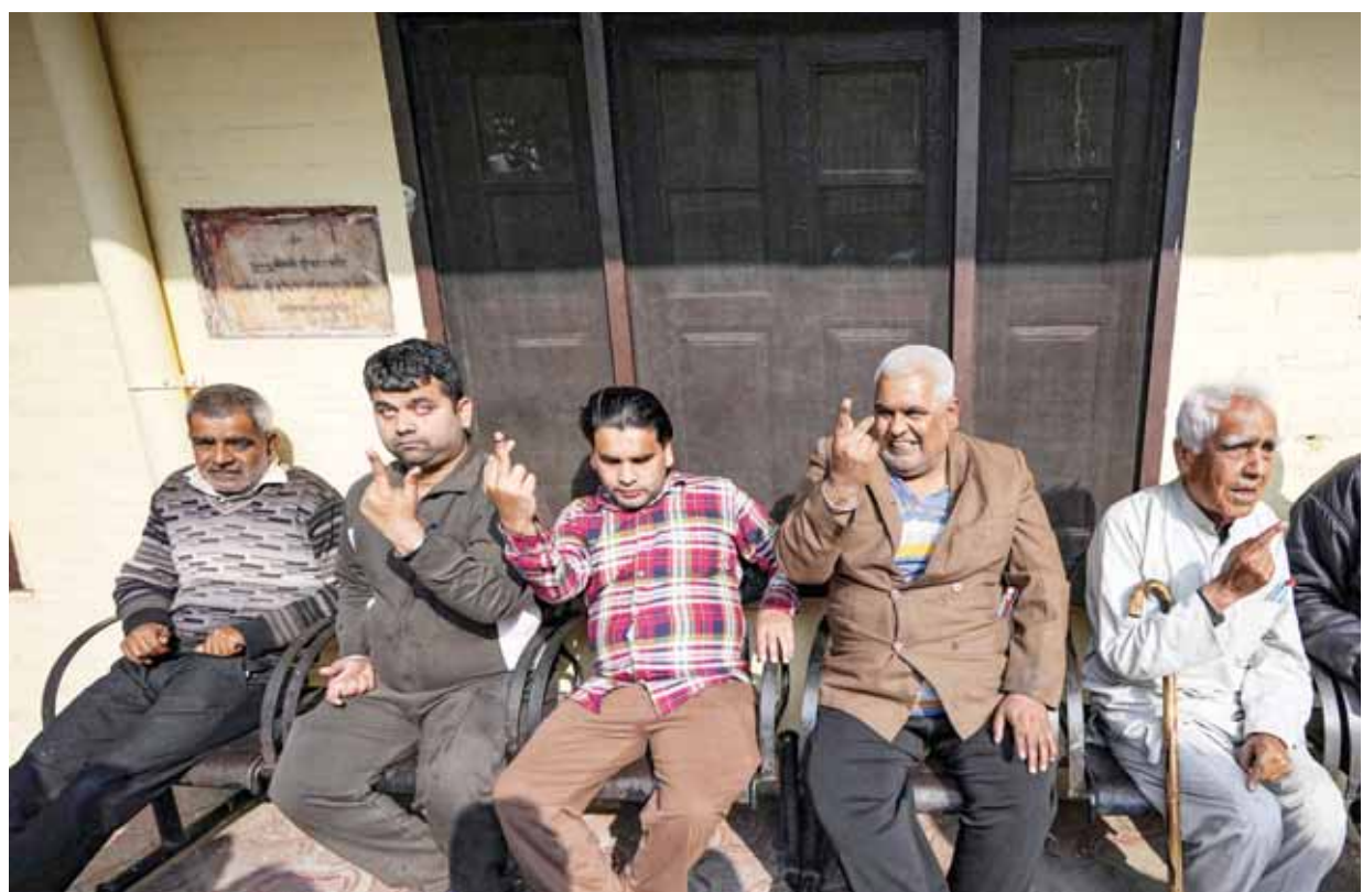
Visually-impaired people show their fingers marked with indelible ink after casting votes during elections in Punjab for five municipal corporations and 44 municipal councils and nagar panchayats, in Amritsar.

PIONEER NEWS SERVICE ■ CHANDIGARH Counting of votes for the elections to five municipal corporations and 44 municipal councils and nagar panchayats in Punjab is underway, officials said on Saturday. Polling began at 7 am and continued till 4 pm amid tight security arrangements. Till 3 pm, the average turnout was 55 per cent. The five municipal corporations that went to the polls are Amritsar, Jalandhar, Ludhiana, Patiala and Phagwara. More than 3,300 candidates are in the fray and a total of 3,809 polling booths have been set up for the civic polls. A total of 37.32 lakh voters, including 17.75 lakh females, were eligible to cast their vote in the elections conducted using electronic voting machines (EVMs). Opposition Bharatiya Janata Party (BJP) and Shiromani Akali Dal (SAD) alleged