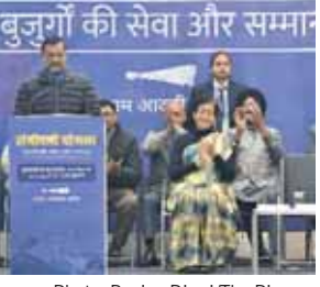
Keiriwal promises free medical treatment for