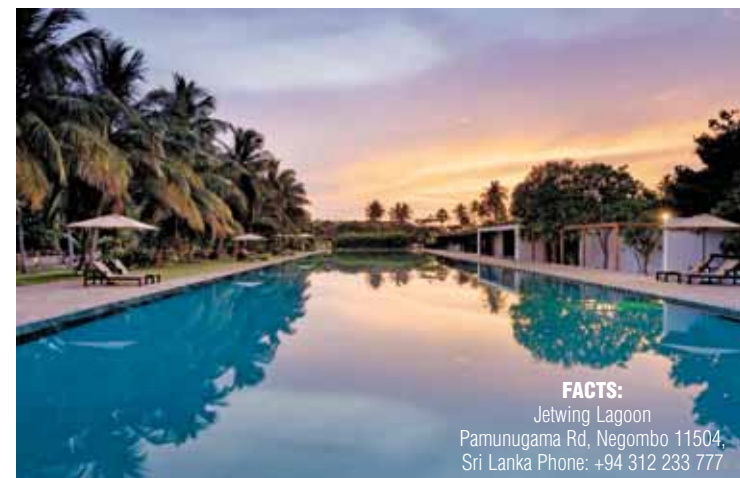
FACTS: Jetwing Lagoon Pamunugama Rd, Negombo 11504, Sri Lanka Phone: +94 312 233 777

The wellness packages integrate these pillars, ensuring that every guest embarks on a transformative journey that inspires lasting lifestyle changes. From slow flow yoga and meditation sessions, luxurious spa treatments, age-old ayurvedic treatments, and nourishing wellness cuisine, we provide a comprehensive approach to rebalancing and restoring your body, mind, and spirit."