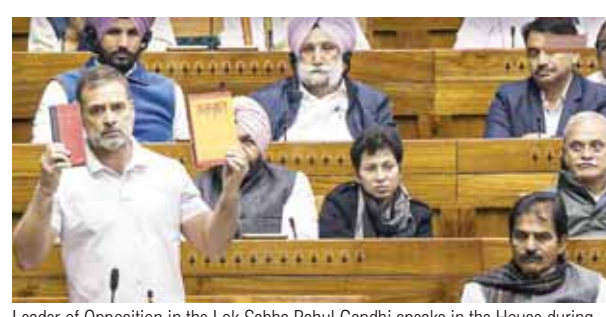
Leader of Opposition in the Lok Sabha Rahul Gandhi speaks in the House during the Winter session of Parliament, in New Delhi, Saturday

Leader of Opposition Rahul Gandhi on Saturday accused the Bharatiya Janata Party (BJP), and the Rashtriya Swayamsevak Sangh (RSS) of being "supporters of Manusmriti" adding that "their supreme leader Savarkar always blamed the Indian Constitution". Participating in a debate in the Lok Sabha on the 75 years of the adoption of the Constitution, the Congress leader said that while talking of protecting the Constitution, the ruling party is "ridiculing" Savarkar. Drawing a parallel with the story of Eklavya who had to chop off his thumb as 'Guru Dakshina' to Dronacharya, Gandhi alleged that by creation of "monopolies" for the Adani Group in various sectors, bringing in the Agnipath scheme, firing teargas at protesting farmers, bringing in lateral entry and allowing paper leaks, the government was "chopping off" the thumb of the youth, tillers, backward class people and the poor. Gandhi said that he wants to tell every poor person that the Constitution protects them, but the BJP keeps attacking it 24x7. He also reiterated his promise made on the floor of the House last session that a caste census will be conducted and the 50 per cent cap on reservation will be done away with to usher in a "new type of development" in the country. "I want to start my speech by