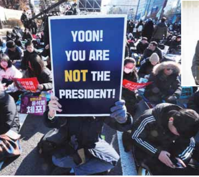
A participant holds up a banner before a rally to demand South Korean President Yoon Suk Yeol's impeachment outside the National Assembly in Seoul, South Korea. (inset) President Yoon Suk Yeol.

from launching provocations by miscalculation. Han asked the foreign minister to inform other countries that South Korea's major external policies remain unchanged, and the finance minister to work to minimize potential negative impacts on the economy by the political turmoil, according to Han's office.