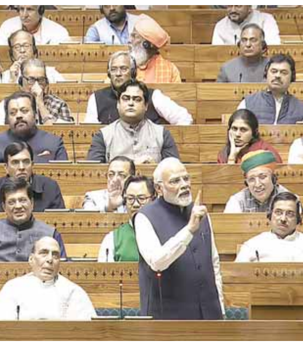
Prime Minister Narendra Modi speaks in the Lok Sabha during the discussion on the 'glorious journey of 75 years of the India Constitution', in the ongoing Winter Session of Parliament