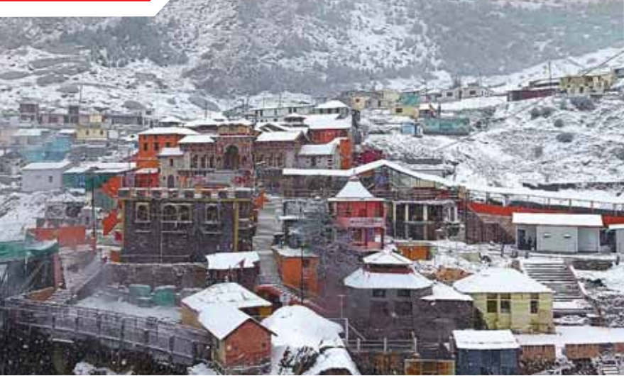
Badrinath Dham receives the first snowfall of the season, in Chamoli