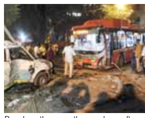
People gather near the wreckage after a BEST undertaking's bus rammed into pedestrians as well as vehicles on a road at Kurla, in Mumbai

march at Chanakyapuri against alleged atrocities and human rights violations against Hindus and other minorities in Bangladesh. Police had put barricades on the Teen Murti Marg on both the carriageway outside the Chanakyapuri police station where hundreds of people from various organisations gathered. Traffic was regulated in the area with vehicles redirected to alternative routes. There have been allegations of over 200 attacks on Hindus in various districts of Bangladesh since the fall of the Sheikh Hasina-led Awami League government on August 5.