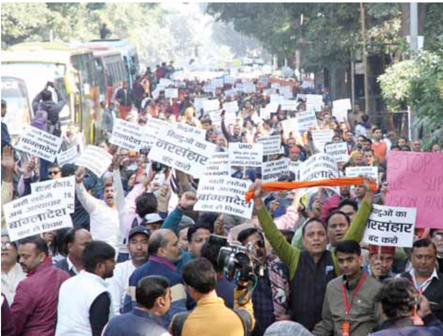
Social Organisations of Delhi organised a protest march on Bangladesh Embassy against the attacks on Hindus and human rights violations in Bangladesh at Teen Murti Chowk, in New Delhi on Tuesday