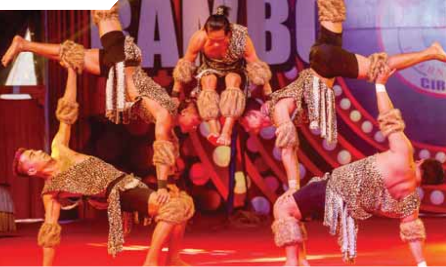
Artists perform during a show of Rambo Circus, in Mumbai