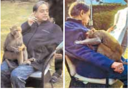
Congress leader Shashi Tharoor reads a newspaper while a monkey sits on his lap