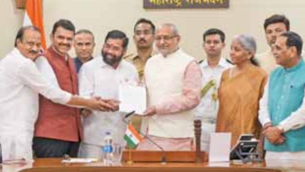
BJP leader Devendra Fadnavis with Shiv Sena chief Eknath Shinde, NCP chief Ajit Pawar and BJP Central Observers Nirmala Sitharaman and Vijay Rupani meet Maharashtra Governor C P Radhakrishnan to stake claim to form the new Maharashtra Government