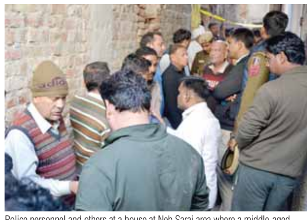
Police personnel and others at a house at Neb Sarai area where a middle-aged couple and their daughter were found dead