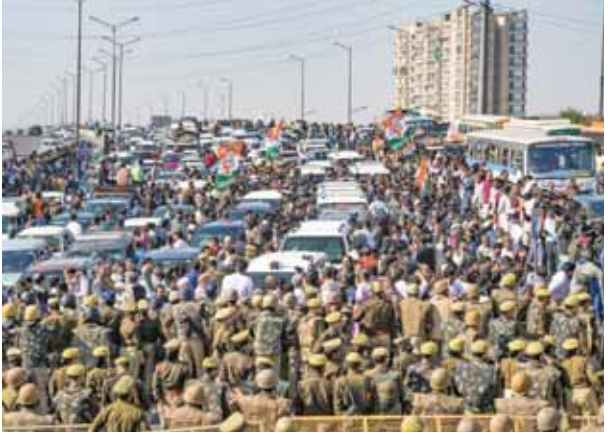
Police stop Leader of Opposition in the Lok Sabha Rahul Gandhi and Congress supporters at the Ghazipur border while they were on the way to visit the violence-hit Sambhal district, in Ghaziabad

Congress leaders Rahul Gandhi and Priyanka Gandhi Vadra, who were heading towards violence-hit Sambhal in Uttar Pradesh, were stopped at the Ghazipur border between Delhi and Noida, causing a high-voltage drama, leading to massive traffic jams during the morning peak hours. The traffic congestion at Delhi-Meerut Expressway in Ghaziabad worsened as Congress workers gathered there ahead of Rahul and Priyanka's planned visit to Sambhal. The Congress workers defied barricading and also engaged in a scuffle with the commuters on the stretch, who faced a harrowing time reaching their destinations due to the traffic congestion. Long queues of vehicles could be seen at the border, leaving commuters frustrated. Many people got stuck in the jam at the Delhi-UP Ghazipur border, which led to their work being affected, and as a result, some lost their cool. Some couldn't reach their offices, while others missed their exams. The situation was