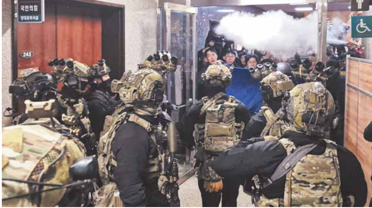
A National Assembly staff sprays fire extinguishers to block soldiers entering the main hall of the National Assembly in Seoul, South Korea, Wednesday.

South Korea's opposition parties Wednesday submitted a motion to impeach President Yoon Suk Yeol over the shocking and short-lived martial law that drew heavily armed troops to encircle parliament before lawmakers climbed walls to reenter the building and unanimously voted to lift his order. Impeaching Yoon would require the support of two-thirds of parliament, and at least six justices of the nine-member Constitutional Court would have to endorse it to remove him from office.