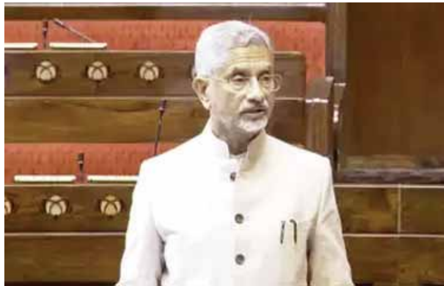
He said with the task of disengagement completed, it is now our expectation that discussions would commence in regard to the remaining issues that we had placed on the agenda.

said disengagement has now been achieved in full in eastern Ladakh through a step-by-step process, culminating in Depsang and Demchok. He had earlier made an identical statement in the Lok Sabha on Tuesday. Jaishankar, in his statement, said India was and remains very clear that the three key principles must be observed in all circumstances, he said explaining: "one: both sides should strictly respect and observe the Line of Actual Control (LAC), two: neither side should attempt to unilaterally alter the status quo, and three: agreements and understandings reached in the past must be fully abided by in their entirety". "Our relationship has progressed in many domains, but was obviously negatively affected by recent events. We are clear that the maintenance of peace and tranquility in border areas is a pre-requisite for the development of our ties. In the coming days, we will be discussing both de-escalation as well as effective management of our activities in the border areas," he said.