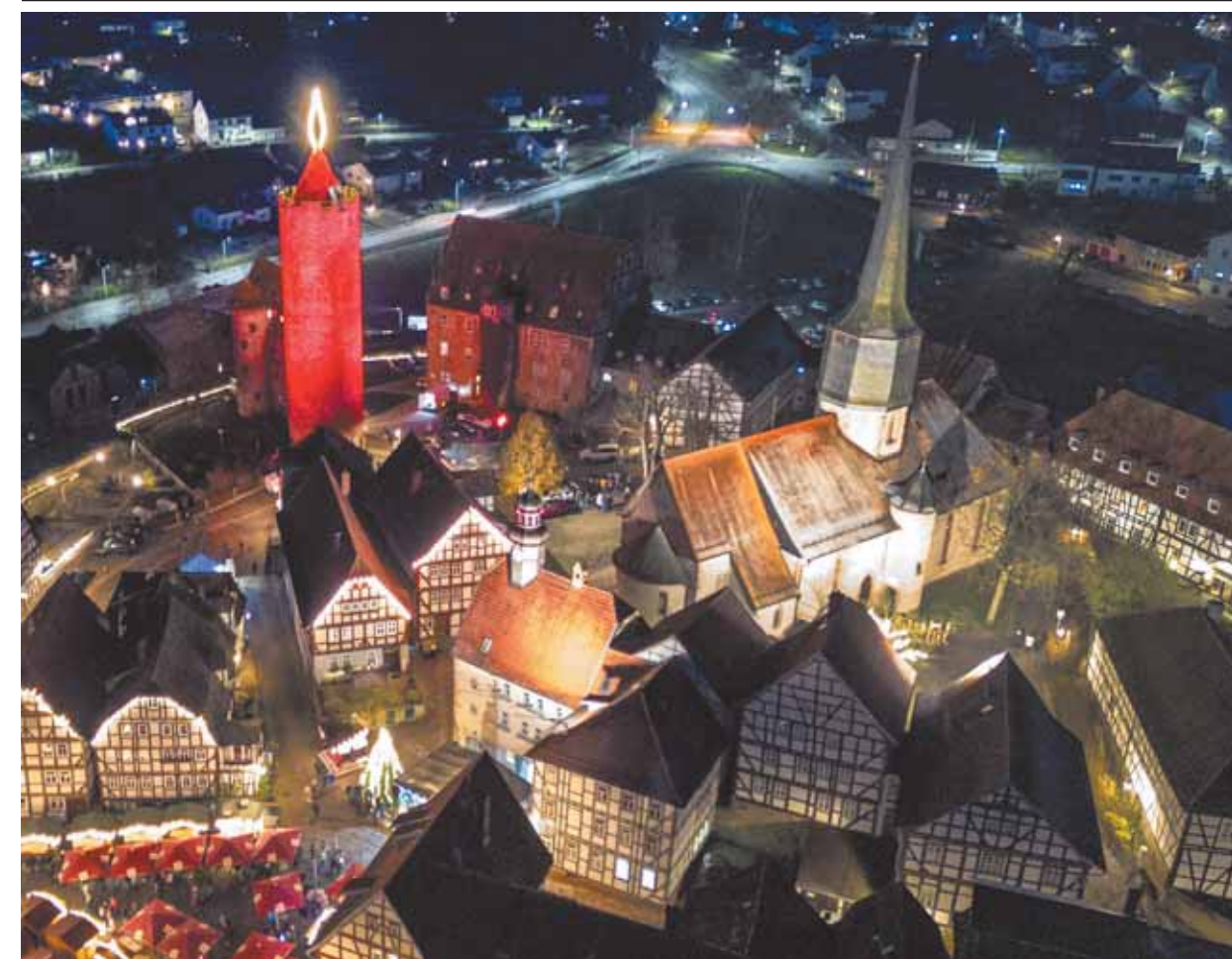
A 42-meter-high candle which is an illuminated medieval tower shines in the historic city centre of Schlitz, Germany.

parties, including the JUI-F, the Jamaat-i-Islami, and the Balochistan National Party (BNP-Mengal) for opposing a similar resolution in the Balochistan Assembly. Qureshi reiterated that imposing the governor's rule and proscribing PTI would hurt the federation. "Can the government attain economic stability without political stability or achieve IMF (funding)," he asked while addressing Finance Minister Muhammad Aurangzeb. "You can attain stability through authoritarian rule but it will not be sustainable. You can get desired results through election engineering but will fail to get legitimacy," Qureshi cautioned the people at the helm of affairs. Martin Raiser, the World Bank's Regional Vice-President for South Asia, recently said that Pakistan's economy is stuck in a low-growth trap with poor human development outcomes and increasing poverty.