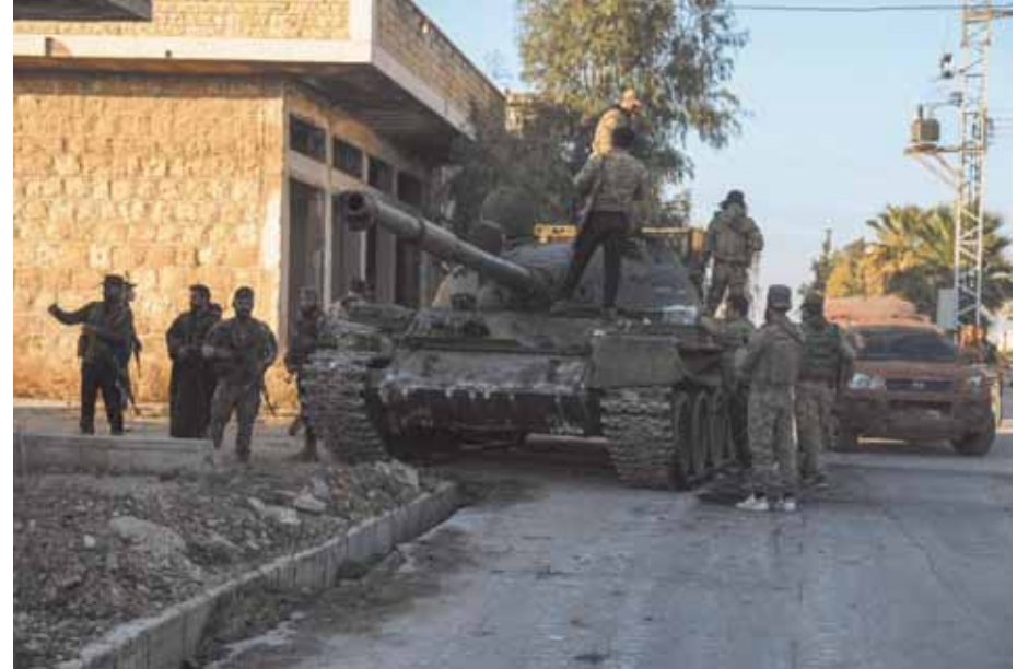
Syria opposition fighters stand atop a captured Syrian army tank in the town of Maarat al-Numan, southwest from Aleppo, Syria. Thousands of Syrian insurgents have fanned out inside Syria's largest city Aleppo a day after storming it with little resistance from government troops.