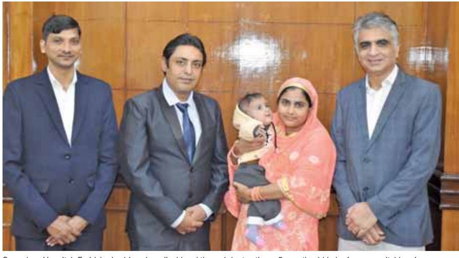
Sarvodaya Hospital, Faridabad achieved medical breakthrough by treating a 5-month-old baby for congenital hearing impairment making him the youngest in India to undergo a cochlear implant surgery.

The 17th edition of CPHI & PMEC India, organised by Informa Markets in India took place at the India Expo Centre, Greater Noida, Delhi-NCR. Over 50,000 global industry professionals, including key decision-makers, gathered to explore new partnerships and growth opportunities. The expo featured forward-thinking discussions on sustainability, digital transformation, and the future of pharma, with a special focus on empowering women in the industry.