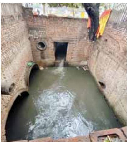
A dug up drain and an open drain near the Saket metro station