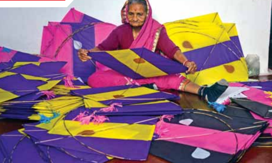
An elderly woman makes kites for the upcoming Makar Sankranti kite festival, in Hyderabad