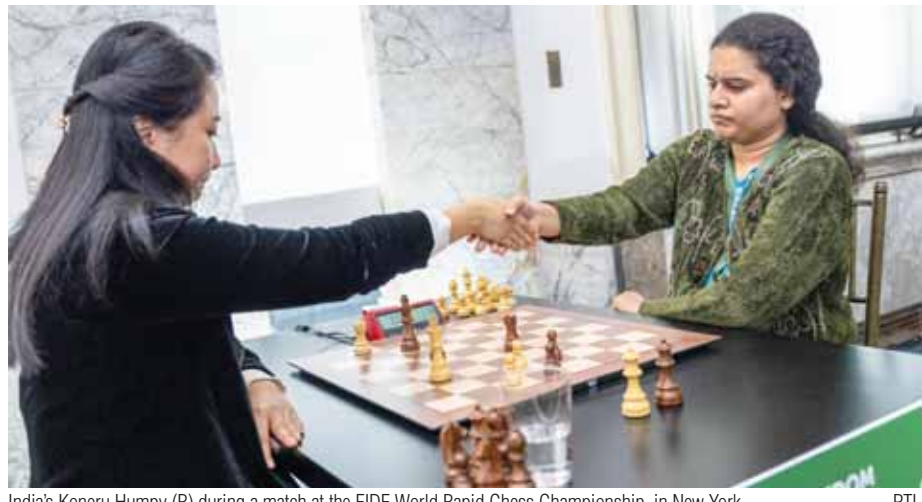
India's Koneru Humpy (R) during a match at the FIDE World Rapid Chess Championship, in New York

India's Koneru Humpy bagged an epochal second World Rapid Chess Championship title, beating Irene Sukandar of Indonesia here on Sunday. Humpy had won the event back in 2019 at Georgia and the Indian No 1 is only the second player after China's Ju Wenjun to clinch the title more than once. The 37-year-old Humpy finished the tournament with 8.5 out of 11 points. "I'm very excited and I feel very happy. In fact, I expected it to be a very tough day, like some sort of tie-break. But when I finished the game, I only got to know when the arbitrator told me, and it was a tense moment for me," said Humpy, who began with