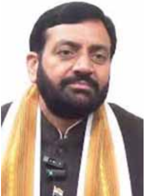
starting January 14, 2025, emphasizing its cultural and traditional importance. Lakhs of devotees from India and abroad participate in this event, he added.

The Chief Minister said that the Prime Minister also talked about the upcoming Maha Kumbh in Prayagraj