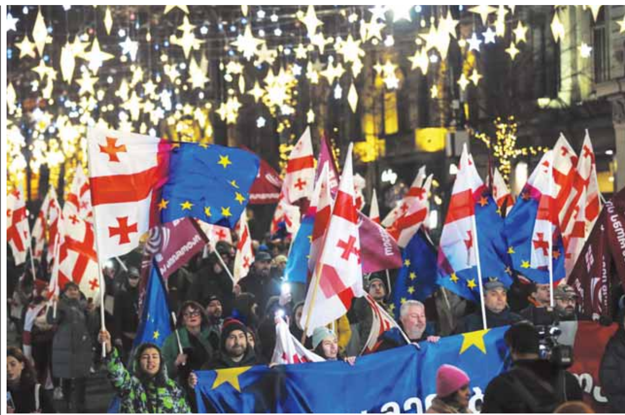
Demonstrators with Georgian national and EU flags march during an anti-government rally outside the Parliament building in Tbilisi, Georgia, on Saturday.

to a ceasefire and hostage release with Hamas. Families of the hostages and their supporters have held weekly mass demonstrations for months, and diplomats have reported recent progress in the long-running indirect talks. Strike on a hospital in Gaza City kills 7: An Israeli strike on the upper floor of a hospital in Gaza City on Sunday killed at least seven people and wounded several others, according to the Civil Defense, first responders affiliated with the Hamas-run government. The Israeli military said it struck a Hamas control centre inside the building, which it said was no longer serving as a hospital. Israel's offensive has killed over 45,000 Palestinians and wounded more than 1,00,000, according to local health authorities. They say women and children make up more than half the fatalities but do not distinguish between militants and civilians in their count. Israel says it has killed over 17,000 militants, without providing evidence. Israel's bombardment and ground operations have displaced some 90 per cent of Gaza's population of 2.3 million people, often multiple times. Vast areas of the territory, including entire neighbourhoods, have been pounded to ruins, and critical infrastructure has been destroyed. Israeli restrictions, ongoing fighting and the breakdown of law and order have hindered the delivery of humanitarian aid, raising fears of famine, while widespread hunger has left people at greater risk of disease and death.