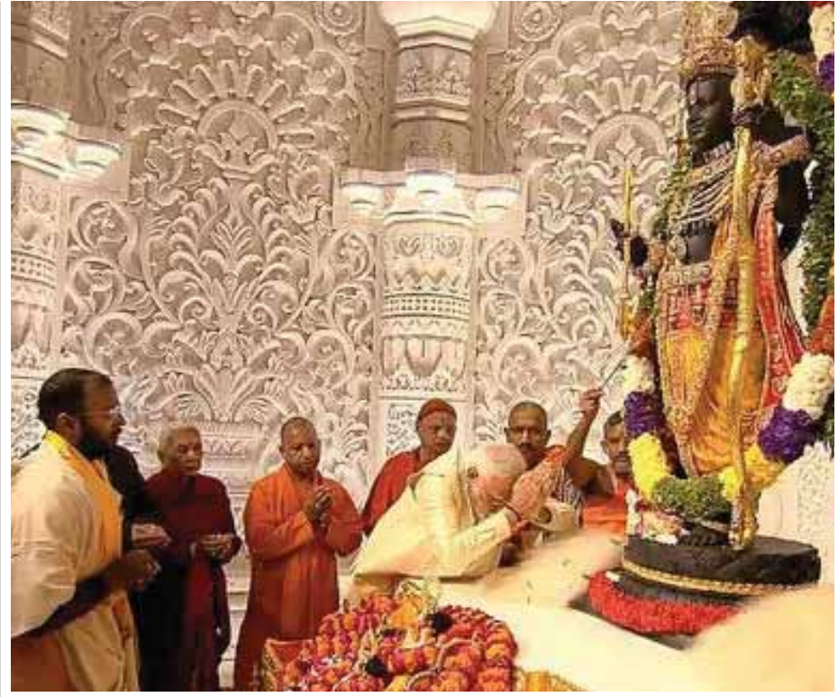
The ceremonial installation of Lord Ram's idol in Ayodhya's temple positioned UP as a symbol of cultural and spiritual significance.

days for their first year of employment were not being fully counted. "For instance, employees whose date of joining falls after May and before December would not meet the 240-day service requirement for their first calendar year of service, thus affecting their job security," it said. "In addition, for the year 2024, employees raised concerns as the number of days until the cut-off date of August 15, 2024, is only 227, which falls short of the required 240 days," it added. In response to these requests, the Haryana Cabinet has approved the amendment to consider 240 days of service during a period of one year of contractual service, thereby addressing these issues and ensuring better job security for contractual employees, it said. Under the Haryana Contractual Employees (Security of Service) Act, 2024, the benefit of job security is admissible to those contractual employees who fulfil the five years contractual service between August 15, 2024, the statement added.