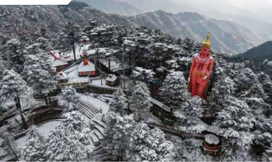
The Jakhu Temple and its premises covered with snow after fresh snowfall, in Shimla