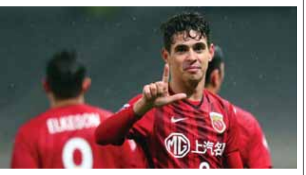
together." Oscar joined Sao Paulo on a free transfer. Neither the Brazilian club nor the player disclosed the duration of their deal, but local media reports said he signed a three-year contract. Oscar is returning to a club he sued to leave for another Brazilian team, Internacional, in 2010.