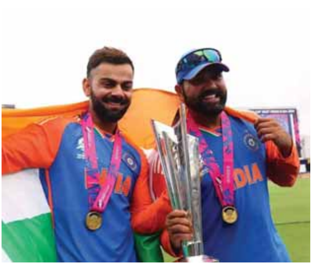
with the coveted trophy in their hands. It was also a fitting farewell for head coach Rahul Dravid, whose tenure drew to a close. Change of guard in coaching: Surya's unexpected elevation With Rohit calling it a day, it was expected that Hardik will lead the T20 side into the

fearless approach that demoralised opposition attacks. His approach was best summed up in the Super 8 game against Australia where he tore into the likes of Mitchell Starc and Pat Cummins to make all the difference in the game. His opening partner Kohli was not able to make the contributions that were expected out of him but the superstar came up with an innings of immense substance when it mattered the most -- his not-so-fluent 76 of 59 balls kept India in the final after a poor start. The contributions from all-rounder Hardik Pandya, future captain Suryakumar Yadav and Rishabh Pant, playing his first international event following his comeback from a life-threatening car accident, were also noteworthy. A better script could not have been written for the likes of Rohit and Kohli, who got to say goodbye to the T20 format