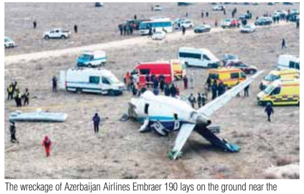
The wreckage of Azerbaijan Airlines Embraer 190 on the ground near the airport of Aktau, Kazakhstan.

An Azerbaijani airliner with 67 people onboard crashed Wednesday in the Kazakhstani city of Aktau, leaving at least 32 survivors, according to officials. More than 30 people are likely dead. Kazakhstan's Emergency Ministry said in a Telegram statement that those on board included five crew. At least 29 have been hospitalised, the ministry told Russia's state news agency RIA Novosti. Russian news agency Interfax quoted medical workers as saying that four bodies have been recovered and emergency workers at the scene as saying that both pilots, according to a preliminary assessment, died in the crash. The Embraer 190 aircraft made an emergency landing three kilometres from the city, Azerbaijan Airlines said earlier. Kazakhstan's Emergency Ministry initially said 25 people survived the crash, later revising that number to 27, 28, and then 29 as the search and rescue operation continued at the site of the crash, bringing the supposed death toll down. The Prosecutor General's Office in Azerbaijan later reported that at least 32 people survived the crash, adding that the number wasn't final. The number of