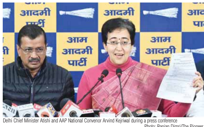
Delhi Chief Minister Atishi and AAP National Convener Arvind Kejriwal during a press conference.

Yojana, reaffirming the legitimacy of the scheme. The fresh controversy will add another dimension to the ongoing tussle between the AAP and the bureaucracy, with accusations flying between parties. The move underlines the tenuous relationship between the bureaucracy and the elected Delhi Government after an amendment to the Government of National Capital Territory of Delhi (GNCTD) Act, the services department comes under the control of the Lieutenant Governor. The latest flashpoint, which comes weeks ahead of the Delhi Assembly polls, sparked a slugfest between the AAP and BJP leaders. The BJP has accused the ruling party of duping people, since the two schemes have not been approved yet. The Department of Women and Child Development (WCD), in a public notice in newspapers, has said the Mukhyamantri Mahila Samman Yojana does not exist and has not been approved by the Delhi government. It has urged