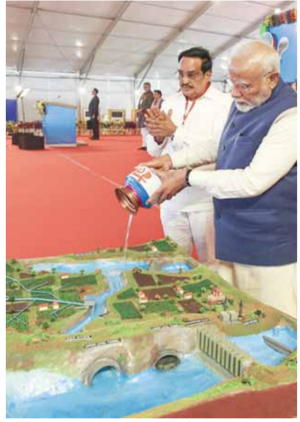
Prime Minister Narendra Modi with Union Minister CR Patil during the foundation stone laying ceremony of Ken-Betwa River Linking Project, in Khajuraho, Madhya Pradesh.

The ambitious first of its kind interlinking of the Ken-Betwa River as desired by former Prime Minister late Atal Bihari Vajpayee two decades ago, finally kick started with the foundation stone laying by PM Narendra Modi on Wednesday which also marked the birth anniversary of the political stalwart Bharat Ratna Vajpayee. The Vajpayee government had proposed river linking as a solution for irrigation needs as well as for dealing with floods. Modi laid the foundation stone of the Rs 44,600 crore Ken-Betwa River Link Project at Khajuraho in Madhya Pradesh and said the river linking will open new doors of prosperity and happiness in the Bundelkhand region. Union Water Resources Minister C R Patil and Madhya Pradesh Chief Minister Mohan Yadav handed over two kalash (urns) containing water from Betwa and Ken rivers, respectively, to Modi, who poured it over a model of the project to launch the river linking work. As per the initial estimation of the project, nearly 44 lakh people in 10 districts of Madhya Pradesh and 21 lakh in Uttar Pradesh will get drinking water under the project. Nearly 7.18 lakh agricultural families in 2,000 villages will benefit from the project, which will also generate 103 MW of