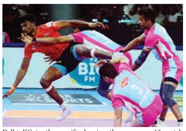
Delhi KC in the semifinals scheduled for Friday. Table toppers Haryana Steelers, who are through to the semi-finals, are gunning for their first PKL title while Dabang Delhi KC have been one of the best teams this season and have stitched

PTI ■ PUNE UP Yoddhas will play Jaipur Pink Panthers, while Patna Pirates will be up against U Mumbai in the eliminators of the Pro Kabaddi League here on Thursday. In the fray for the top prize are Haryana Steelers and UP Yoddhas, both of whom have never won the title, and along with them are three-time champions Patna Pirates, season 8 winners Dabang Delhi KC, season 1 and 9 title holders Jaipur Pink Panthers, and season 2 champions U Mumba, who sealed qualification for the playoffs with the last game of the league stage. The winners of the eliminators will take on Haryana Steelers and Dabang