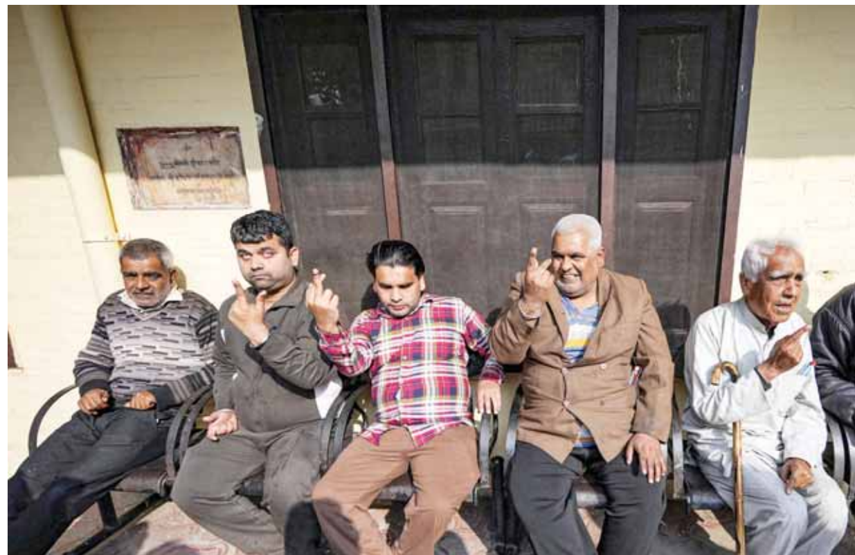
Visually-impaired people show their fingers marked with indelible ink after casting votes during elections in Punjab for five municipal corporations and 44 municipal councils and nagar panchayats, in Amritsar.