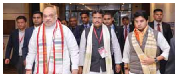
Home Minister Amit Shah with Union Minister for Development of North Eastern Region (DoNER) Jyotiraditya Scindia and Tripura Chief Minister Manik Saha at the 'Bankers Conclave' organised as part of the North Eastern Council, in Agartala.