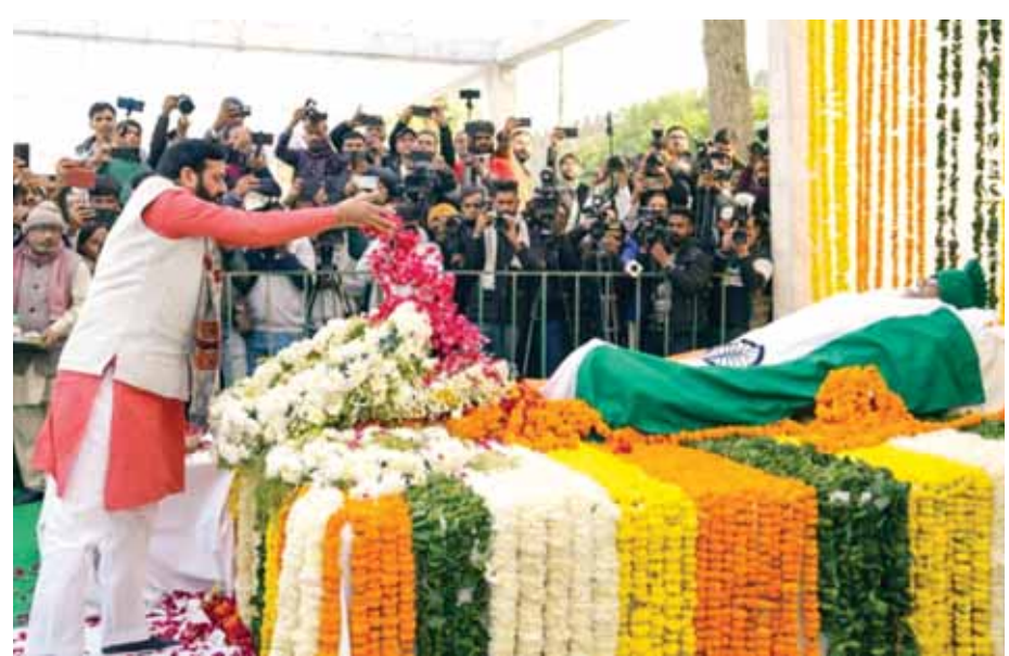
Haryana Chief Minister Nayab Saini pays last respect to the mortal remains of former Haryana chief minister Om Prakash Chautala during his last rites at Teja Khera farmhouse, in Sirsa.

emphasis on the upliftment of people in rural areas by promoting vegetable cultivation, production of milk, eggs and meat.