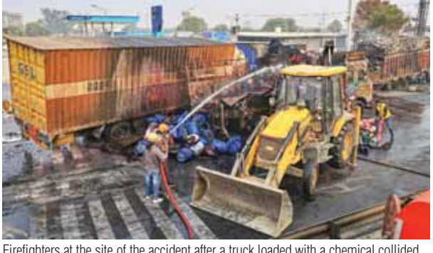
Firefighters at the site of the accident after a truck loaded with a chemical collided with some other vehicles and caught fire on the Jaipur-Ajmer Highway

PIONEER NEWS SERVICE ■ JAIPUR At least 11 people were killed and about 35 injured after an LPG tanker collided with a truck on Friday here sparking a massive fireball. It turned a stretch of the Jaipur-Ajmer highway into an inferno and nearly 40 vehicles were gutted. President Droupadi Murmu, Prime Minister Narendra Modi, Home Minister Amit Shah, Rajasthan Governor Haribhau Bagade, Chief Minister Bhajanlal Sharma and his predecessor Ashok Gehlot expressed grief over the loss of lives in the crash.