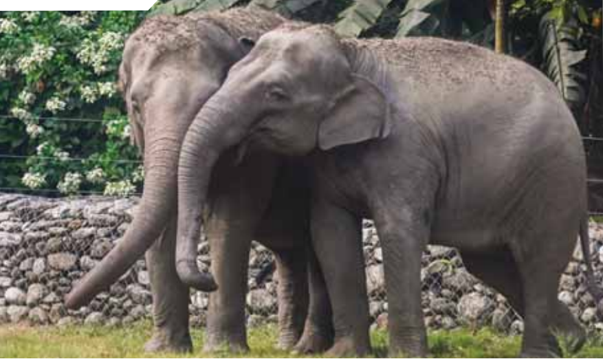
Elephants inside an enclosure at Alipore Zoological Garden in Kolkata

How the Places of Worship Act (1991) is being dealt with at present is due to many not being aware of how and why the Act came about. Evidently, the then Prime Minister PV Narasimha Rao (1991-96) in his heart of hearts was a staunch Hindu. He was anxious to contribute to help solving the then existing—or festering—problem at Ayodhya. Most developments that took place at the Janmasthan on December 6, 1992, spoke of Rao's silent participation in the cause of Ram Lalla.