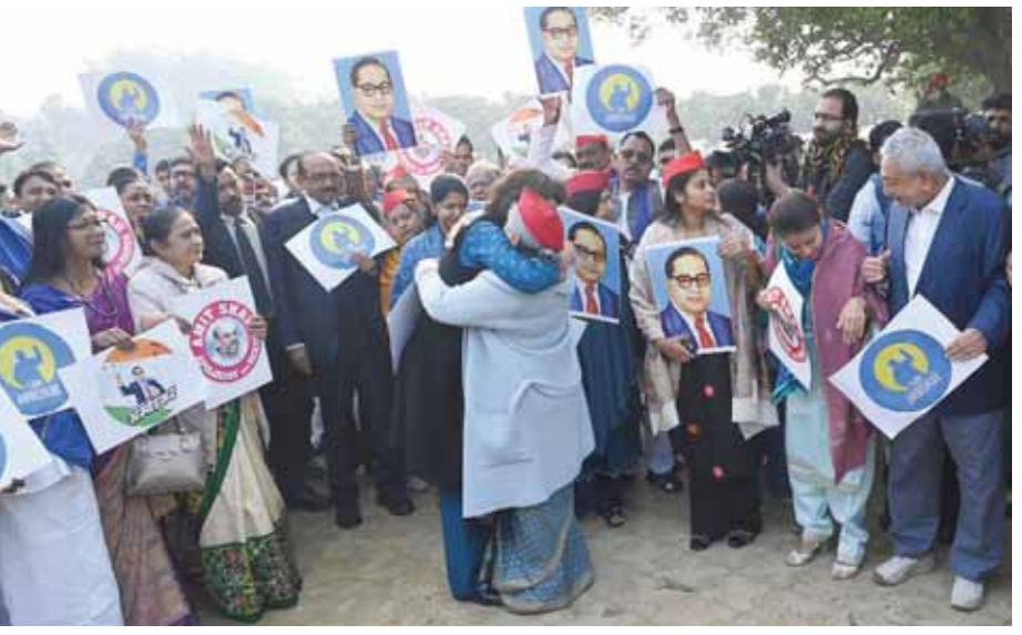
Congress MP Priyanka Gandhi Vadra greets Samajwadi Party MP Jaya Bachchan during INDIA bloc MPs' protest against Home Minister Amit Shah over his remarks related to Dr BR Ambedkar, at Vijay Chowk