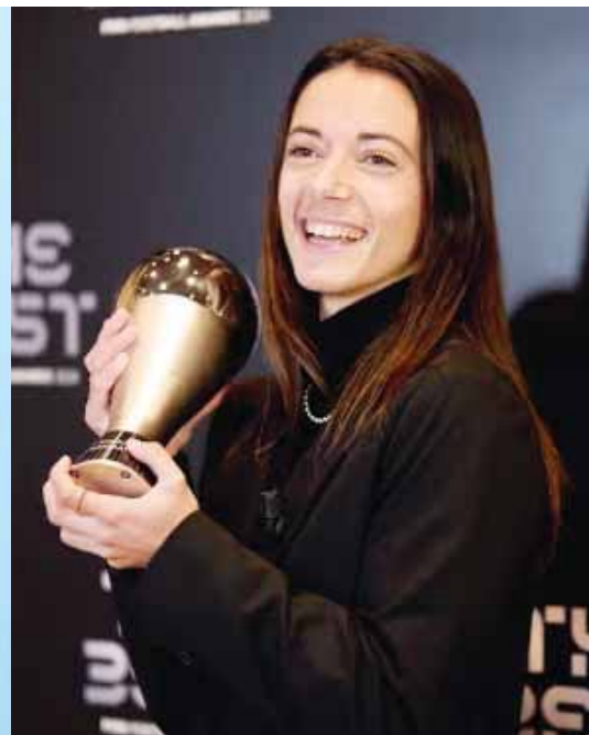
making it back-to-back prizes at FIFA's version of the older and more prestigious Ballon d'Or prize. The 26-year-old Spain midfielder has won the Ballon d'Or for two

straight years, and won the Spanish league, Spanish cup and Champions League with Barcelona in 2024. "I am grateful to receive this award. As I always say, this is a team effort," Bonmati said. "It was a great year, very difficult to repeat. I am grateful to the people who help me to be better every day, from the club, to my teammates, who always help me to be better." FIFA said the award winners were decided by an "equally weighted voting system" by fans, the current captains and coaches of all national teams, and media representatives. There was an 11-player shortlist for both awards, with the contenders selected based on their performances from Aug. 21, 2023, to Aug. 10, 2024. Vinicius had the best season of his career, scoring 24 goals in 39 appearances for Madrid and helping the Spanish team to a record-extending 15th European Cup — and his second Champions League trophy.