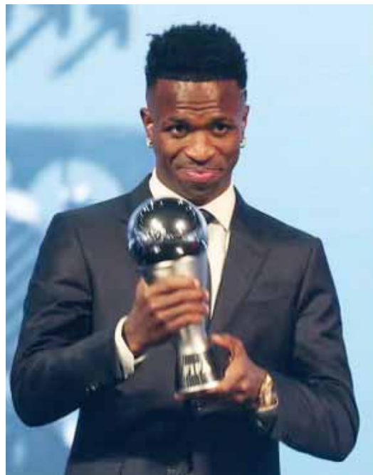
added "I'll keep fighting." Bonmati won the award for best women's player of the year

here. I was a kid who only played football barefoot on the streets of São Gonçalo, close to poverty and crime. "Getting here is something very important to me. I'm doing it for many children who think that everything is impossible and who think they can't get here." Vinicius echoed those sentiments in an Instagram post, where he took a thinly-disguised dig at presumably the Ballon d'Or voters — journalists from the top 100 countries in the FIFA rankings. "Today I am writing to that boy who saw so many idols lift this trophy... Your time has come," he wrote. "Or rather, my time has come. The time to say... Yes, I am the best player in the world and I fought hard for it. "They tried and still try to invalidate me, to diminish me. But they are not prepared. No one is going to tell me who I should fight for, how I should behave." Vinicius has been subjected to racist abuse in Spain and at one point earlier this year said he was "losing my desire to play" but