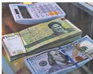
Masoud Pezeshkian was sworn in and began his term, the rate was 584,000 to $1. Trump unilaterally withdrew

America from the accord in 2018, sparking years of tensions between the countries that persist today.