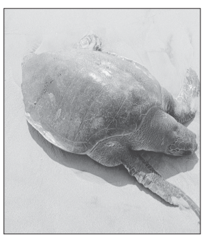
Though the State Forest Department has prohibited fishing 20 km off the sea coast, but the illegal fishing is going on in the prohibited zone as the Forest Department has failed to drive away the fishermen

catching fish. If sources are to be believed carcasses of Olive Ridley sea turtles were spotted in the beach of Lanch Khola under the Gahirmatha Marine Sanctuary. The turtles are killed when they are trapped and get entangled in the nets of mechanized fishing vessels during the mating season which starts from December to March. Hundreds of endangered Olive Ridelys were mercilessly killed every year after they get entangled with the fishing nets of the mechanised trawlers.