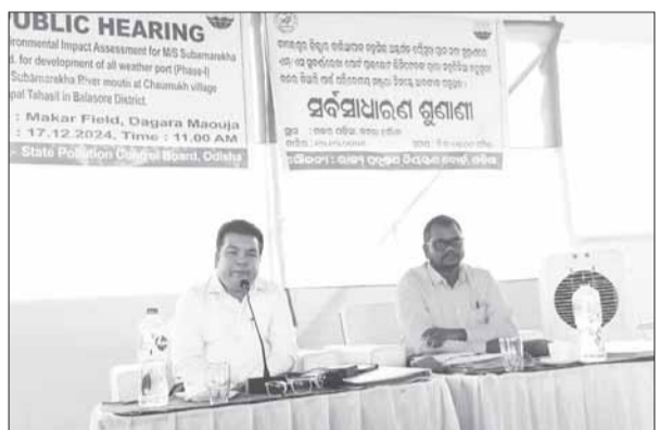
present and voiced their concerns. It was by and large peaceful with no reported untoward incident although members of Bhitamati Surakhya Committee opposed the port alleging that they would lose fertile land which is significant for paddy, betel vine, fish and cashew nut. "The port's development predominantly involves re-