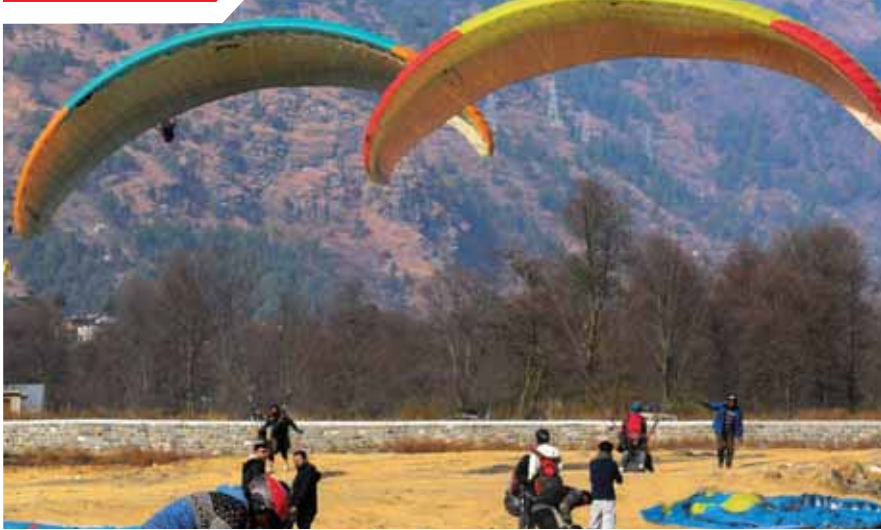
Tourists enjoy paragliding, in Manali