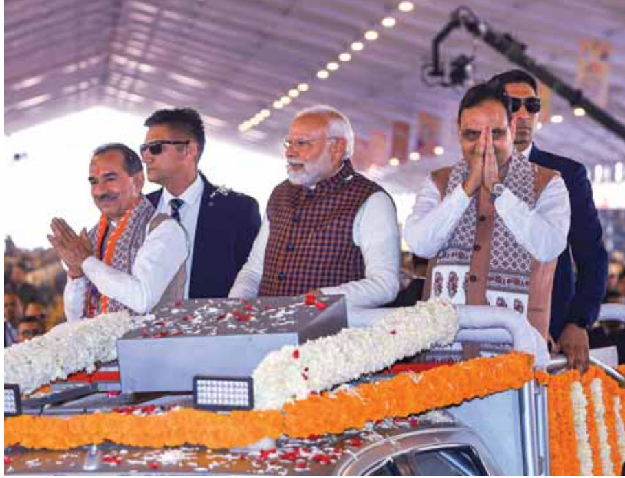
PM Narendra Modi with Rajasthan CM Bhajanlal Sharma during the 'Ek Varsh-Parinaam Utkarsh' event.

the development of Rajasthan. This first year has, in a way, laid a strong foundation for the many years to come," he said. Modi said people blessed the BJP with the responsibility to serve Rajasthan for multiple terms and party did its best. "Bhairon Singh Shekhawat laid a strong foundation of development in Rajasthan, Vasundhara Raje took the legacy forward and now Bhajanlal Sharma's government is engaged in further enriching good governance. Its impact can be seen in one year," he said. Modi said the Central government is constantly trying to improve the economic condition of villages and focusing on promoting every means of earning there. Rajasthan has ample potential for solar energy and it can become the leading state in the sector, he said. The PM said north India will