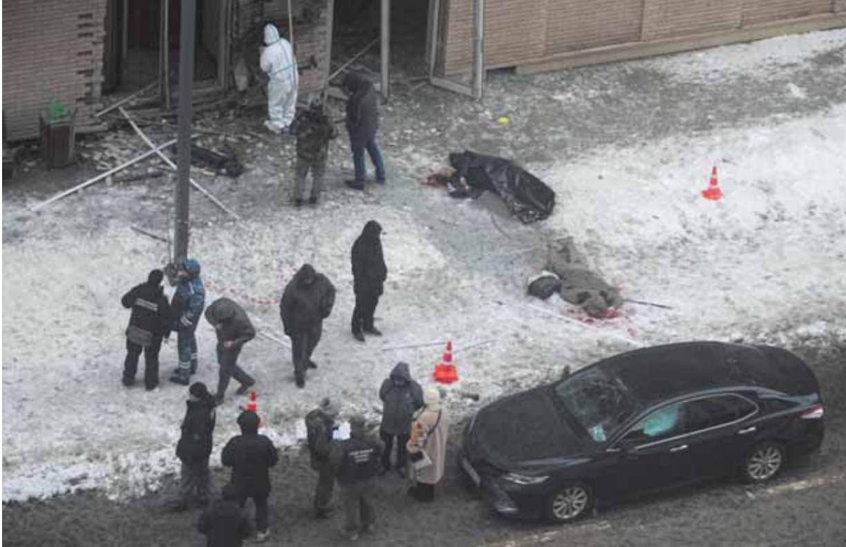
Investigators work at the place where Lt. General Igor Kirillov, the head of Russia's Nuclear, Biological, and Chemical Defence Forces and his assistant were killed by an explosive device planted close to a residential apartment's block in Moscow on Tuesday

Russia's top state investigative agency said it's investigating Kirillov's death as a case of terrorism, and officials in Moscow vowed to punish Ukraine. Dmitry Medvedev, deputy head of Russia's Security Council chaired by President Vladimir Putin, described the attack as an attempt by Kyiv to distract public attention away from its military failures and vowed that its "senior military-political leadership will face inevitable retribution." Over the past year, Russia has been on the front foot in the war in Ukraine, grinding deeper into the eastern region of Donetsk region despite heavy losses. Ukraine tried to change the dynamic with an incursion into Russia's Kursk region, but it has continued to slowly lose ground on its own territory. Since Russia invaded, several prominent figures have been killed in targeted attacks believed to have been carried out by Ukraine. Darya Dugina, a commentator on Russian TV channels and the daughter of Kremlin-linked nationalist ideologue Alexander Dugin, died in a