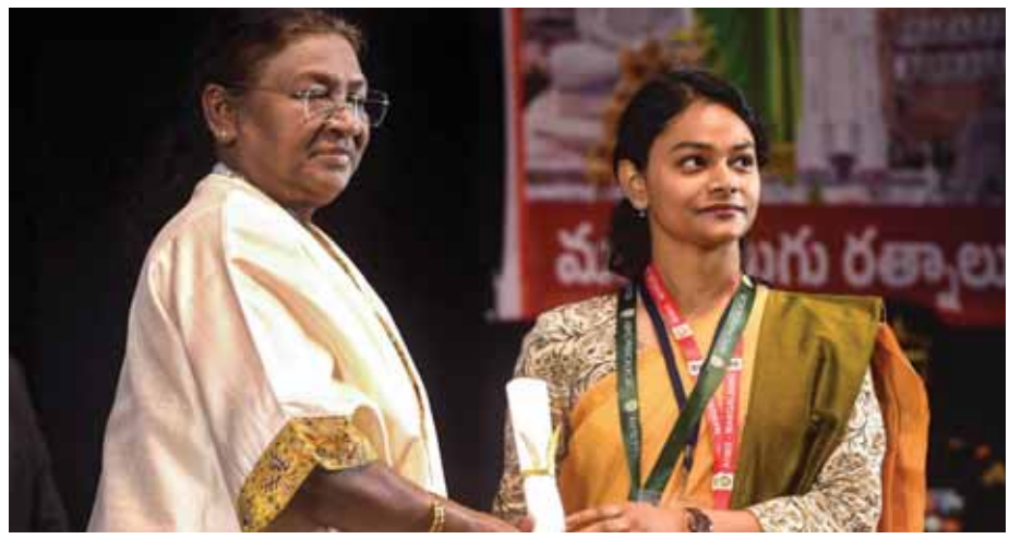
President Droupadi Murmu with a recipient during the first convocation of AIIMS Mangalagiri.