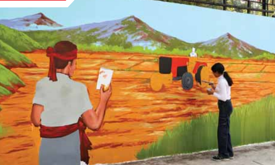
An artist paints a wall at Lodhi Road area, in New Delhi