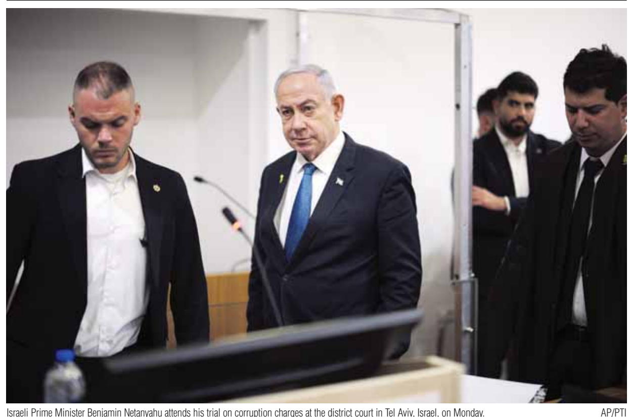
Israeli Prime Minister Benjamin Netanyahu attends his trial on corruption charges at the district court in Tel Aviv, Israel, on Monday.

face, dozens more people came forward with claims of suspected losses that the bank is working to verify, it said. The MUFG case is the second recent one involving criminal activity at a major Japanese financial institution. In November, Nomura Holdings acknowledged that a former employee had been arrested on suspicion of robbery, attempted murder and arson targeting a client in Hiroshima. Asked about the MUFG thefts, the chief government spokesman said Monday that banking operations require high levels of trust and a sense of public service. The case was "extremely regrettable," said Chief Cabinet Secretary Yoshimasa Hayashi.