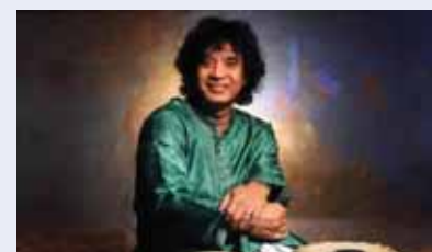
Tabla maestro Zakir Hussain passes away

The four-time Grammy Award winner, Indian tabla maestro and an innovative music fusion creator, Zakir Hussain is no more with us. The silence on his tabla is a huge loss for Hindustani classical music and jazz fusion. Zakir was truly an indelible gem in the world of music. The list of his national and international accolades is really long, as he had always made India proud with his tireless contribution in