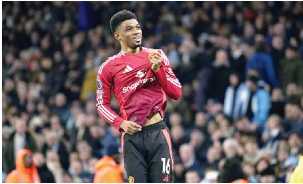
United is 13th and five points behind fifth-place City, which has seen its title defense unravel during its losing run.