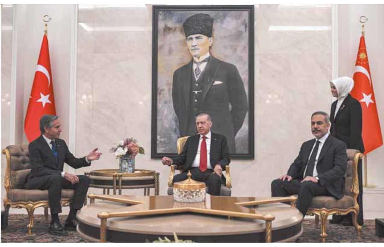
US Secretary of State Antony Blinken, left, meets with Turkey's President Recep Tayyip Erdogan, middle, and Foreign Minister Hakan Fidan, at Ankara Esenboga Airport.

rear its head again," Blinken said. The Turkish foreign minister said the two discussed ways of establishing prosperity in Syria and ending terrorism in the country. "Our priority is establishing stability in Syria as soon as possible, preventing terrorism from gaining ground, and ensuring that IS and the PKK aren't dominant," Fidan said, in a reference to the banned Kurdistan Workers Party. Blinken said: "We're very focused on Syria, very focused on the opportunity that now is before us and before the Syrian people to move from out from under the shackles of Bashar al-Assad to a different and better future for the Syrian people, one that the Syrian people decide for themselves." Blinken and Fidan said they had also discussed a ceasefire for Gaza. "We've seen in the last couple of weeks more encouraging signs that (a ceasefire) is possible," Blinken said.