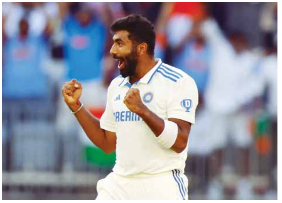
against the best batsmen of his era. "His ability to make it hard for batsmen to score runs with his probing line and length, allied to his guile and determination, made him the champion that he was. Bumrah, though less overtly

surgery already, it is not certain he will have a long career, but if he does, his name will be mentioned in the same breath as the champions above," Chappell wrote in the 'Sydney Morning Herald'. An all-format bowler, Bumrah has reinforced his status as the best bowler in the world several times including when he led India to a 295-run win in the Perth Test recently. "While the legends of yesteryear established the foundations, Bumrah is carving his own legacy - one that promises to inspire future generations of pacemen." The former Australia captain said Bumrah's lethal yorkers and unsettling bounce evoked memories of Lillee's raw aggression on the field. "Lillee was a warrior, combining raw aggression with psychological prowess. I opposed him many times in domestic cricket and watched him from close quarters