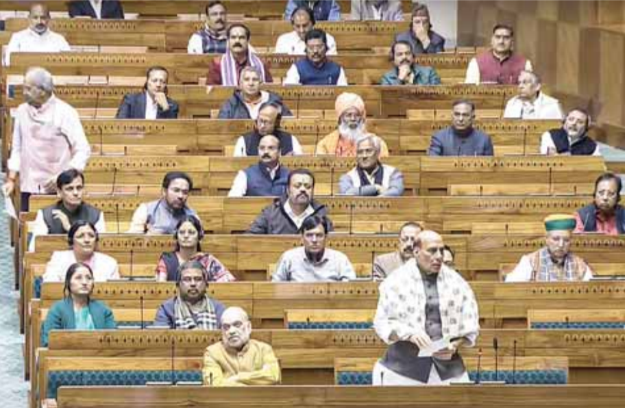
Defence Minister Rajnath Singh speaks during a discussion on the 75th anniversary of the adoption of the Constitution of India in the Lok Sabha during the Winter Session of Parliament