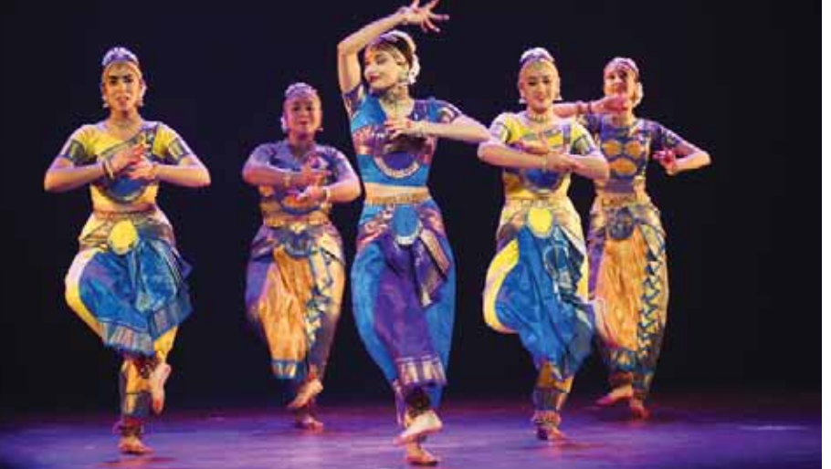
"Art reflects a culture's spirit, capturing its traditions, dreams and enduring beauty"

The Parampara Series 2024 at New Delhi's Kamani Auditorium brought together three evenings of exceptional artistry, celebrating India's classical dance and music heritage. Each performance honoured the depth and diversity of the country's cultural traditions, showcasing the seamless blend of history and creativity that continues to inspire across generations. The series opened with a riveting Kuchipudi presentation by the renowned Raja Radha Reddy Repertory. Their storytelling and precision enthralled the audience, setting an inspiring tone for the evenings to come. This was followed by the soulful Hindustani vocals of Mahesh Kale, whose emotive artistry left a lasting impression. The second evening shone a spotlight on the SRJAN Ensemble, who brought the intricate elegance of Odissi to life through their refined movements and expressions. Accompanying this visual splendour was the Hindustani flute recital by maestro Rakesh Chaurasia, whose