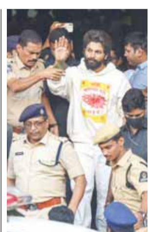
Telugu actor Allu Arjun leaves from Gandhi Hospital after a medical check-up following his arrest, in Hyderabad