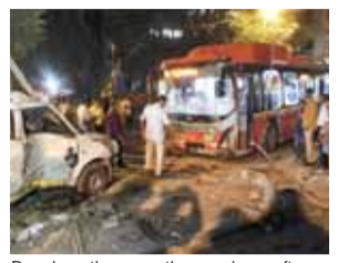
People gather near the wreckage after a BEST undertaking's bus rammed into pedestrians as well as vehicles on a road at Kurla, in Mumbai.

march at Chanakyapuri against alleged atrocities and human rights violations against Hindus and other minorities in Bangladesh. Police had put barricades on the Teen Murti Marg on both the carriageway outside the Chanakyapuri police station where hundreds of people from various organisations gathered. Traffic was regulated in the area with vehicles redirected to alternative routes. There have been allegations of over 200 attacks on Hindus in various districts of Bangladesh since the fall of the Sheikh Hasina-led Awami League government on August 5.