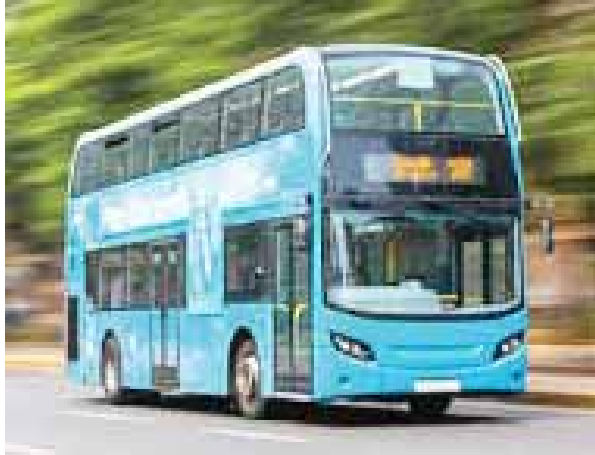
A 10-year contract would be signed with a private organisation for the supply, operation, maintenance of the

The State Government would soon introduce double-decker electric buses in select cities. The Capital Region Urban Transport (CRUT) has already invited tender from private parties for the purpose. As per sources, the CRUT would introduce as many as five double-decker electric buses for Khordha, Puri and Cuttack districts in the first phase.