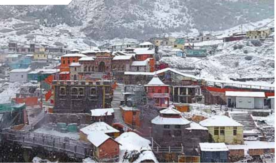
Badrinath Dham receives the first snowfall of the season, in Chamoli