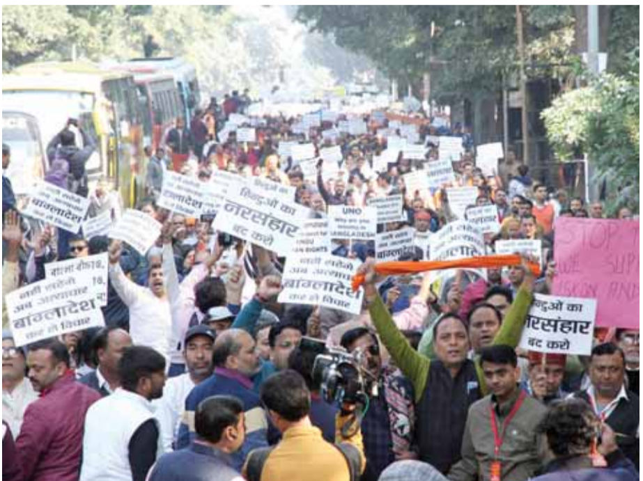
Social Organisations of Delhi organised a protest march on Bangladesh Embassy against the attacks on Hindus and human rights violations in Bangladesh at Teen Murti Chowk, in New Delhi on Tuesday.