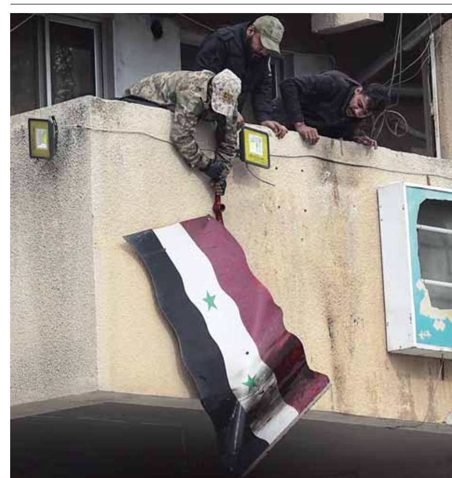
Syrian opposition fighters remove a government Syrian flag from an official building in Salamiyah, east of Hama, Syria

advanced towards Damascus, China voiced deep concern over the situation in Syria and said it would support the country in its efforts to safeguard national security and stability. State-run Xinhua reported from Damascus on Sunday that opposition forces in Syria seized control of the capital "in a stunning turn of events following a rapid offensive that saw major Syrian cities 'falling like dominos within days'." After taking over, opposition fighters appeared on state television channels to announce what they described as the fall of Damascus and the end of President Assad's rule, the report said.