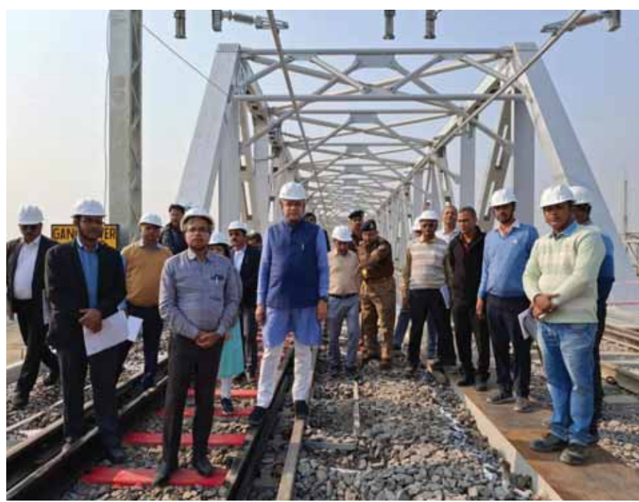
Railway and Information Broadcasting Minister Ashwini Vaishnaw on Sunday inspected the to be commissioned 2.2 kilometres double line New Railway Bridge over Ganga in Prayagraj where the Mahakumbh is scheduled early next year. The Old bridge was single line and of more than 100 years which will be decommissioned shortly. The work for the New Ganga Bridge started in October 2020 and will be commissioned soon by Prime Minister Narendra Modi. Railways also announced that it will run 13000 trains for the Mahakumbh between early January 2025 till February 2025.

minister said. In a grand consistory held in the Vatican on Saturday, 51-year-old Koovakad was elevated to the rank of cardinal by Pope Francis. The ceremony, held at the famous St Peter's Basilica and attended by clergy and dignitaries from around the world, witnessed the induction of 21 new cardinals from various countries. The ceremony began at 8.30 pm (IST) marking a procession with 21 cardinal-designated to the altar of St Peter's Basilica. Later, the Pope addressed the gathering and handed over the ceremonious cap and ring to the cardinal-designate, followed by a certificate accompanied by prayers. Koovakad's appointment brings the total number of Indian cardinals to six, further strengthening the country's representation at the Vatican.