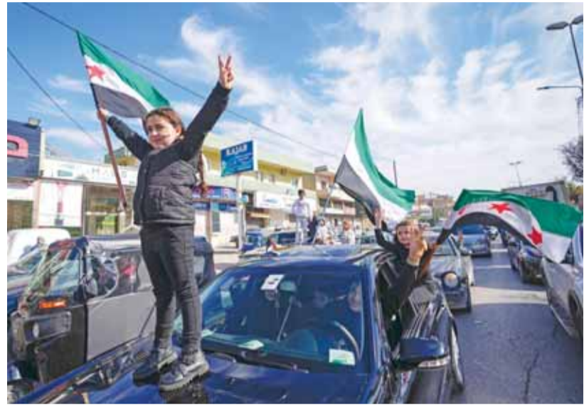
Syrians celebrate the fall of Bashar Assad's government in the town of Bar Elias, Lebanon, near the border with Syria

AP ■ DAMASCUS Syrians poured into streets echoing with celebratory gunfire on Sunday after a stunning rebel advance reached the capital, putting an end to the Assad family's 50 years of iron rule but raising questions about the future of the country and the wider region. Joyful crowds gathered in central squares in Damascus, waving the Syrian revolutionary flag in scenes that recalled the early days of the Arab Spring uprising, before a brutal crackdown and the rise of an insurgency plunged the country into a nearly 14-year civil war. Others gleefully ransacked the presidential palace and the Assad family residence after President Bashar Assad and other top officials vanished, their whereabouts unknown. Russia, a close ally, said