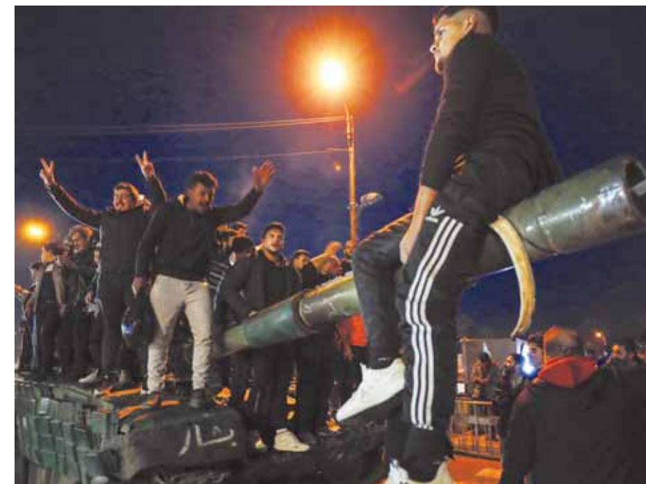
Syrians celebrate the arrival of opposition fighters in Damascus on Sunday.

the institutions of "the free Syrian state." The statement emerged hours after the head of a Syrian opposition war monitor said Assad had left the country for an undisclosed location, fleeing ahead of insurgents who said they had entered Damascus following a remarkably swift