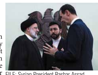
FILE: Syrian President Bashar Assad (right) speaks with Iranian President Ebrahim Raisi (left).

Moscow: Russia's Foreign Ministry claimed Sunday that Bashar Assad had left Syria after negotiations with rebel groups, and gave "instructions" to "transfer power peacefully." In a post on the Telegram messaging app on Sunday, the ministry said Moscow had not directly participated in these talks. It also said it has been following the "dramatic events" in Syria "with extreme concern." It also said Russian troops stationed in Syria have been put on high alert and that as of early after-