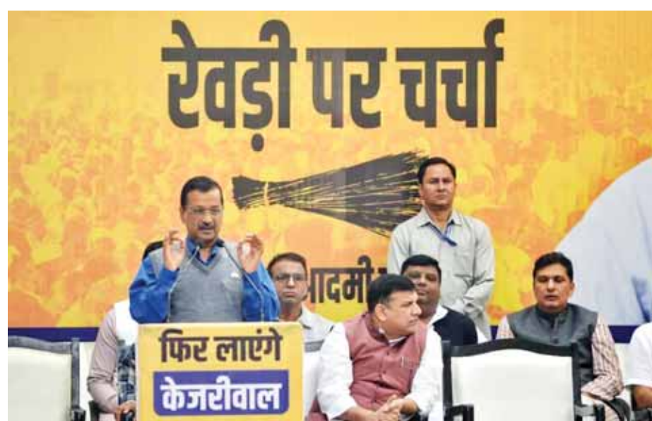
isfaction with the AAP's welfare programmes, including free electricity, water, education, healthcare, bus travel for women, and pilgrimage trips

Ahead of the Delhi assembly elections, the AAP on Sunday claimed that 99 per cent of Delhi residents support its welfare schemes like free electricity, water subsidies, and complimentary bus rides for women among others. The ruling party has intensified its 'Revdi Par Charcha' campaign to mobilise grassroots volunteers ahead of the Delhi Assembly elections scheduled to be held in February next year. The AAP is eyeing a third consecutive term in Delhi. "The programme involves hosting 2,000 public meetings daily across the capital to gather feedback on the party's welfare schemes and ensure greater public engagement," the party said in a statement. During these discussions, the party claimed, Delhiites have expressed overwhelming sat-