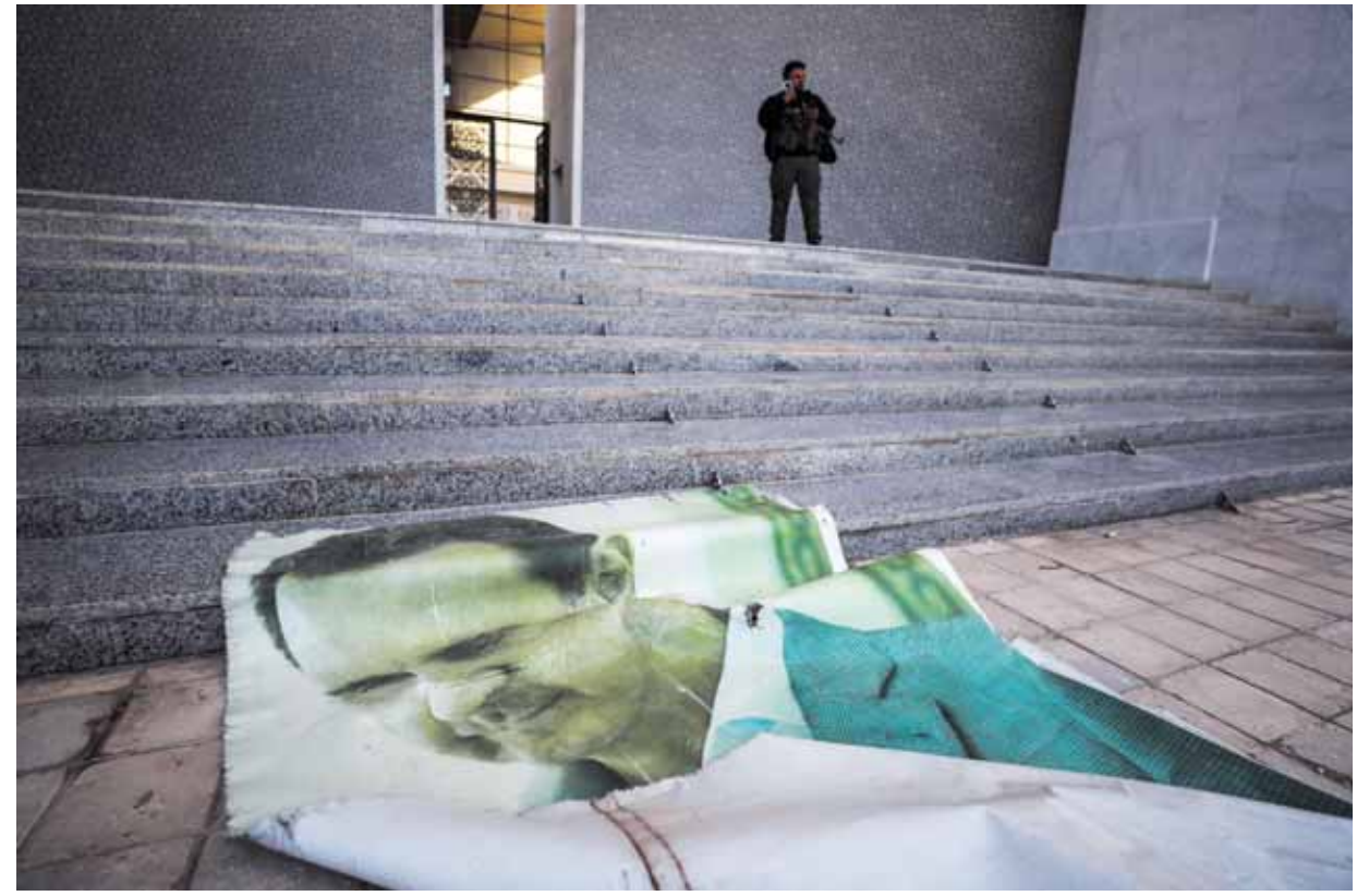
A giant picture of Syrian President Bashar Assad lies on the ground as a Syrian opposition fighter stands nearby, inside the Presidential Palace in Damascus, Syria on Sunday.

Assad has been accused of war crimes and crimes against humanity during the war, including a 2013 chemical weapons attack on the outskirts of the capital. There was no immediate comment from Iran, which had been Assad's staunchest supporter. The Iranian Embassy in Damascus was ransacked after apparently having been abandoned.