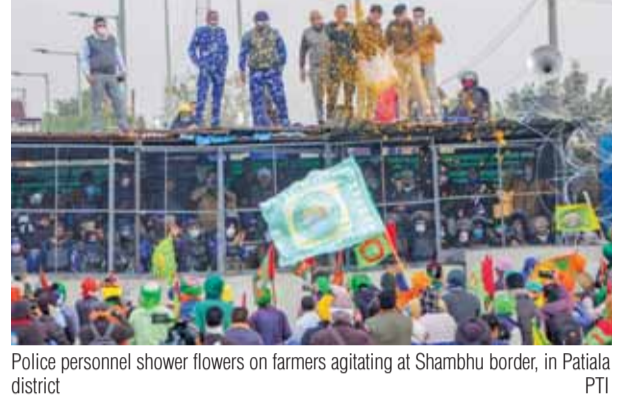
Police personnel shower flowers on farmers agitating at Shambhu border, in Patiala district

PIONEER NEWS SERVICE ■ NEW DELHI/CHANDIGARH Agitating farmers on Sunday afternoon suspended their "Dilli Chalo" foot march for the day after some of them suffered injuries in tear gas shelling by Haryana police, the protesting farmers will decide on the next course of action on Monday. After the farmers started the foot march on Sunday, they were halted by the multilayered barricading erected by the Haryana Police at the entry point to Haryana from Punjab. A heated argument took place between protesting farmer 'jatha' and security personnel. Haryana Police asked the farmers to show