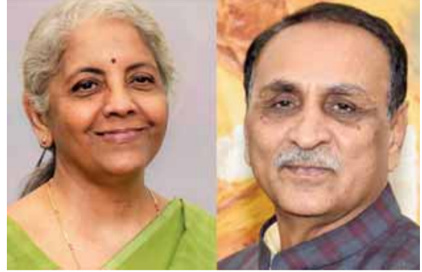
The BJP's Parliamentary Board is sending former Gujarat CM Vijay Rupani and Finance and Corporate Affairs Minister Nirmala Sitharaman as central observers

After days of uncertainty, in the wake of it leading the MahaYuti to a spectacular victory in the Maharashtra Assembly polls, the ruling Bharatiya Janata Party (BJP) finally began to get its act together on Monday as it called its legislature party meeting on December 4 to elect its leader - ahead of the swearing-in ceremony scheduled to be held on the following day. Though the BJP has not yet formally announced its Chief Ministerial choice, party sources said that the party's central leadership has put a stamp of approval on the name of its senior leader and former CM Devendra Fadnavis for the top post in the state. At a meeting to be held at 10 am on December 4 in the Central Hall of the Maharashtra Vidhan Bhavan, Fadnavis will in all likelihood be elected as the BJP's Legislature Party (BJPLP) leader, paving the way for his being sworn in as the next CM of Maharashtra on December 5. The BJP's Parliamentary Board is sending former Gujarat CM and the party's in-charge for Punjab Vijay Rupani and Finance and Corporate Affairs Minister Nirmala Sitharaman as the central observers for the BJPLP meeting. After the BJPLP meeting, the leaders of the ruling MahaYuti, comprising the BJP, Shiv Sena (Eknath Shinde) and NCP (Ajit Pawar), will call Maharashtra Governor CP Radhakrishnan, and formally stake claim to form a new government in the state. While confirming that the