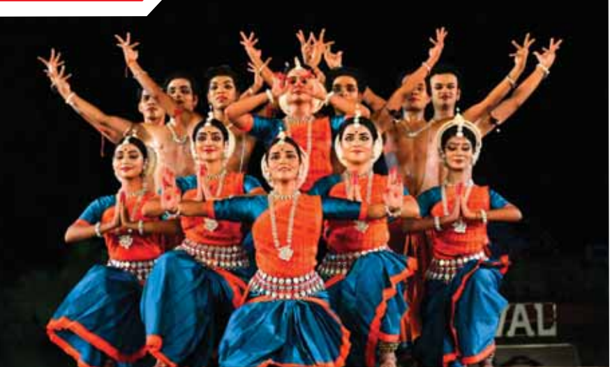
Artists perform during the 35th Konark Dance Festival 2024, in Puri