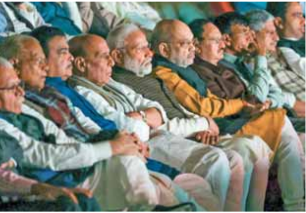
Prime Minister Narendra Modi with Union Ministers Rajnath Singh, Amit Shah, Nitin Gadkari, JP Nadda, and others during the screening of the film 'The Sabarmati Report', at the Parliament in New Delhi