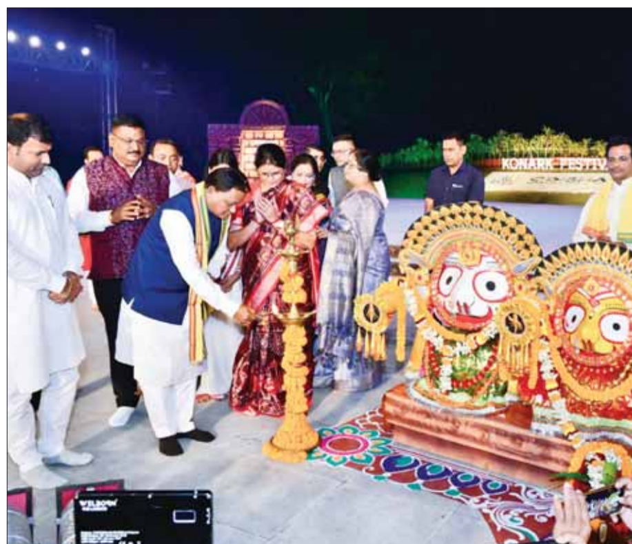
Chief Minister Mohan Charan Majhi inaugurates the 35th Konark Festival at Konark on Sunday. The annual event will continue for five days.

Commissionerate Police, Odisha's Intelligence Wing, the Special Protection Group and other security agencies acted swiftly to ensure safety. Twin City Police Commissioner Suresh Devadatta Singh stated, "Amid potential threats, a foolproof security blanket was ensured during the event. All concerns were thoroughly investigated." The resolutions and strategies developed during the conference are expected to play a pivotal role in addressing India's evolving security needs.