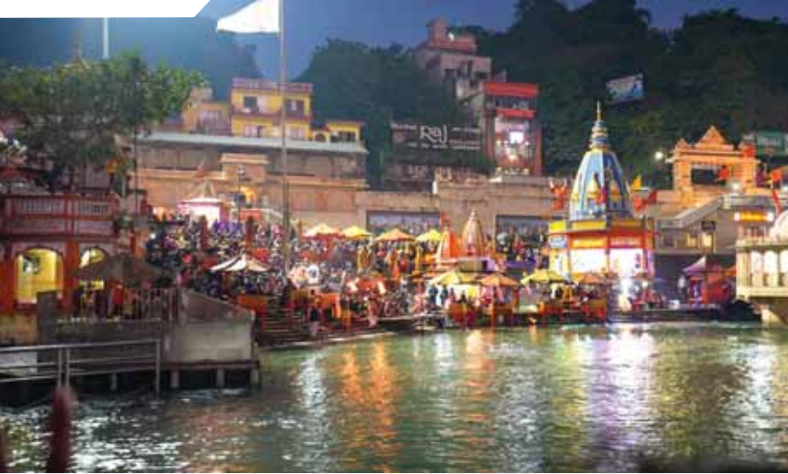
Devotees attend 'Ganga Aarti' at Har Ki Pauri, in Haridwar