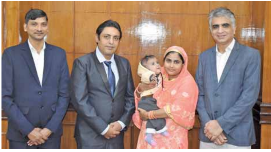
Sarvodaya Hospital, Faridabad achieved medical breakthrough by treating a 5-month-old baby for congenital hearing impairment making him the youngest in India to undergo a cochlear implant surgery.

The 17th edition of CPHI & PMEC India, organised by Informa Markets in India took place at the India Expo Centre, Greater Noida, Delhi-NCR. Over 50,000 global industry professionals, including key decision-makers, gathered to explore new partnerships and growth opportunities. The expo featured forward-thinking discussions on sustainability, digital transformation, and the future of pharma, with a special focus on empowering women in the industry.