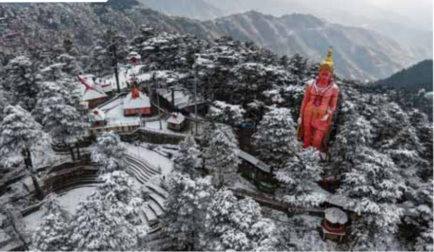
The Jakhu Temple and its premises covered with snow after fresh snowfall, in Shimla