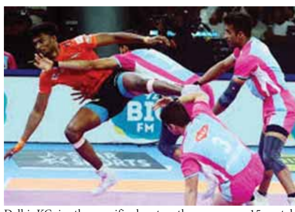
Delhi KC in the semifinals scheduled for Friday. Table toppers Haryana Steelers, who are through to the semi-finals, are gunning for their first PKL title while Dabang Delhi KC have been one of the best teams this season and have stitched

PTI ■ PUNE UP Yoddhas will play Jaipur Pink Panthers, while Patna Pirates will be up against U Mumbai in the eliminators of the Pro Kabaddi League here on Thursday. In the fray for the top prize are Haryana Steelers and UP Yoddhas, both of whom have never won the title, and along with them are three-time champions Patna Pirates, season 8 winners Dabang Delhi KC, season 1 and 9 title holders Jaipur Pink Panthers, and season 2 champions U Mumba, who sealed qualification for the playoffs with the last game of the league stage. The winners of the eliminators will take on Haryana Steelers and Dabang