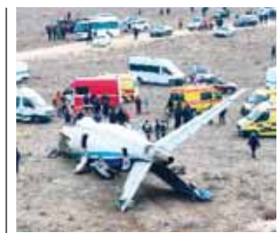
The wreckage of Azerbaijan Airlines Embraer 190 on the ground near the airport of Aktau, Kazakhstan.

Atal Gram Sewa Sadans costing Rs 437 crore at the Khajuraho program. Under the Ken Betwa project, a 77-metre high and 2.13 kilometres long Daudhan dam and two tunnels (upper level 1.9 km and lower level 1.1 km) will be constructed on the Ken river in the Panna Tiger Reserve. The dam will store 2,853 million cubic metres of water, the chief minister said. The surplus Ken water will be transferred to the Betwa river through the 221-km-long link canal from Daudhan dam, providing irrigation and drinking water facilities in both the states, he said.