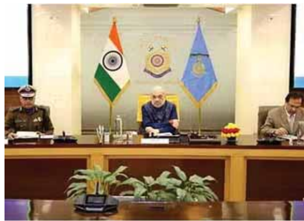
home minister about the various welfare schemes being implemented for the families of martyred jawans of the force, including compassionate appointments in the CRPF. Shah emphasised the importance of promoting Hindi in the daily functioning of the force to strengthen linguistic unity. Along with emphasising the use of more and more 'Shri Ann' (Millets) for better health of the soldiers, the home minister also called upon the soldiers to extract the benefits of Ayurveda and