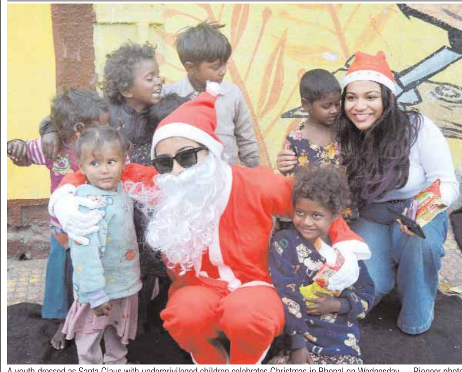
A youth dressed as Santa Claus with underprivileged children celebrates Christmas in Bhopal on Wednesday.

Reserve. In the order issued, it has been said that as part of the in principle process of giving tigers, the process of translocating the tiger and tigress should be conducted under the supervision of an authorized veterinarian. Care should be taken that there is no danger to the life of the tigers. The entire expenditure of translocation will be borne by the concerned state. Due permission for transfer should be obtained from the Government of India.