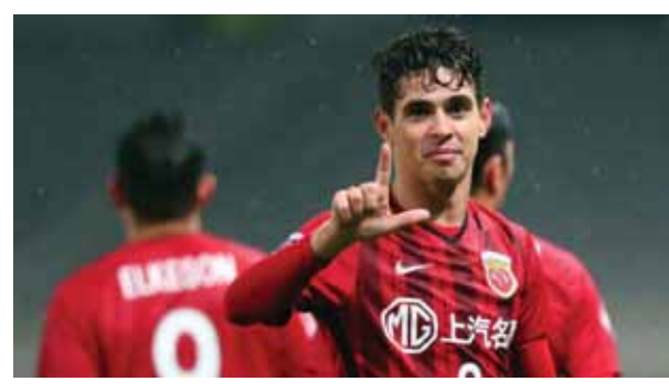
together." Oscar joined Sao Paulo on a free transfer. Neither the Brazilian club nor the player disclosed the duration of their deal, but local media reports said he signed a three-year contract. Oscar is returning to a club he sued to leave for another Brazilian team, Internacional, in 2010.