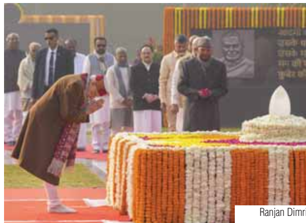
He said "This day, observed in honour of the birth anniversary of former PM and Bharat Ratna Atal Bihari Vajpayee Ji, reminds us of the importance of transparent, accountable, and people-centric governance. Let us reaffirm our dedication to building a state where governance empowers every citizen and paves the way for a brighter future." Odisha Chief Minister Mohan Charan Majhi and his predecessor and BJD leader Naveen Patnaik on Wednesday paid tributes to former prime minister Atal Bihari Vajpayee. The Odisha government's Information and Public Relations (I&PR) Department, in a message, termed Vajpayee as 'Vikas Purush' and said the state

will continue to guide the countrymen on the path of national service till eternity like the Pole Star," Shah said. In his tributes, Manipur Chief Minister N Biren Singh said the former Prime Minister's principles and teachings have inspired the building of a robust economy for this nation. Singh said in a social media post "Shri Atal Bihari Vajpayee ji has been a pivotal figure in shaping India's diplomacy and national security, while continuing to serve as a source of guidance and wisdom to all of us.. "His principles and teachings have inspired the building of a robust economy for this nation, serving as an enduring source of motivation for the generations to come" Singh added.. Singh in another post also extended his greetings on the occasion of Good Governance Day.