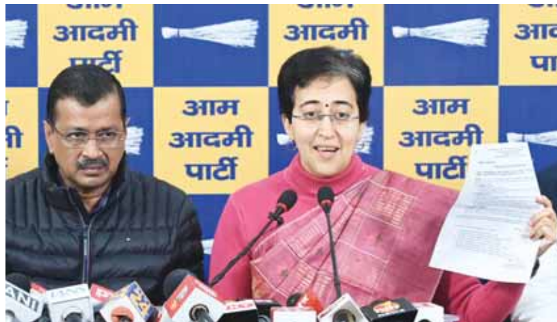
Delhi Chief Minister Atishi and AAP National Convener Arvind Kejriwal during a press conference.

Atishi, addressing a press conference at the AAP headquarters, strongly condemned the notices, claiming that the officers were under pressure from the Bharatiya Janata Party (BJP). She insisted that the public notices were false and part of a larger conspiracy by the BJP to undermine the AAP's initiatives, which had gained significant public support. She added that the party would take legal action, including a Delhi Police inquiry, against the officers for issuing misleading statements. During the press conference, Atishi also shared an official notification from the Cabinet that approved the Rs 1,000 allowance for women under the Mahila Samman