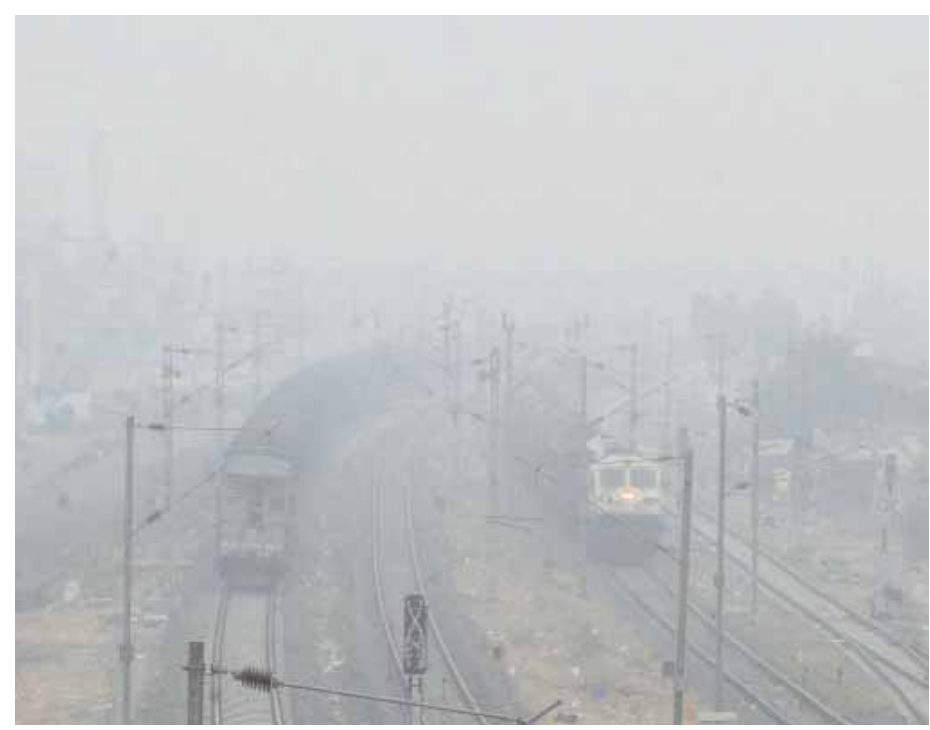
A view of a dense fog on a winter morning in Bhopal on Wednesday.

spread rain in various districts on Monday and Tuesday. Typically, severe cold sets in during the second half of December. However, this year, cold weather was observed earlier, in the first half of the month. After the current spell of rain, a return to severe cold is expected in January. On Tuesday night, temperatures dropped by 5 degrees in many areas. Mandla recorded the lowest temperature at 9.3°C. Other cities, including Khajuraho, Narsinghpur, Raisen, Umaria, Damoh, Pachmarhi, Betul, and Rajgarh, recorded temperatures below 14°C. In major cities like Bhopal, Indore, Gwalior, Ujjain, and Jabalpur, temperatures remained slightly higher, above 13°C.