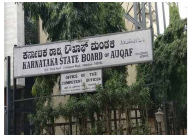
the Waqf board. Pal had visited Karnataka and interacted with the farmers who had received notices from the state government regarding encroachment over properties belonging to the Waqf Board. The committee had also written to state governments seeking details of Waqf properties occupied by them in an unauthorised manner as per the Sachar panel report. The UPA government constituted the Sachar Committee in 2005 to study the social, economic and educational

Amid a row over Waqf land in Karnataka, officials from the state government are scheduled to appear before the parliamentary panel examining the Waqf Amendment Bill on Thursday. The Joint Committee on the Waqf Amendment Bill, chaired by BJP member Jagadambika Pal, is scheduled to hear views from representatives of the governments of Karnataka, Madhya Pradesh, Rajasthan, Uttar Pradesh, Odisha and Delhi in sittings spread over two days beginning Thursday. Delhi's Food and Supply Minister Imran Hussain is also scheduled to address the committee on Friday, followed by the recording of evidence by the representatives of the Delhi government. The deposition of officials from the Congress-led Karnataka government comes in the wake of a row over claims by BJP leaders that over 1,500 acres of land belonging to farmers in the state were being taken over by