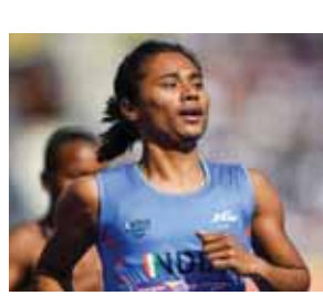
whereabouts. Known as the 'Dhing Express', she was handed the suspension under a case resolution agreement as per the NADA website. She is currently training in Thiruvananthapuram. The timeline around her suspension has created confusion as the athlete has been competing since April this year, including

PTI ■ NEW DELHI Asian Games gold medallist sprinter Hima Das, who was exonerated for a 'whereabouts' failure by the National Anti-Doping Agency (NADA), was handed a retrospective suspension by the same body in an unusual turn of events. The 16-month suspension period ran from July 22, 2023 to November 21, 2024 and the athlete is now free to take part in tournaments but what has created a flutter is that she had been competing in events as recently as in June this year. NADA has recently announced that she was suspended by its anti-doping panels for failing to provide her