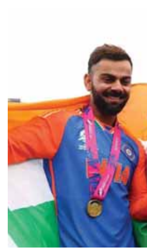
with the coveted trophy in their hands. It was also a fitting farewell for head coach Rahul Dravid, whose tenure drew to a close. Change of guard in coaching: Surya's unexpected elevation With Rohit calling it a day, it was expected that Hardik will lead the T20 side into the

fearless approach that demoralised opposition attacks. His approach was best summed up in the Super 8 game against Australia where he tore into the likes of Mitchell Starc and Pat Cummins to make all the difference in the game. His opening partner Kohli was not able to make the contributions that were expected out of him but the superstar came up with an innings of immense substance when it mattered the most -- his not-so-fluent 76 of 59 balls kept India in the final after a poor start. The contributions from all-rounder Hardik Pandya, future captain Suryakumar Yadav and Rishabh Pant, playing his first international event following his comeback from a life-threatening car accident, were also noteworthy. A better script could not have been written for the likes of Rohit and Kohli, who got to say goodbye to the T20 format