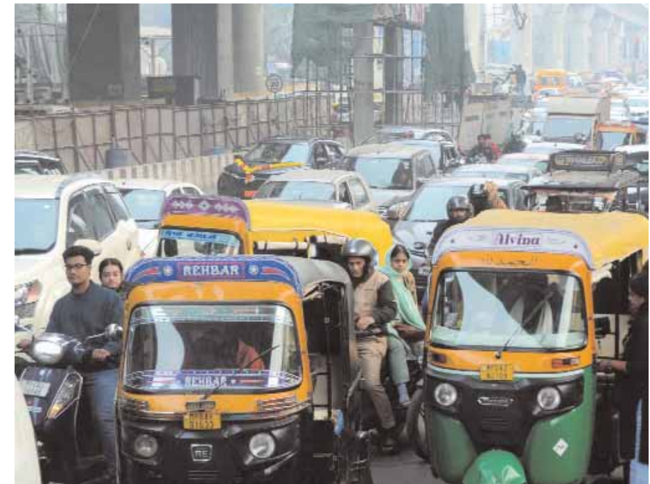
A view of a massive traffic jam from Rani Kamalapati Railway Station to DB Mall in MP Nagar locality in Bhopal on Wednesday.