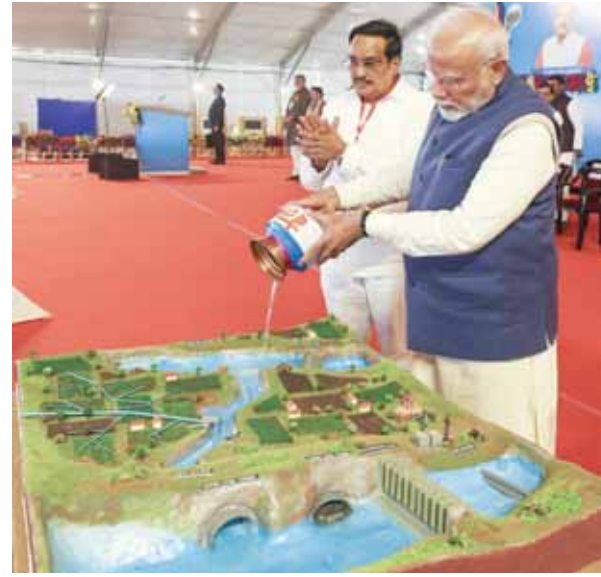
Prime Minister Narendra Modi with Union Minister CR Patil during the foundation stone laying ceremony of Ken-Betwa River Linking Project, in Khajuraho, Madhya Pradesh.

Union Water Resources Minister C R Patil and Madhya Pradesh Chief Minister Mohan Yadav handed over two kalash (urns) containing water from Betwa and Ken rivers, respectively, to Modi, who poured it over a model of the project to launch the river linking work. As per the initial estimation of the project, nearly 44 lakh people in 10 districts of Madhya Pradesh and 21 lakh in Uttar Pradesh will get drinking water under the project. Nearly 7.18 lakh agricultural families in 2,000 villages will benefit from the project, which will also generate 103 MW of