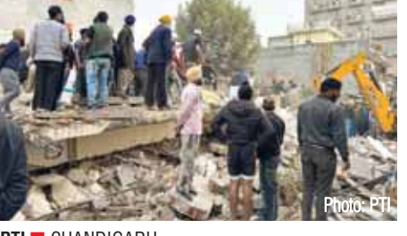
PTI ■ CHANDIGARH

Rescue operations were underway after a multistorey building collapsed in the Sohana village of Punjab's Mohali district on Saturday, officials said. Locals said some people were feared trapped under the debris. The district authorities launched a rescue operation. Two excavators were pressed into