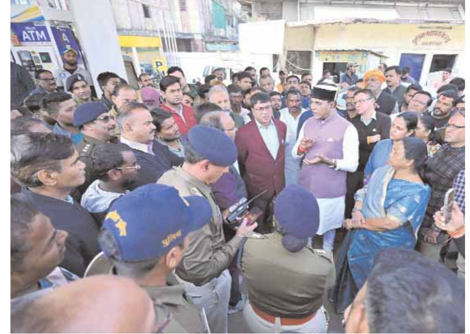
Minister for Sports and Youth Welfare Vishwas Kailash Sarang inspects under-construction road and drainage at Alpna trisection in Bhopal on Saturday.

Pradesh. Entrepreneurship is the foundation of economic development and nurturing young talent is essential to drive change and innovation.