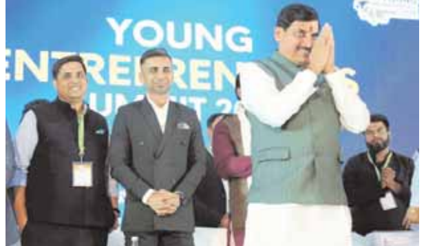
Chief Minister Mohan Yadav is addressing young entrepreneurs at the Young Entrepreneur Summit-2024 in Ujjain on Saturday.

Chief Minister Mohan Yadav has said that India is creating a distinct identity on the world stage due to the hard work of young entrepreneurs.