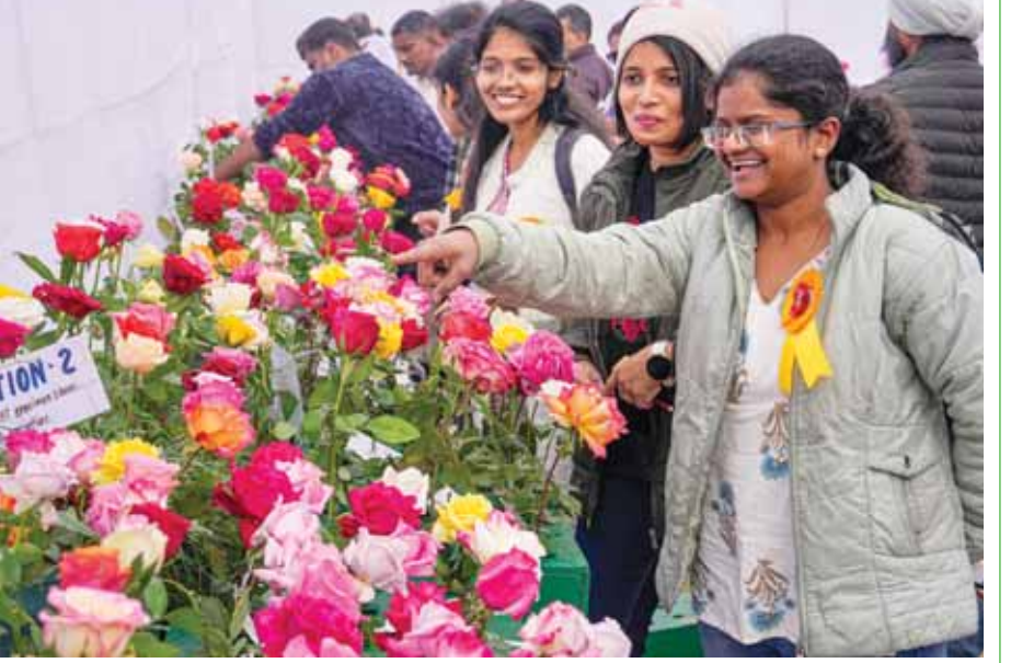
Visitors at the 'All India Winter Rose Show' organised by the New Delhi Municipal Council (NDMC) in association with The Rose Society of India, at India-Africa Friendship Rose Garden, Chanakyapuri