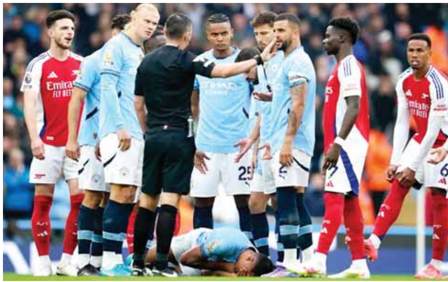
Manchester City players are seen on the field during a match, with one player lying on the ground, possibly injured.

get to play enough. If successful, the Club World Cup could rival the Premier League and Champions League as one of the most lucrative and watched tournaments in club soccer. It has been backed by clubs and next year's event is set to feature many of the biggest names in the sport, including Lionel Messi, Neymar, Kylian Mbappe and Vinicius Jr. Coming at the end of many leagues' regular season, FIFA