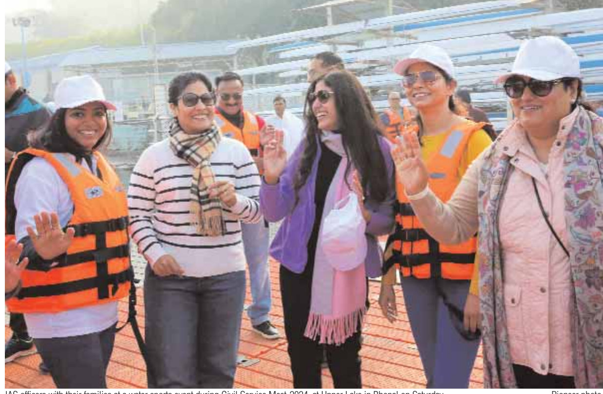
IAS officers with their families at a water sports event during Civil Service Meet-2024, at Upper Lake in Bhopal on Saturday.