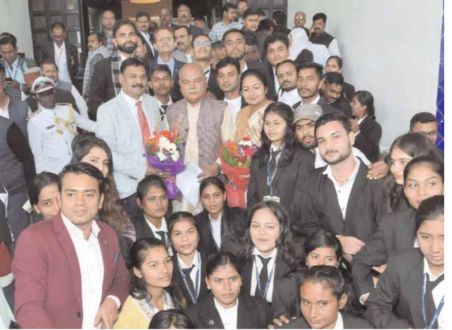
Speaker of the Madhya Pradesh State Assembly Narendra Singh Tomar meets students of Shri Ramakrishna College of Law, Satna during the ongoing winter session of the state assembly in Bhopal on Wednesday.

Chief Minister Yadav said that on December 25, 2024, Prime Minister Modi will gift the Ken-Betwa river linkgin the Ken-Betwa river link-ing project to Madhya Pradesh. Prime Minister Modi will lay the foundation of the first phase of the scheme in Khajuraho (Chhatarpur). With this, the people of the Bundelkhand region of Madhya Pradesh and Uttar Pradesh will get