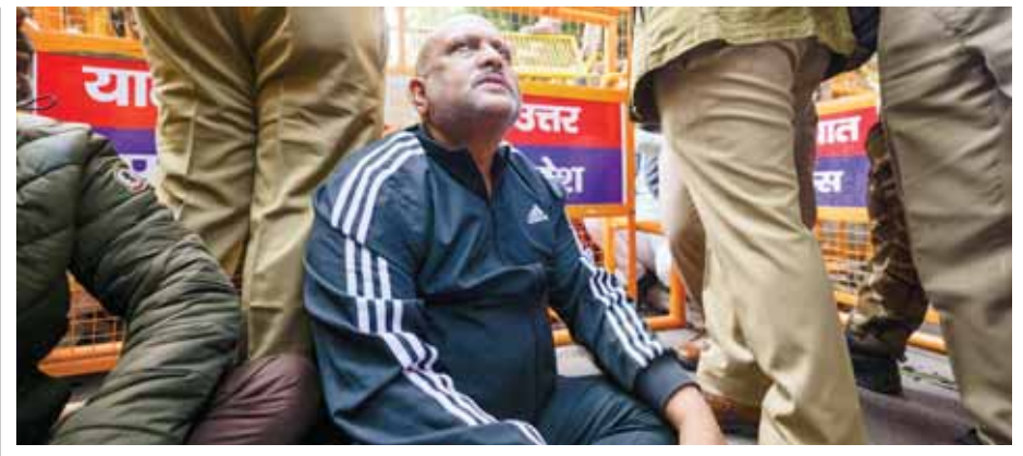
UP Congress chief Ajay Rai, as he tried to leave the party office for the planned siege of the state Assembly over as farmer distress, unemployment, inflation, privatisation, and law and order, in Lucknow, Wednesday, Dec. 18

the victims of the 2021 Lakhimpur Kheri violence. Reinstatement of the Land Acquisition Act, 2013, and