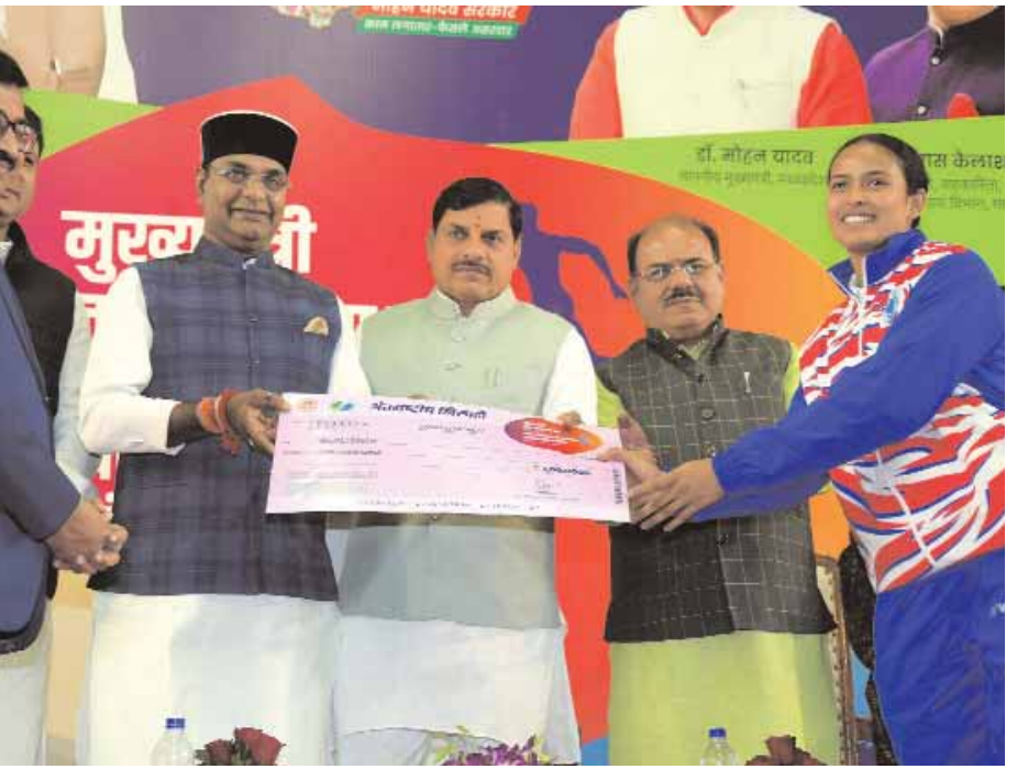
Madhya Pradesh Chief Minister Mohan Yadavdistributes cheques to the players during a felicitation ceremony for sportspersons under 'Jan Kalyan Parv' at TT Nagar Stadium in Bhopal on Wednesday.

Vishwas Kailash Sarang said that Chief Minister Yadav has been a player himself; hence he understands the needs of the players. Under his leadership, continuous efforts are being made to promote sports and players. Minister Sarang said that Chief Minister Yadav has given his consent to the proposal to establish a government sports complex in every assembly constituency. This plan will soon be given concrete shape.