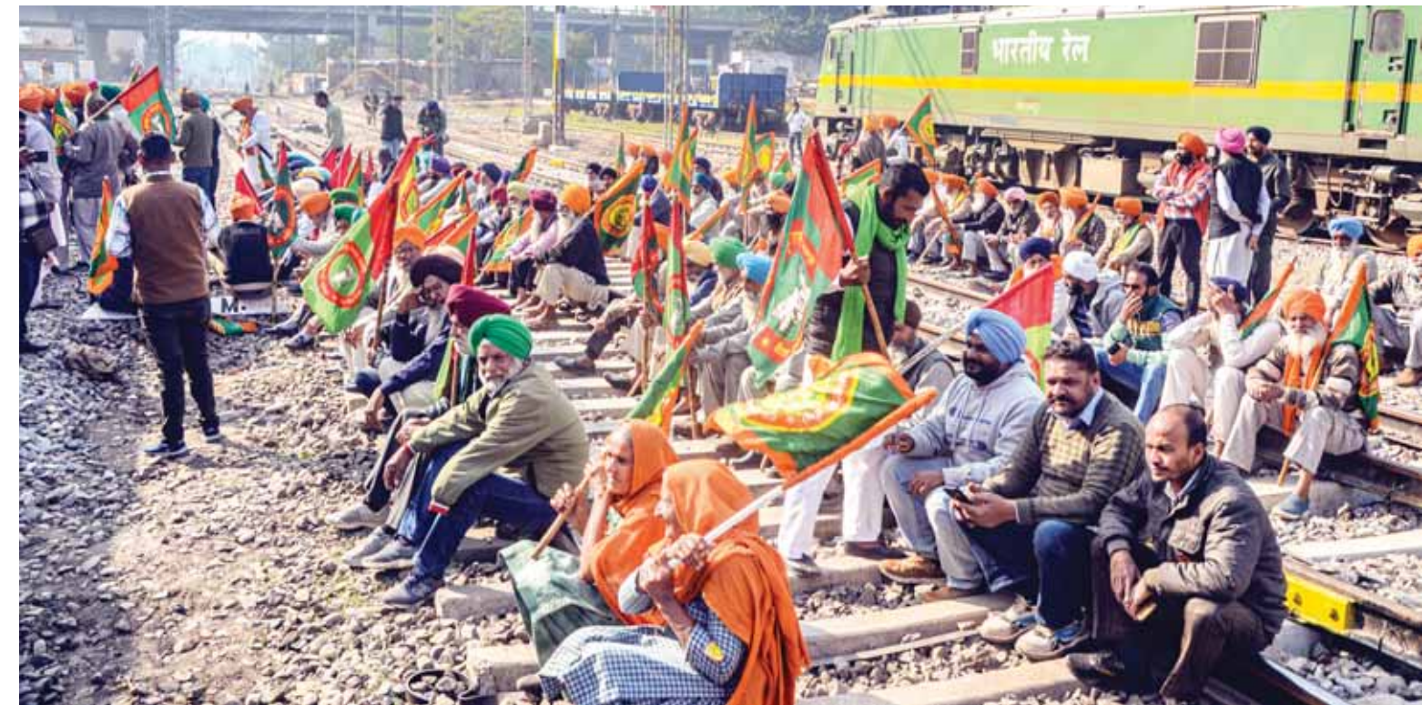
Farmers in Patiala block railway tracks on Wednesday as part of their state-wide 'Rail Roko' protest to press the Union government for various demands including a legal guarantee for MSP.