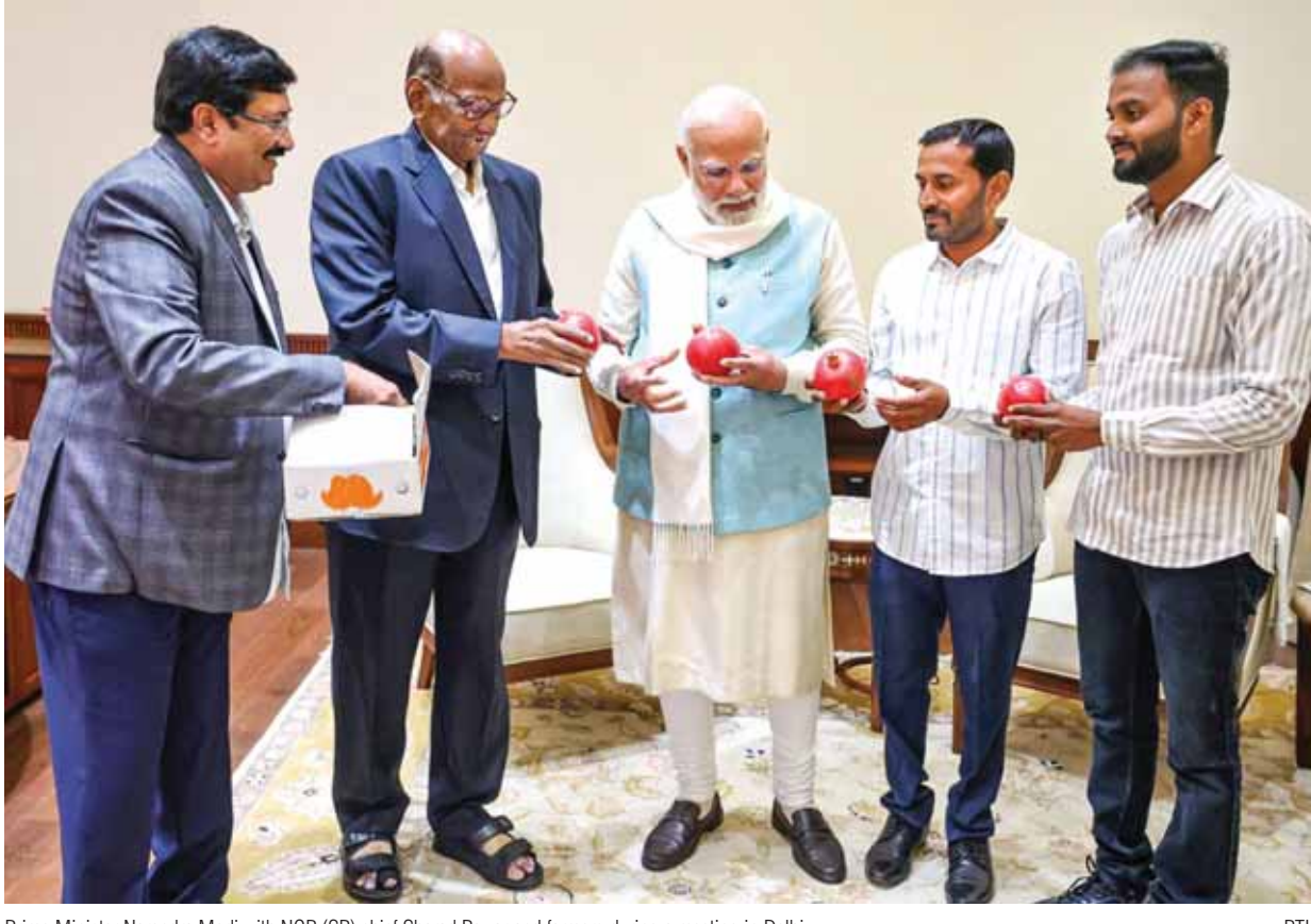
Prime Minister Narendra Modi with NCP (SP) chief Sharad Pawar and farmers during a meeting in Delhi

TDP, JD(U) and Shiv Sena have stoutly defended the bills, saying frequent elections are an obstruction to development programmes and simultaneous polls will boost them by cutting down on election expenditure.