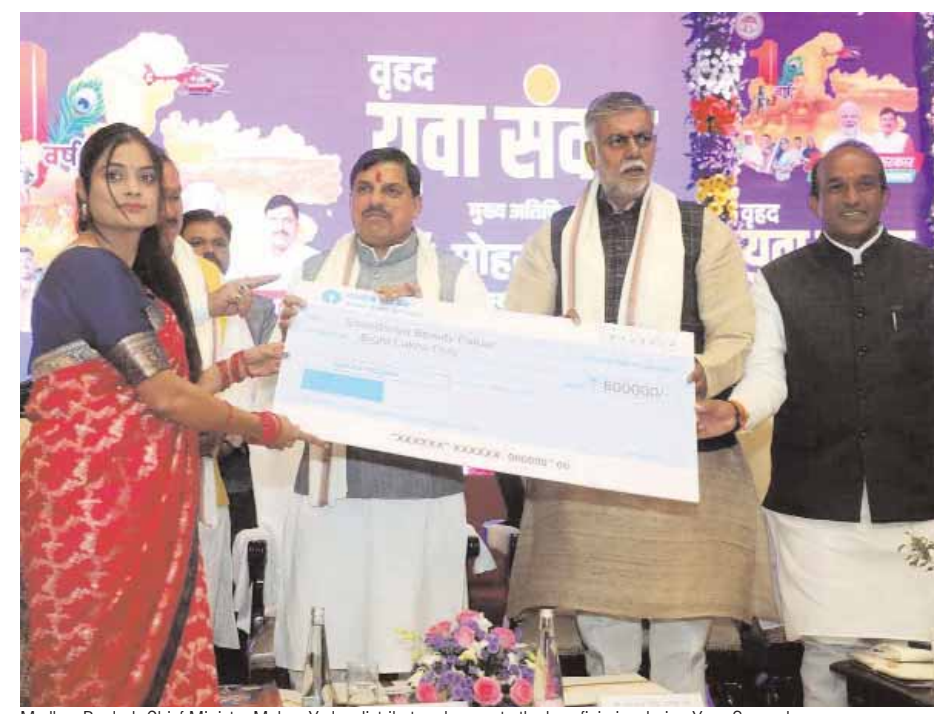
Madhya Pradesh Chief Minister Mohan Yadav distributes cheques to the beneficiaries during Yuva Samvad programme

Youth studying in the institutions of Bhopal participated in the mega Yuva Samvad organized under the Jankalyan Parv. During the event, 10 departments of the state government gave information about departmental schemes to the youth present through presentations.