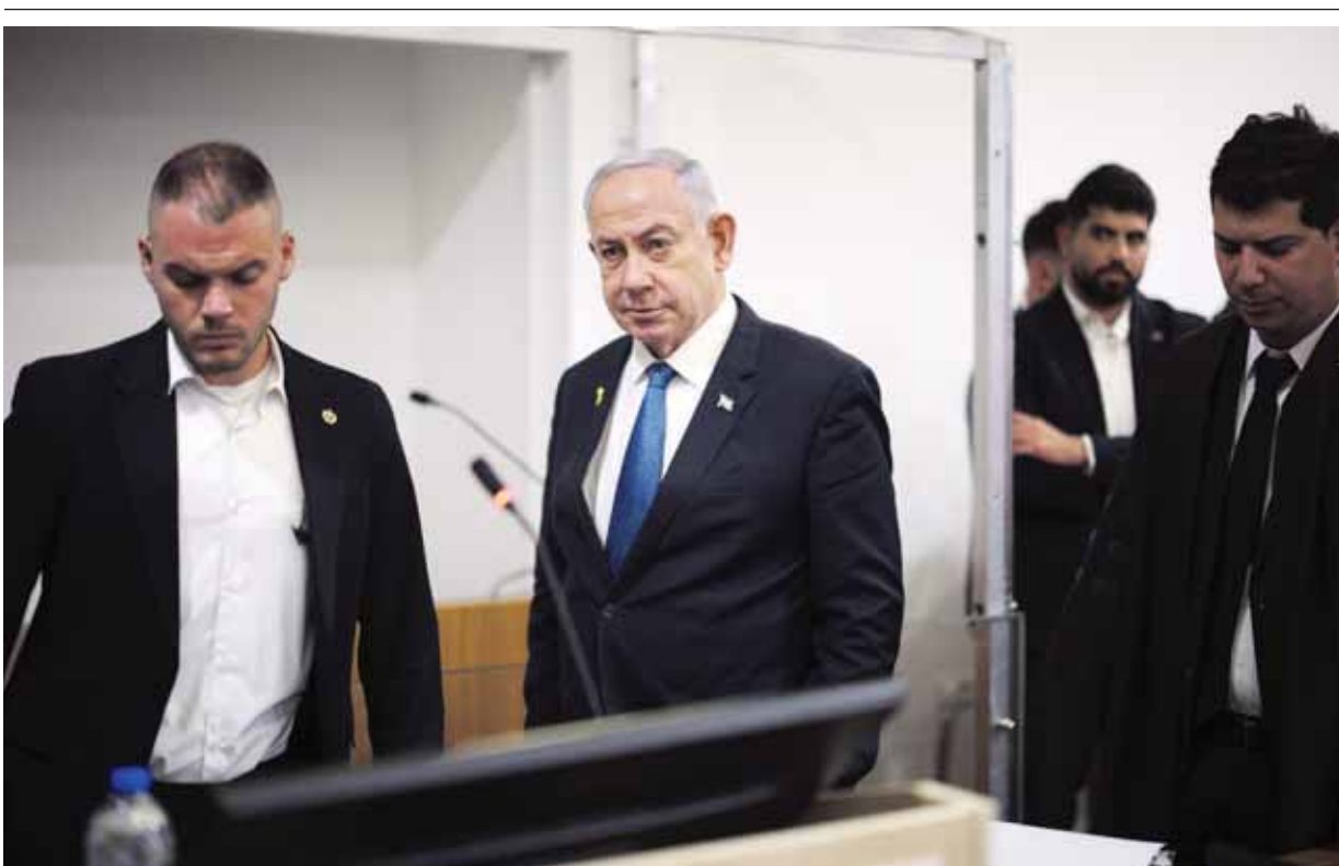
Israeli Prime Minister Benjamin Netanyahu attends his trial on corruption charges at the district court in Tel Aviv, Israel, on Monday.