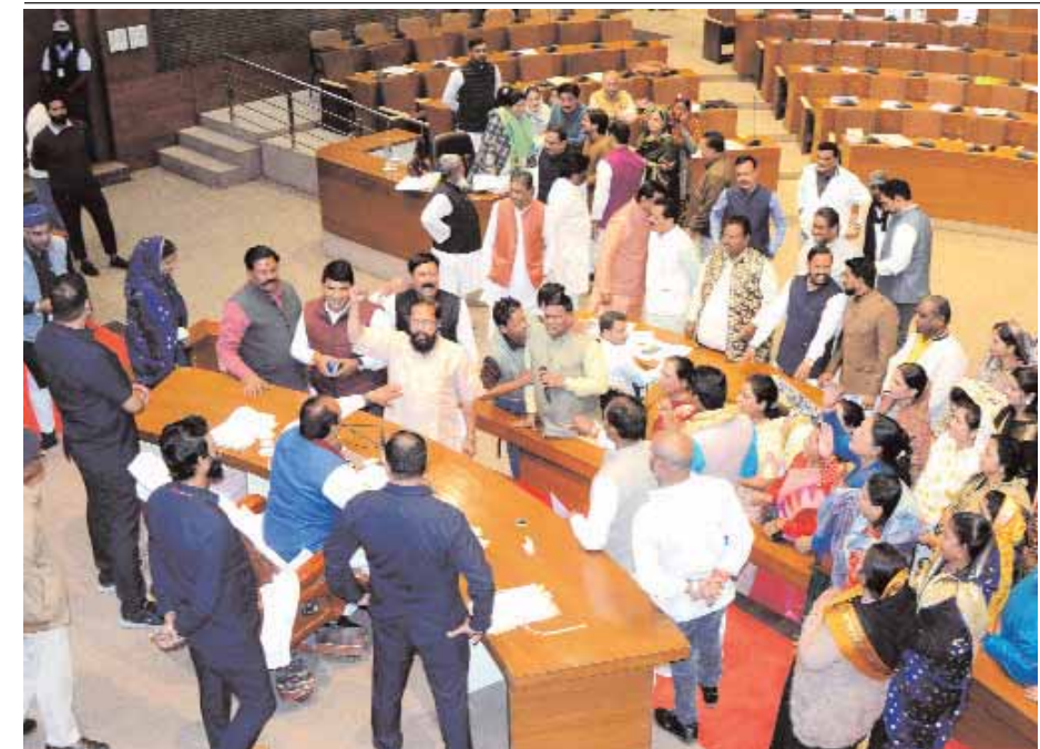
Congress corporators stage a protest in front of the Speaker over the removal of Congress party hoardings ahead of the party's call for a demonstration against BJP state government, during BMC council meeting in Bhopal on Friday.