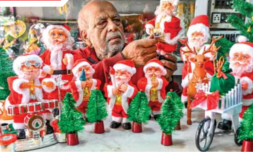
A vendor displays miniatures of Santa Claus ahead of Christmas celebrations, in Nadia