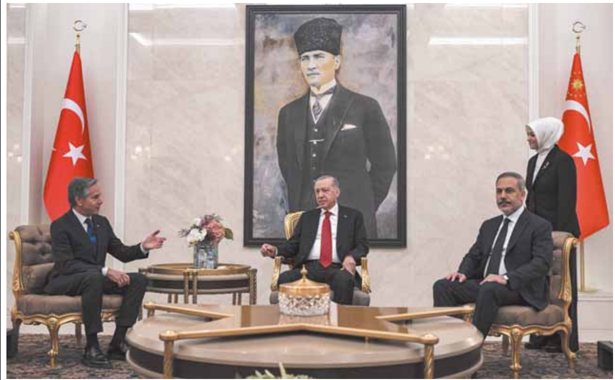
US Secretary of State Antony Blinken, left, meets with Turkey's President Recep Tayyip Erdogan, middle, and Foreign Minister Hakan Fidan, at Ankara Esenboga Airport.

doing, was also expelled from Denmark permanently, and he was denied the right to participate in the management of a business in Denmark or abroad without being personally and unlimitedly liable for the company's obligations. He has lodged an appeal against the Glostrup district court's verdict in the High Court. According to the Danish Prosecution Service (AnklageMyndigheden), the British national was convicted of committing fraud of a "particularly serious nature for 9,025,205,871 kroner (GBP 1bn) and attempted fraud for an additional 553,346,302 kroner during a period from 2012 to 2015".