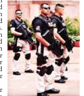
The specific purpose of security of the prime minister but in view of the order of the Supreme Court dated October 29, 2018, the prayer made in the M.A. Cannot be granted," the NGT had said.

The Special Protection Group (SPG), which protects the Prime Minister, on Friday, moved the Supreme Court (SC) challenging an order of the National Green Tribunal (NGT) which refused to allow extension of registration period of three specialised armoured vehicles by five years. The matter came before a bench of Justices Abhay S Oka and Augustine George Masih, which took objection that the elite force approached the NGT for registration of its vehicle instead of moving the top court in the MC Mehta matter. The SC has been monitoring the air pollution crisis in Delhi in an ongoing Public Interest Litigation in the MC Mehta case. Appearing for the SPG, Solicitor General Tushar Mehta, urged the Bench to consider the matter on an urgent basis and sought extension of registration period citing