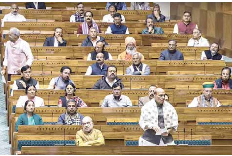
Defence Minister Rajnath Singh speaks during a discussion on the 75th anniversary of the adoption of the Constitution of India in the Lok Sabha during the Winter Session of Parliament