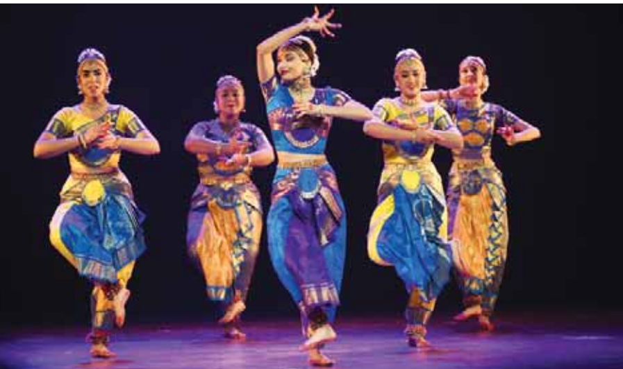
"Art reflects a culture's spirit, capturing its traditions, dreams and enduring beauty"

The Parampara Series 2024 at New Delhi's Kamani Auditorium brought together three evenings of exceptional artistry, celebrating India's classical dance and music heritage. Each performance honoured the depth and diversity of the country's cultural traditions, showcasing the seamless blend of history and creativity that continues to inspire across generations. The series opened with a riveting Kuchipudi presentation by the renowned Raja Radha Reddy Repertory. Their storytelling and precision enthralled the audience, setting an inspiring tone for the evenings to come. This was followed by the soulful Hindustani vocals of Mahesh Kale, whose emotive artistry left a lasting impression. The second evening shone a spotlight on the SRJAN Ensemble, who brought the intricate elegance of Odissi to life through their refined movements and expressions. Accompanying this visual splendour was the Hindustani flute recital by maestro Rakesh Chaurasia, whose