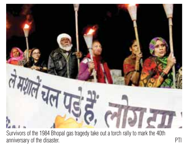
Survivors of the 1984 Bhopal gas tragedy take out a torch rally to mark the 40th anniversary of the disaster.

PIONEER NEWS SERVICE ■ BHOPAL Organisations representing survivors of the Bhopal gas tragedy on Tuesday took out a protest march to mark the 40th anniversary of one of the biggest industrial disasters in the world and demanded an end to the "injustice" faced by them. The rally participants, carrying an effigy of "corporate crime" at the now defunct Union Carbide factory site, denounced various regional, national and international leaders and relief organisations for their