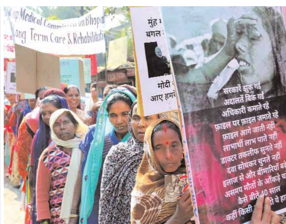
Surviving gas victims protest during a rally on the 40th anniversary of gas disaster in Bhopal on Tuesday.

Chief Minister Mohan Yadav paid a heartfelt tribute to the deceased victims on the 40th anniversary of the Bhopal gas tragedy. He said that on the day of this disaster, I was on my way to Bhopal. Its pain can be felt only by those who have experienced it.