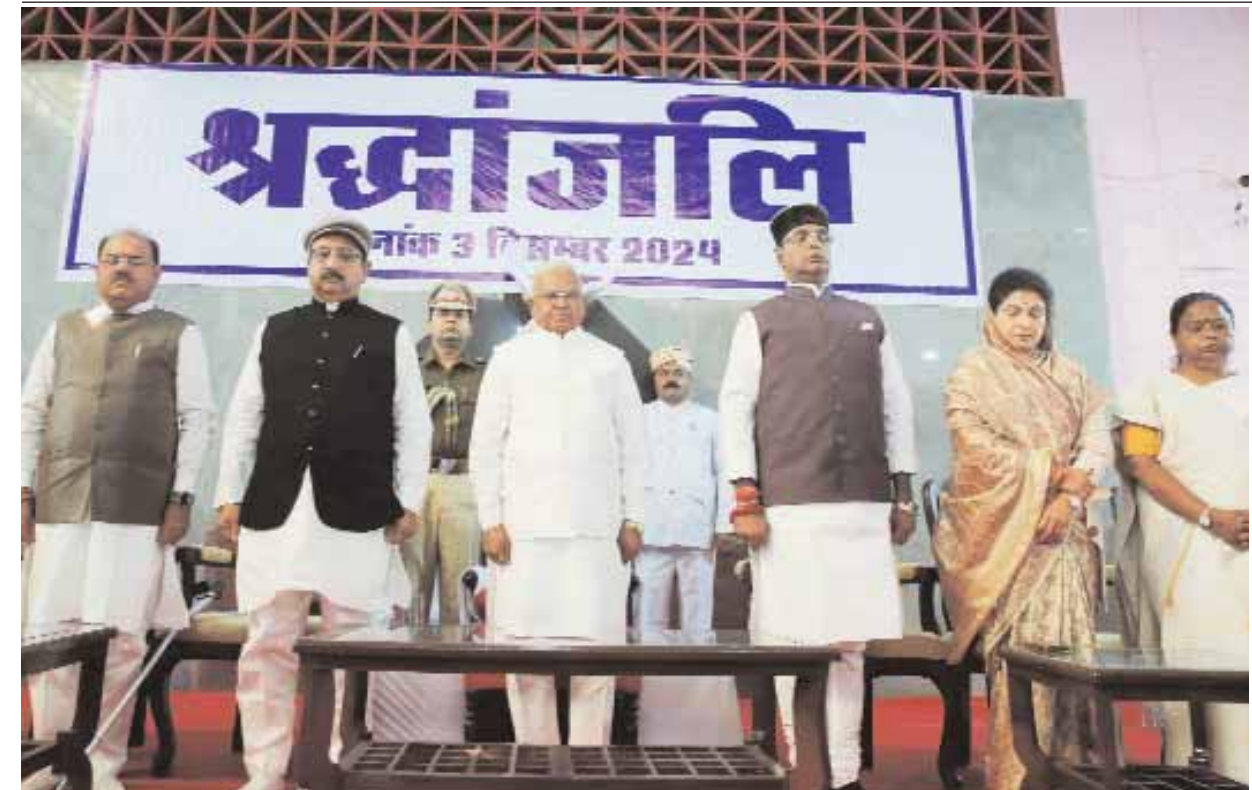
Madhya Pradesh Governor Mangubhai Patel during an all-religion prayer meeting to pay tributes to victims on the 40th anniversary of the 1984 gas disaster in Bhopal on Tuesday.

In the Sambal Yojana, the benefits of all schemes like funeral assistance, ex-gratia assistance on death or disability, education incentive scheme, maternity assistance, Ayushman Bharat, ration slip etc. are being given. The state government also runs many schemes for lakhs of construction workers of the state through the Nirman Mandal, which also includes ex-gratia assistance on death of construction workers and assistance on permanent and partial disability. All Sambal beneficiaries have been identified in the eligible category under Ayushman Bharat Niramaya Yojana. Now they are also getting free medical treatment worth Rs 5 lakh annually. So far, 1 crore 73 lakh workers have been registered under Sambal 2.0 scheme in the state.