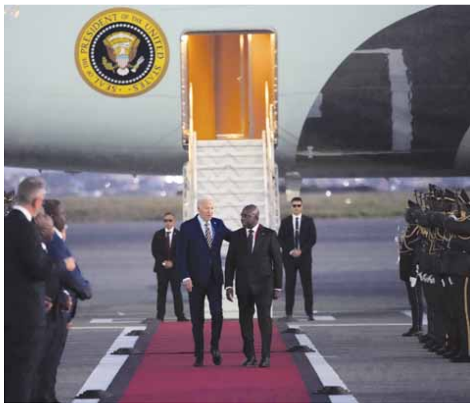
President Joe Biden is greeted by Angolan Foreign Minister Tete Antonio as he arrives at Quatro de Fevereiro international airport in the capital Luanda, Angola long-promised visit to Africa.