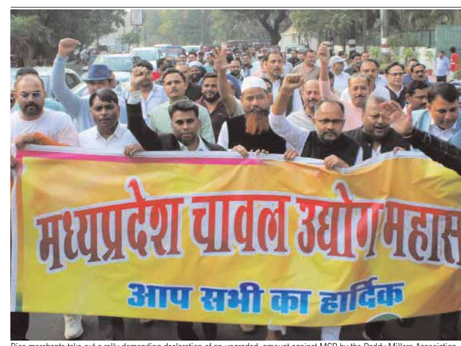
Rice merchants take out a rally demanding declaration of an upgraded amount against MSP by the Paddy Millers Association in Bhopal on Tuesday.