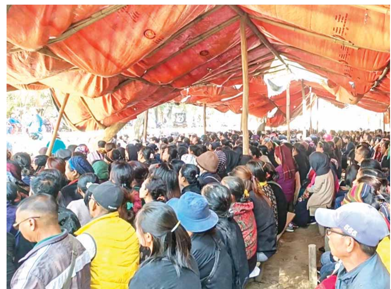
Members of the United Zou Organization (UZO) stage demonstration against the decision to scrap the Free Movement Regime and fence the India-Myanmar border.

PIONEER NEWS SERVICE ■ CHENNAI Chandigarh has become the country's first administrative unit where 100 per cent implementation of the three criminal laws has been done with Prime Minister Narendra Modi on Tuesday saying these new legislations are becoming protector of citizen's rights and the basis of ease of justice. The laws -- Bharatiya Nyaya Sanhita, Bharatiya Nagrik Suraksha Sanhita and Bharatiya Sakshya Adhiniyam - came into effect on July 1, replacing the British-era Indian Penal Code, Code of Criminal Procedure and the Indian Evidence Act, respectively. Chandigarh has become the country's first administrative unit where 100 per cent implementation of the three laws has been done. Speaking on the occasion, the prime minister said the new criminal laws represent a concrete step towards realising the ideals enshrined in the Constitution for the benefit of all citizens. He said the new laws came into effect at a time when country is moving ahead with the pledge of "Viksit Bharat" and 75 years of adoption of Constitution have been completed, thus the launch of the Bharatiya Nyaya Sanhita, rooted in constitutional values, is a significant occasion.