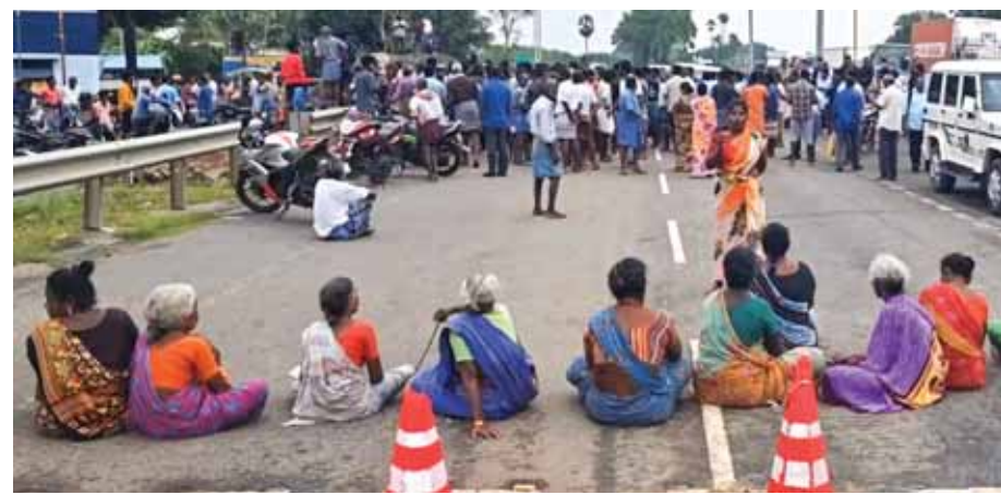
Residents affected by cyclone Fengal in Villupuram block Chennai-Tiruchirappalli National Highway demanding relief from the government.