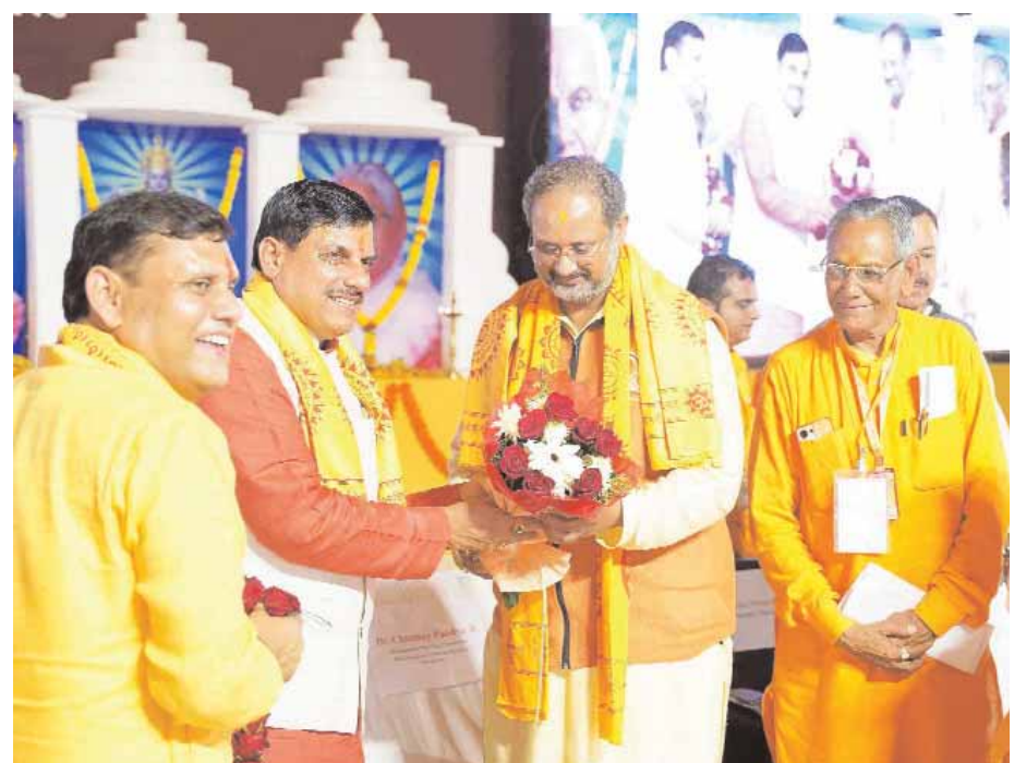
Madhya Pradesh Chief Minister Mohan Yadav being felicitated during the 251 Kundiya Gayatri Maha Yagya at a Gayatri Parivar programme in Dungaria village, Balaghat district Madhya Pradesh on Tuesday.

ment is committed to providing good health and medical facilities to every citizen of the state. There were 5 medical colleges in the state in 2003-04, which we have increased to 17. Not only this, the number of private medical colleges in the state has also increased to 13. 12 more government colleges will be established in the coming year. Besides, 13 new Ayurvedic colleges will also be opened, one of which will also be opened in Balaghat. Yadav praised the Swadeshi Fair and said that displaying Ayurvedic medicines for sale here is a good initiative. During Covid, the entire country understood the importance of the life-saving power of our indigenous Ayurvedic medical system. Ayurveda has immense potential, hence the state government is leaving no stone unturned to promote it.