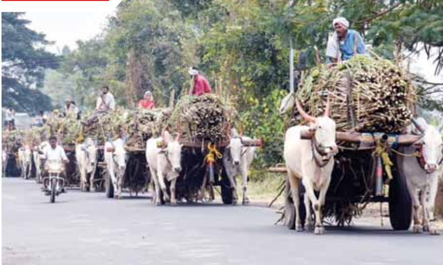
Bullock carts loaded with sugarcane head towards the Sugar Factory for crushing, in Karad