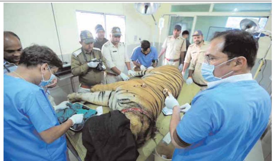
Veterinarians and forest officials treat an injured Tiger 'Chhota Bheem' known to be the biggest Tiger of Bandhavgarh Tiger reserve after being rescued, at Van Vihar National Park in Bhopal on Tuesday. The Tiger was injured by the poachers at Bandhavgarh tiger reserve.