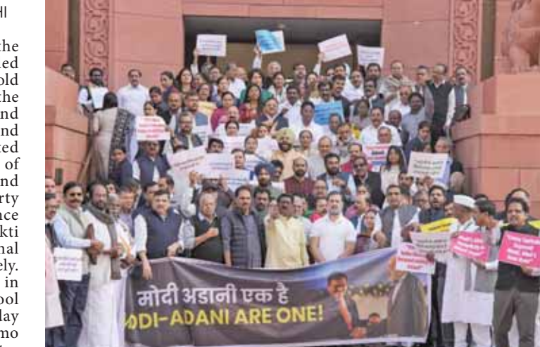
Leader of Opposition in the Lok Sabha Rahul Gandhi and other Opposition MPs stage a protest during the Winter session of Parliament

Fissures are visible in the Opposition's Congress led INDIA Bloc, after the grand old party's massive defeats in the recent Maharashtra and Haryana Assembly elections and not much appreciated performance in the State polls of Jharkhand and Jammu and Kashmir where the party contested with its alliance partners, Jharkhand Mukti Morcha (JMM) and National Conference (NC), respectively. Rather one of the key allies in INDIA Bloc, Trinamool Congress (TMC), on Tuesday pitched for their party supreme West Bengal Chief Minister Mamata Banerjee be made the Bloc leader for all practical purposes, as the woman leader has a "100 per cent record" to take the Bharatiya Janata Party (BJP). Partners like TMC, Samajwadi Party (SP) have raised eyebrows as the alliance could not work in the bypolls of Uttar Pradesh other States and the defeats have been shouldered on Congress. Congress found itself without its key allies, including the SP and TMC during a joint Opposition protest in the Parliament complex on Tuesday.