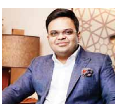
As of now, the Pakistan Cricket Board (PCB) has decided to accept the 'Hybrid Model' under which India play their matches in Dubai. But the PCB also wants the same courtesy to be accorded to Pakistan in all four ICC tournaments till 2031, which will be co-hosted or singularly hosted by the Indian cricket board. Now, as the head of the global body and with less than 100 days left for the tournament to begin, Shah will have to coordinate with both the PCB and his former colleagues at the BCCI for an "acceptable solution" in order to organise a hassle-free tournament.

PTI ■ DUBAI I ndian cricket administrator Jay Shah on Sunday took charge as the chairman of the International Cricket Council (ICC) with an immediate goal of ending the impasse surrounding the Champions Trophy and a broader vision of making cricket a commercially viable Olympic sport. The 36-year-old Shah, who headlined the BCCI as its secretary for the last five years, is the fifth Indian and the youngest ever to head the global cricket body. He was the unanimous choice of the ICC's Board of Directors and replaced New Zealand attorney Greg Barclay, who didn't wish to continue for a third consecutive term. Before Shah, businessman late Jagmohan Dalmiya, politician Sharad Pawar, lawyer Shashank Manohar and industrialist N Srinivasan have all headed the world cricket body. Shah, the son of India's Home Minister Amit Shah, will have his task cut out as the ICC looks to find an acceptable solution to implement the 'Hybrid Model' for the Champions Trophy originally scheduled in Pakistan.