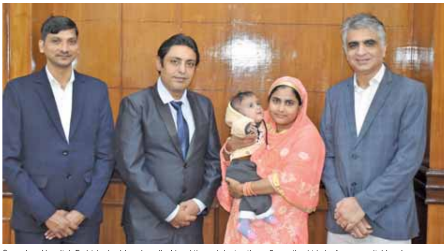
Sarvodaya Hospital, Faridabad achieved medical breakthrough by treating a 5-month-old baby for congenital hearing impairment making him the youngest in India to undergo a cochlear implant surgery.

The 17th edition of CPHI & PMEC India, organised by Informa Markets in India took place at the India Expo Centre, Greater Noida, Delhi-NCR. Over 50,000 global industry professionals, including key decision-makers, gathered to explore new partnerships and growth opportunities. The expo featured forward-thinking discussions on sustainability, digital transformation, and the future of pharma, with a special focus on empowering women in the industry.