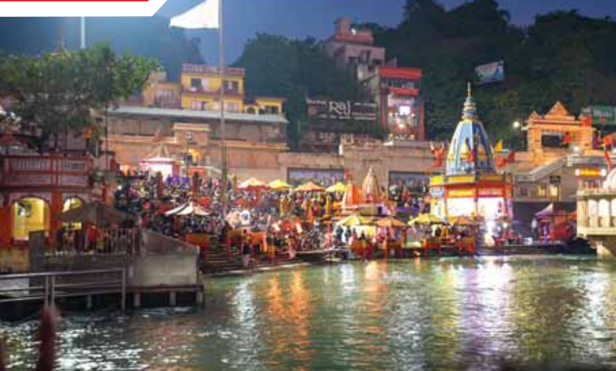
Devotees attend 'Ganga Aarti' at Har Ki Pauri, in Haridwar