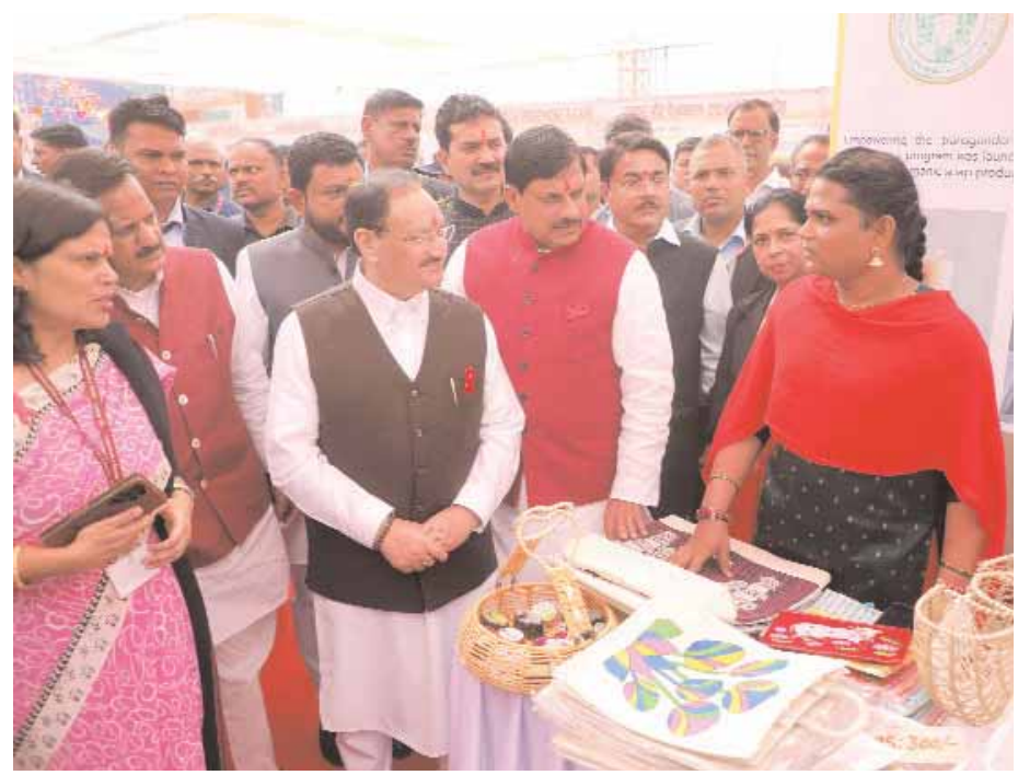
BJP National President and Union Minister for Health and Family Welfare JP Nadda with Madhya Pradesh Chief Minister Mohan Yadav during an exhibition at Hunat Haal, on the occasion of World AIDS Day in Indore, Madhya Pradesh on Sunday.

The number of seats in medical colleges has been increased. Madhya Pradesh also tops the country in the implementation of Ayushman Bharat scheme. Yadav expressed his gratitude to Nadda for organizing this programme in Indore on World AIDS Day. He said the event will bring together communities, youth, beneficiaries and various organizations to address the challenges and achieve the global goal of eliminating HIV/AIDS by 2030. We will endeavor to achieve the global goal by 2028 by working in line with the UN theme, "Take the Rights Path". Such programmes will create awareness in society. It will help in fighting the war against HIV/AIDS. By bringing society together, awareness will be brought into the fight against HIV/AIDS.