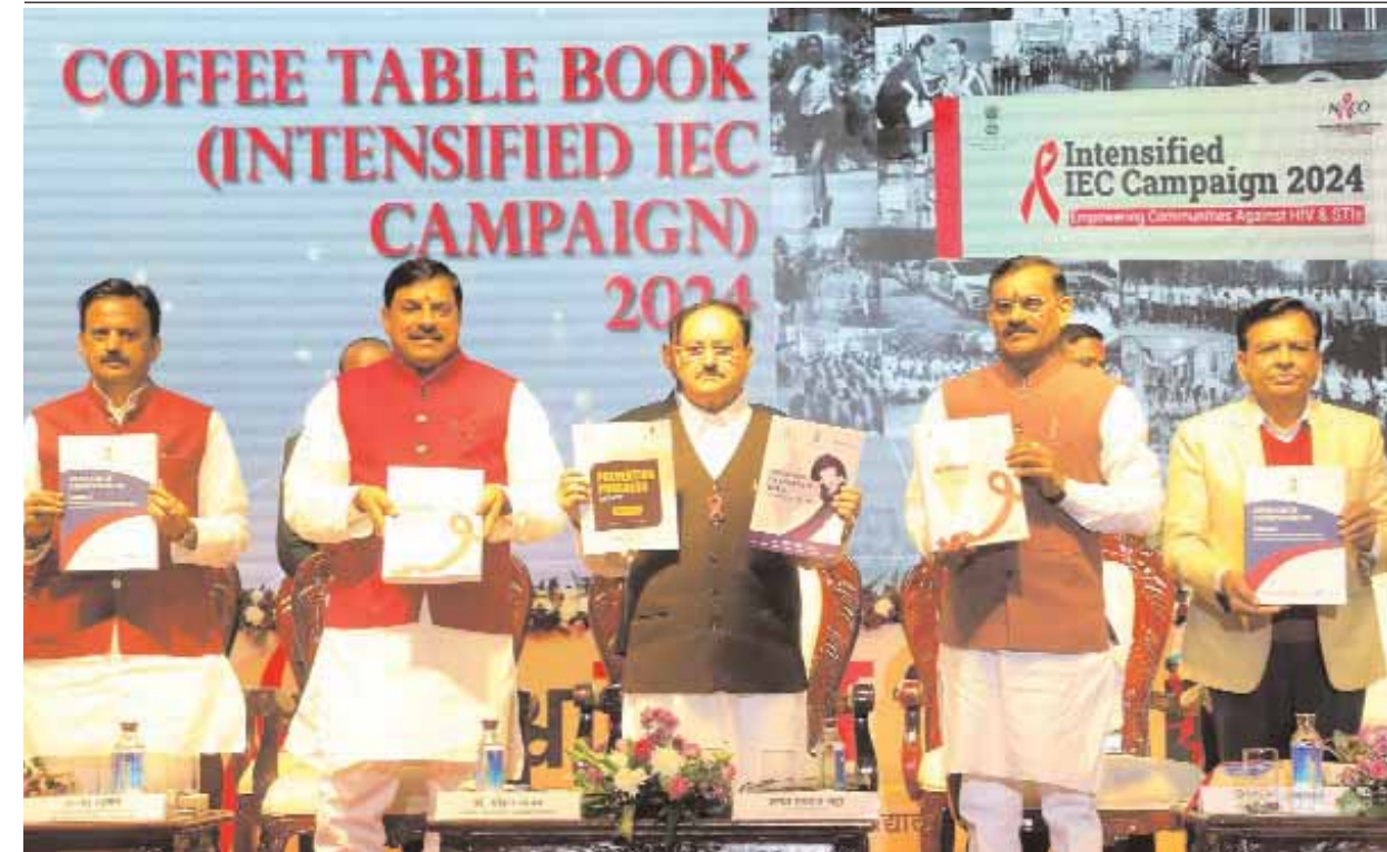
BJP National President and Union Minister for Health and Family Welfare JP Nadda with Madhya Pradesh Chief Minister Mohan Yadav, BJP State President VD Sharma Deputy Chief Ministers Rajendra Shukla and Jagdish Devda release a coffee table book during a programme on the occasion of World AIDS Day in Indore, Madhya Pradesh on Sunday.

devised for those joining the Dua at the Ijtema venue on Monday. Vehicles coming into the city from Vidisha and Sehore will be parked at the Lambakheda Bypass, while traffic from Berasia will be diverted to the designated parking spots at Golkhedhi. Organisers say that thousands of volunteers will work alongside traffic officials and personnel to ensure minimal traffic disruptions as congregants make their way to railway stations, bus stands, and the airport for the return journey home. This year, congregants of 34 nationalities participated in the event. They listened to the sermons by Tablighi Jamaat elders and promised to take the message back to their native lands and neighbourhoods.