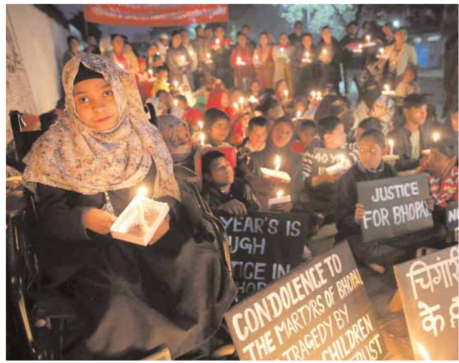
Children born with congenital disabilities, believed to be caused by the exposure of their parents to gas leakage during the Union Carbide gas leak disaster, along with their relatives and supporters, take part in a candlelight vigil to pay homage to the people killed in the 1984 Bhopal gas tragedy to mark the 40th anniversary of the disaster, in Bhopal on Sunday.

was also injured in the incident. The attack, which took place at 3:30pm when the Union civil aviation minister and Guna Lok Sabha MP was scheduled to inaugurate a weed harvester machine and resulted injuries to some persons, may have been caused due to bees getting disturbed by drones being flown for security purposes and photography, eyewitnesses said. Scindia was accompanied by state energy minister Pradyuman Singh Tomar, Shivpuri MLA Devendra Jain and other leaders when the incident took place. The minister returned without inaugurating the weed harvester machine, eyewitnesses said.