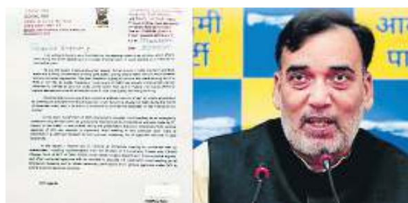
ation by the Delhi government