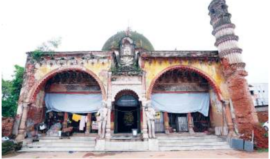
Aukhra Nimbarika Peeth Mahanta Asthal, a 250-year-old Mutt in East Bardhaman