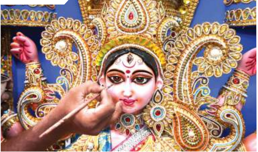
A painter gives final touches to the Goddess Durga's idol ahead of Durga pooja, in Kolkata