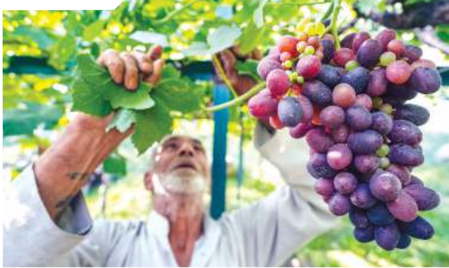
A farmer harvests grapes, at Repora Lar area in Ganderbal, Kashmir