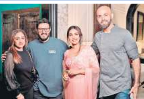
Bhumi Pednekar, Bhushan Kumar, Shaheer Sheikh, Jimmy Shergill, Jackky Bhagnani, Rakul Preet Singh, Tahira Kashyap, Rhea Chakraborty and more attended the success bash of Phir Aayi Hasseen Dilruba hosted by writer-producer Kanika Dhillon at her residence.