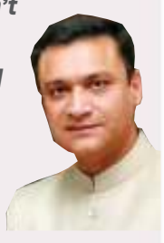
- Akbaruddin Owaisi, AIMIM MLA

My college provides free education to 40,000 students. Shoot me, but don't destroy my college. The skills I am imparting to our students are making others envious. If someone has enmity with me, come and finish me. But don't try to stop the good work I am doing. Although I am now requesting, it doesn't mean that I don't have the strength to fight my enemies. I have been attacked and have wounds on my front side. Akbaruddin Owaisi is not a person who will show his back to enemies.