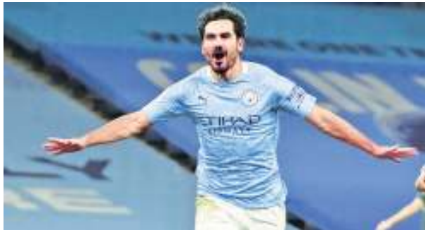
■ MANCHESTER

Ilkay Gundogan is back at Manchester City for a sequel few could have expected. A year after leaving for Barcelona, the former Germany midfielder completed his unlikely return to City on Friday on a free transfer and a season-long deal. The 33-year-old Gundogan, who has the option of a further season at City, was the captain when Pep Guardiola's team captured the Premier League-FA Cup -Champions League treble in the 2022-23 campaign. That confirmed his place in the growing pantheon of City greats, having already been in the conversation most notably after scoring two late goals