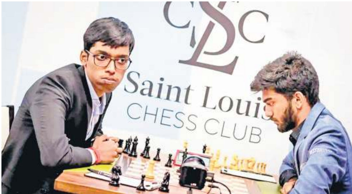
SAINT LOUIS (USA)

World Championship challenger D Gukesh enjoyed an advantageous position against tournament co-leader Alireza Firouzja of France but eventually settled for a draw in the fourth round of the Sinquefield Cup, here. Gukesh, who is set to play the World championship match against Ding Liren of China next November, proved that he is made of sterner mettle as he made Firouzja's life tough. Grandmaster