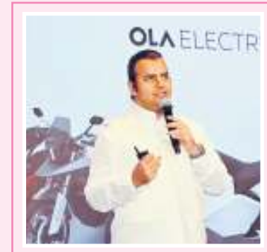
5,500 crore from its initial public offering.

Ola Electric got listed on the bourses on August 9. The company raised Rs