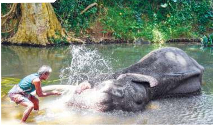
A mahout bathes an elephant at Elephanti Orphanage in Pinnawala