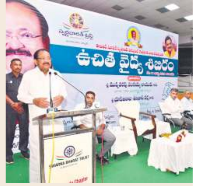
Former Vice-President Venkaiah Naidu addressing the gathering at a medical camp at the Swarna Bharathi Trust at Atkuru on Sunday

He also advised parents to encourage their children to