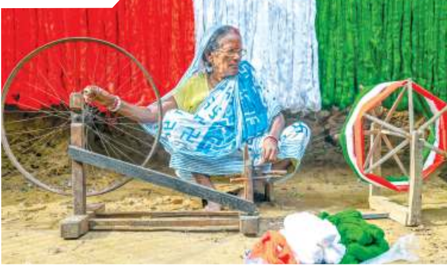
An elderly woman spins tricolour yarns ahead of the Independence Day in Nadia district