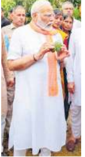
new varieties with farmers. Farmers present on the

Prime Minister Narendra Modi on Sunday released 109 high-yielding, climate-resilient and biofortified seed varieties of agricultural and horticultural crops, aiming to enhance farm productivity and farmers' income.