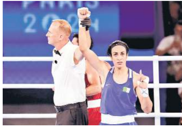
but cheers during their bouts. A huge contingent of flag-waving Algeria fans greeted and serenaded Khelif throughout her semifinal victory Tuesday night, and she's become a hometown hero in her North African country. Khelif has already secured Algeria's first Olympic medal in women's boxing. She will attempt to become only her country's second boxing gold medalist, joining Hocine Soltani (1996). The gold medal fight is the culmination of Khelif's nine-day run through an Olympic tournament that began with a bizarre event. Khelif's first opponent, Angela Carini of Italy, abandoned their bout after just 46 seconds, saying she was in too much pain from Khelif's punches. An already brewing story suddenly became major international news, with the likes of former US President Donald Trump and "Harry Potter" author JK Rowling

years of concerns about its governance, competitive fairness and financial transparency. The IOC has called the arbitrary sex tests that the sport's governing body imposed on the two boxers irretrievably flawed. The IBA did nothing to help its argument this week at a shambolic news conference in which its leadership contradicted itself about the tests and declined to answer basic questions about them, citing privacy concerns from the Olympic committees of Algeria and Taiwan. The IOC repeatedly reaffirmed the two boxers' right to compete in Paris, with President Thomas Bach personally defending Khelif and Lin while calling the criticism "hate speech." "We have two boxers who are born as women, who have been raised as women, who have a passport as a woman and have competed for many