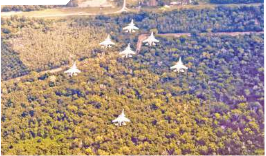
Military aircrafts during the multinational air exercise 'Tarang Shakti 2024', in Sullur