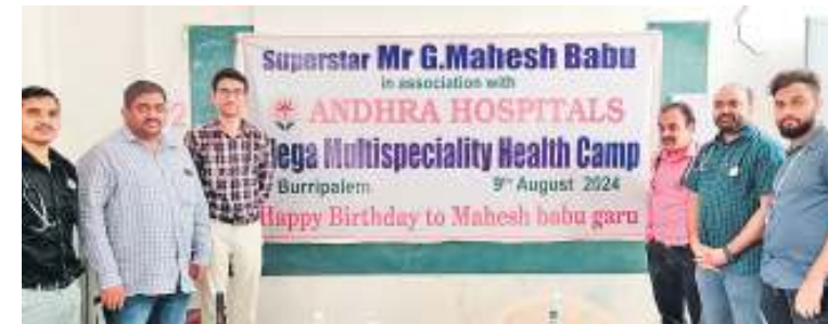
All specialty consultations, investigations were done, medicine distributed

A mega multispeciality camp was organised at Burrripalem by Andhra Hospitals on the occasion of actor G Mahesh Babu's birthday on Friday. The camp was organised by Mahesh Babu in association with Andhra Hospitals. All specialties including General Medicine, General Surgery, Orthopaedic, Paediatrics, Cardiology, and ENT were covered. An awareness session was also conducted on common health problems.