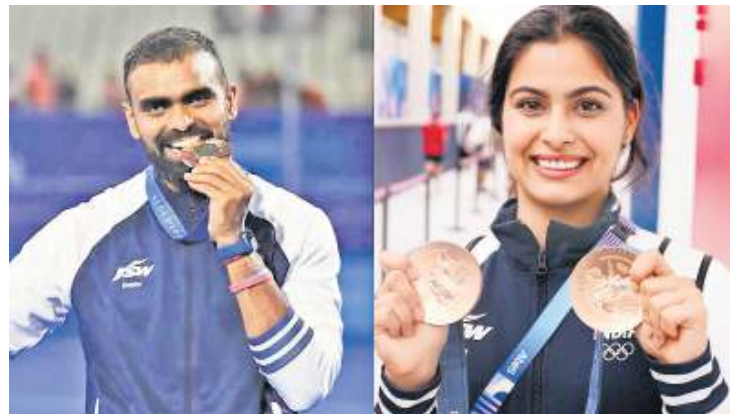
"I spoke with Neeraj Chopra and appreciate the spontaneity and grace with which he agreed that Sreejesh should be the flag-bearer at the Closing Ceremony," Usha said in a statement. "He told me 'Ma'am, even if you had not asked me, I would have suggested

Celebrated hockey goalkeeper PR Sreejesh will join star shooter Manu Bhaker as the flag-bearer of the Indian contingent in the closing ceremony of the Olympic Games here on Sunday, a fitting honour and recognition for his contributions to the team. Before homing in on Sreejesh, Indian Olympic Association (IOA) chief PT Usha spoke with Neeraj Chopra, and she said even the superstar javelin thrower wanted to see the retiring legend as flag-bearer. Chopra claimed a silver here to become the first Indian track and field athlete to win two Olympic medals. He won a historic gold in the Tokyo edition three years ago.