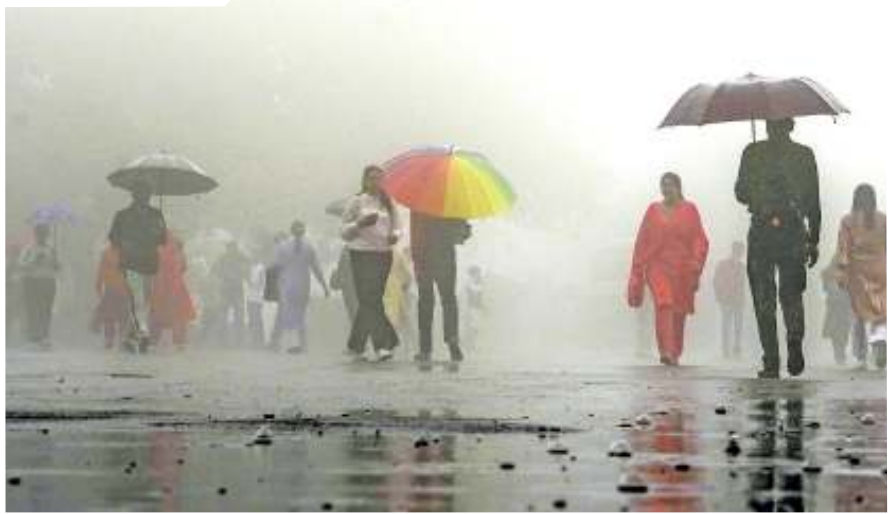
People walk to their work as torrential rains lash Shimla