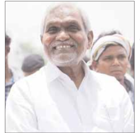
Former CM Champai Soren and his son.

Champai met union home minister Amit Shah late Monday night in New Delhi along with Assam chief minister Himanta Biswa Sarma, who is also the saffron party's co-incharge of Jharkhand assembly elections,