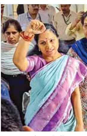
Bharat Rashtra Samithi (BRS) leader Kalvakuntla Kavitha FILE PHOTO

had to show that Kavitha was involved in the alleged scam. The bench noted that the investigation is complete and chargesheet/prosecution complaint has been filed in both the CBI and ED cases. Hence, the custodial interrogation of the petitioner, who has been behind the bars for over five months, is no longer necessary.