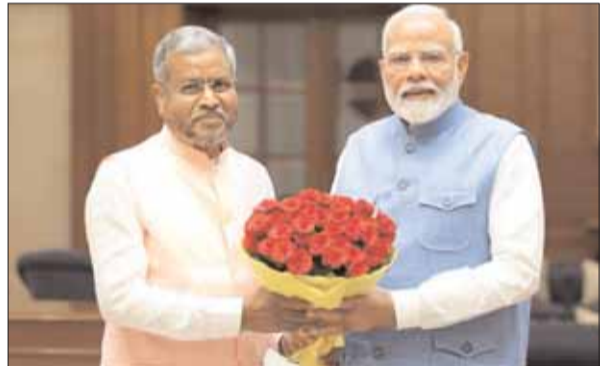
State BJP President Babul Marandi meets Prime Minister Narendra Modi in New Delhi on Tuesday.

Sources said that the induction of former chief minister and Jharkhand Mukti Morcha rebel Champai Soren into the BJP has led to disappointment of Babul Marandi, longtime BJP leader of the state, who has