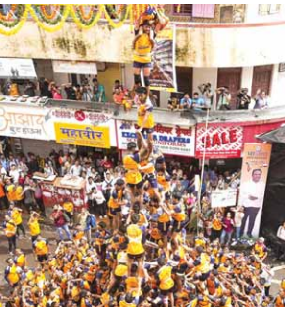
Devotees form a human pyramid to break the 'dahi handi', an earthen pot filled with curd, as part of Janmashtami celebrations, at Dadar, Mumbai, on Tuesday