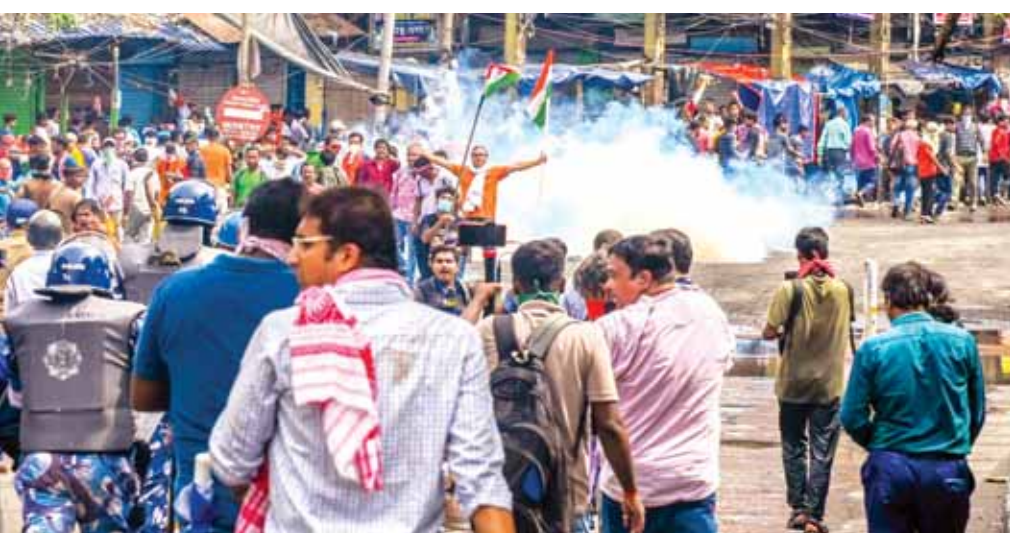
Tear gas shells being used by security personnel to disperse students during their protest march towards West Bengal Secretariat over the alleged sexual assault and murder of a trainee doctor, in Kolkata, on Tuesday

Many people, including policemen, were injured in pitched battles intermittently fought at various locations of Kolkata and Howrah between the men in uniform and students protesting against the rape and murder of the lady doctor at a medical college in Kolkata.