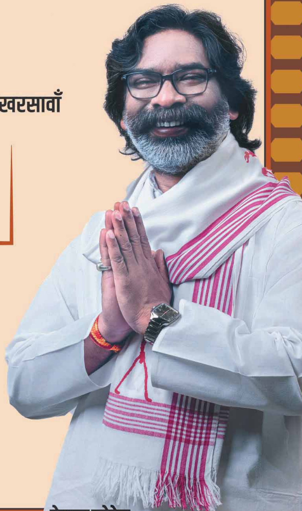
हेमन्त सोरेन मुख्यमंत्री, झारखण्ड

सितंबर से हर महीने की 15 तारीख को हर बहन के खाते में पहुँचेंगी सम्मान राशि