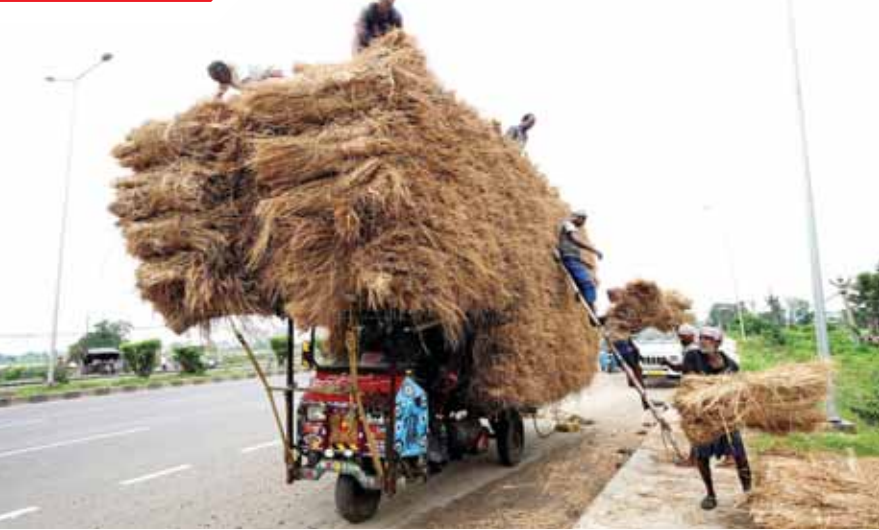
Workers load heaps of straw on an autorickshaw, in Bardhaman