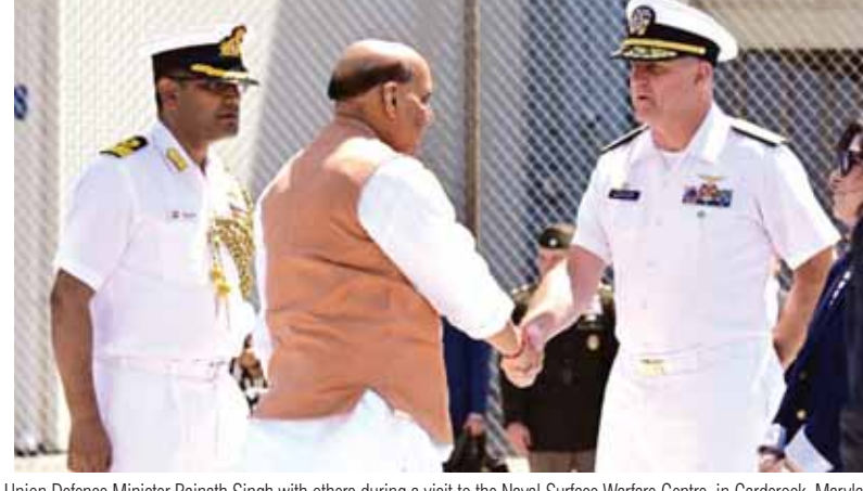
Union Defence Minister Rajnath Singh with others during a visit to the Naval Surface Warfare Centre, in Carderock, Maryland, USA