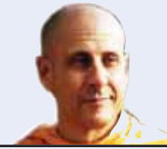
RADHANATH SWAMI MAHARAJ

Understanding and managing stress effectively is essential for a healthier life