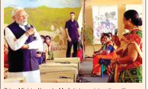
Prime Minister Narendra Modi during an interaction with Lakhpati Didis, in Jalgaon, on Sunday