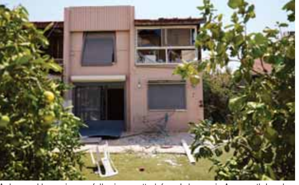
A damaged house is seen following an attack from Lebanon, in Acre, north Israel, on Sunday