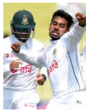
Mehidy picked up 4-21 and Shakib 3-44 while the three fast bowlers Shorifur Islam, Hasan Mahmud and Nahid Rana snared one wicket each.

on 15 and 9, respectively, as Bangladesh reached 30-0 at the stroke of the tea interval for only its seventh away test win and the first since beating New Zealand at Mount Maunganui in January 2022. Pakistan, which conceded a 117-run first innings lead despite declaring at 448-6, was bowled out by a disciplined pace and spin attack after it resumed on 23-1 and still 94 runs behind. Mohammad Rizwan followed his career-best unbeaten 171 to top-score with 51 but most of his teammates were guilty of falling to rash shots coupled with some aggressive field placings by Bangladesh skipper Najmul Hossain Shanto.