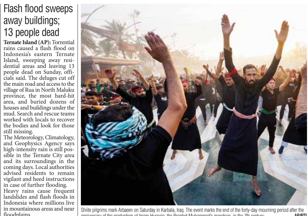
Shiite pilgrims mark Arb'een on Saturday in Karbala, Iraq. The event marks the end of the forty-day mourning period after the anniversary of the martyrdom of Imam Hussein, the Prophet Muhammad's grandson, in the 7th century

Torrential rains caused a flash flood on Indonesia's eastern Ternate Island, sweeping away residential areas and leaving 13 people dead on Sunday, officials said. The deluges cut off the main road and access to the village of Rua in North Maluku province, the most hard-hit area, and buried dozens of houses and buildings under the mud. Search and rescue teams worked with locals to recover the bodies and look for those still missing. The Meteorology, Climatology, and Geophysics Agency says high-intensity rain is still possible in the Ternate City area and its surroundings in the coming days. Local authorities advised residents to remain vigilant and heed instructions in case of further flooding. Heavy rains cause frequent landslides and flash floods in Indonesia where millions live in mountainous areas and near floodplains.