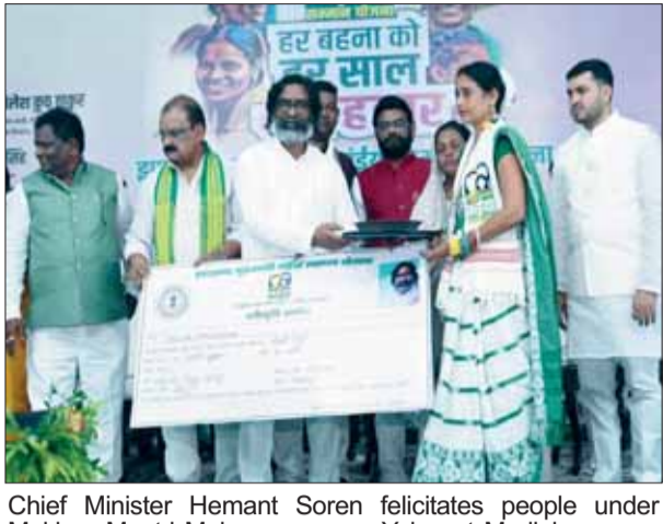
Chief Minister Hemant Soren felicitates people under Mukhya Mantri Maiyan samman Yojna at Medininagar on Thursday.

is no old person in the state without pension. Now the elderly do not need to wander here and there for pension. As soon as the prescribed age for pension is reached, the elderly are being directly linked to the pension scheme. He said that in view of the poverty in the state, our government is now providing pension to those above 50 years of age under the Universal Pension Scheme. The CM said that girls will no longer become a burden on the family. These girls will become doctors, engineers and officers and will bring glory to themselves, their family, society and the