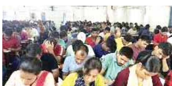
■ GUWAHATI

The Assam government on Thursday introduced a bill to make all applications for its jobs free for Scheduled Caste and Scheduled Tribe candidates.