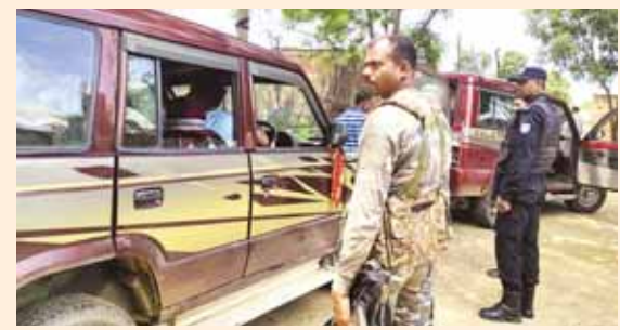
Security personnel outside the residence of a man allegedly linked to Al Qaeda, in Lohardaga, on Thursday. Seven people allegedly linked to Al Qaeda were detained by Jharkhand Anti-Terrorist Squad in raids in different parts of the State on Thursday

"The first thing is, is it true that the UD (unnatural death) was recorded at 10.30 hours (10.30 am)? Second, who is this assistant superintendent non-medical (person), her conduct is also very doubtful. Why did she act in this manner?" It directed the Kolkata Police officer, who registered the first entry about the incident that shocked the country, to appear in the next hearing and disclose the time of the entry. The court also observed that there seemed to be an attempt to pass off the murder as a suicide. Meanwhile, the Central Bureau of Investigation (CBI) while sharing a status report on the matter claimed that the crime scene was altered and tampered with which has hindered the further probe in the case. The CBI also informed the court that the FIR was lodged after and murder of a woman doctor at R G Kar Medical College and Hospital in Kolkata.