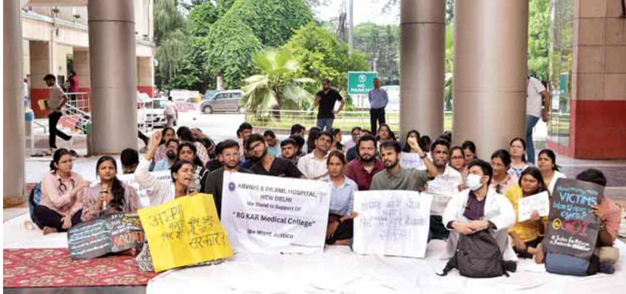
Doctor sitting on protest against the death of a doctor of RG Kar Hospital, at RML hospital on Thursday