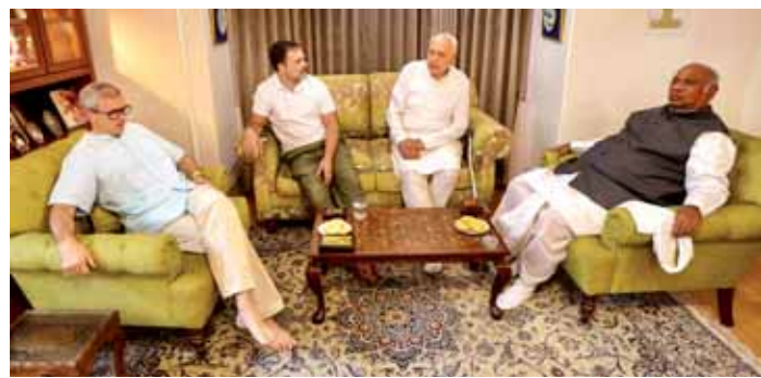
Congress president Mallikarjun Kharge with party leader Rahul Gandhi meets J&K National Conference president Farooq Abdullah and vice president Omar Abdullah, in Srinagar, on Thursday

Former alliance partners Congress and National Conference on Thursday decided to 'unitedly' contest the upcoming Assembly polls by forging a pre-poll alliance in Jammu and Kashmir. By finally stitching the deal, the National Conference has also put to rest all the speculations about the possibility of the post-poll alliance by the Kashmir-based mainstream regional parties with the ruling dispensation in New Delhi. The alliance partners have decided to contest all 90 seats as per the terms and conditions of the pre-poll alliance. The deal was struck between the two parties at the residence of Dr Farooq Abdullah in Srinagar. Omar Abdullah also attended the crucial meeting. Leader of the Opposition in Lok Sabha Rahul Gandhi, Congress chief Mallikarjun Kharge after addressing the workers meeting at a private hotel in Srinagar visited the Gupkar Road residence of Dr Abdullah where they held a closed-door meeting with the top brass of the National Conference discussing the contours of the pre-poll alliance. Soon after the meeting, the National Conference president Dr Farooq formally announced that the pre-poll alliance with Congress is final, and will be approved by this evening.