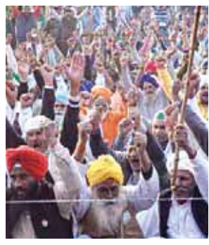
SHAMBHU BORDER BLOCKADE

The Supreme Court on Thursday said it would soon form a multi-member panel to amicably resolve the grievances of farmers "for all times" and asked both the Punjab and Haryana governments to persuade the agitators at the Shambhu border between the states to remove their tractors and trolleys from the site.