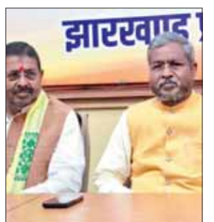
State BJP President Babulal Marandi with BJP senior leader Ravindra Rai during a meeting at party office in Ranchi on Thursday.

BJP State President Babulal Marandi said that the existence of the Indi alliance in Jharkhand is in danger. People are running away from the sinking boat. Marandi was speaking at the Milan Samaroh (new joining) program organized at the BJP State Office. Marandi said that BJP is currently struggling in the state and leaders are leaving the ruling party and joining BJP and becoming a partner in this struggle is a big thing. "Your contribution will give strength and power to the party not only in Sarakela, Jamshedpur but in the entire Jharkhand. Along with this, it will also send a good message in the state. This step of all of you is welcome. Struggle partners are welcome in BJP," Marandi added. He said that the condition of Jharkhand state today is not hidden from anyone. The Jharkhand government has failed on every front. The state government has cheated the youth, farmers, women, tribals, Dalits, backward classes of the state. The pot of sins of the current Jharkhand government is completely full, this