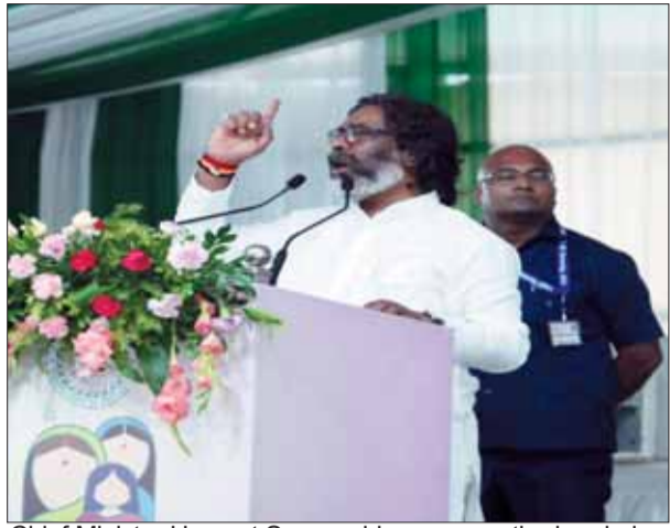
Chief Minister Hemant Soren addresses a gathering during a programme at Medininagar on Thursday.

Our society and state will progress only when the tribals, Dalits, poor, deprived, labourers, farmers and women are empowered. A strong Jharkhand can be built only by taking all of them together. This is the reason why our government is constantly working to empower them. In this series, Jharkhand Mukhyamantri Mainiya Samman Yojana has been started in the direction of giving dignity, respect and rights to women. This scheme dedicated to Nari Shakti will prove to be very helpful for the sisters and daughters of this state to move forward, said Chief Minister Hemant Soren while addressing the divisional level program of Jharkhand Mukhyamantri Mainiya Samman Yojana organized at Chianki Airport Complex in Medininagar (Palamu) on Thursday. The CM said that our government is not running from