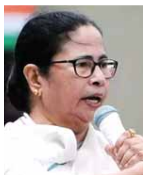
the NEET admissions will be effected," Sibal said, adding that the plea be heard during the day. A counsel, representing the state's Other Backward Classes (OBC) panel, said students are lining up for authentication of their OBC status for securing admissions to medical colleges and other institutions. "We will hear it on Tuesday (August 27)," the CJI said. The top court had on August 5 asked the state government to provide quantifiable data