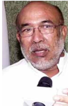
the doctored audio clip claiming to be that of Manipur Chief Minister N Biren Singh which is being circulated on social media platforms, the release said, adding that investigation is underway. The release said the Manipur government views acts of 'misinformation' and