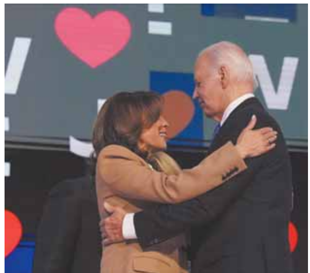
President Joe Biden embraces Democratic presidential nominee Vice President Kamala Harris during the first day of Democratic National Convention, Monday, in Chicago.