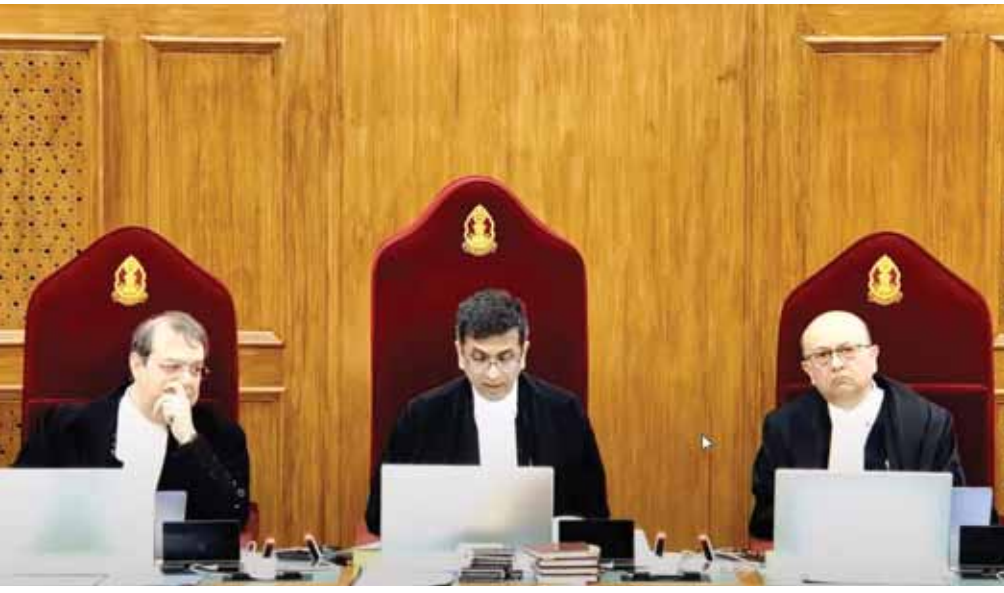
A bench comprising Chief Justice of India (CJI) DY Chandrachud, Justice JB Pardiwala and Justice Manoj Misra during hearing on a suo moto case related to the alleged sexual assault and murder of a postgraduate trainee doctor in Kolkata, at Supreme Court in New Delhi on Tuesday

Termining the incident of the rape and murder of a trainee doctor at the RG Kar Medical College and Hospital in Kolkata as "horrific and horrendous" and "a systemic failure of the State machinery," the Supreme Court on Tuesday constituted a 10-member National Task Force (NTF) to formulate a protocol for safety of doctors and healthcare workers at workplace.