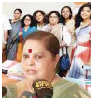
"The state government, frankly, ought to be ashamed of itself," Tharoor said. He said it is unforgivable to see the image of the Kerala film industry, which has a worldwide reputation, being tarnished this way after creating an unsafe working environment for women and perpetuating it through acts of intimidation, blackmail, and worse. He wondered how a state that was the first in the world to educate girls at the primary level about 200 years ago, allowed this to happen. "And worse is how those who are in authority in the state refused to do anything about a report that is a smoking gun sitting on their desk, and they are just pretending not to see the smoke," Tharoor said.

Congress Working Committee (CWC) member Shashi Tharoor on Tuesday came down heavily against the Kerala government for not acting on the Justice Hema Committee report, which according to him was a "smoking gun" that everyone ignored. The Thiruvananthapuram MP, addressing the media after participating in the Birth Day commemoration of Rajiv Gandhi here at the District Congress Committee office, said that it is utterly shameful and shocking that the government sat on this report for nearly five years and now released it under duress. "I saw a statement by the minister for cultural affairs, stating that these ladies could have come to the government and made a complaint, and they have only given a complaint to the commission. But the commission is appointed by the government. So, what kind of excuse is this?" Tharoor asked. He said it was absolutely indispensable that action be taken on the basis of the report.