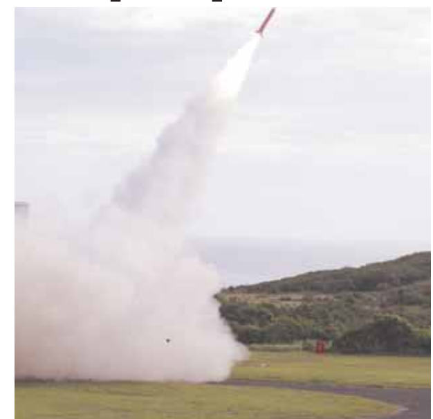
A MIM-104C (PAC-2) Patriot short-range anti-aircraft missile launches from Pingtung County, Southern Taiwan, on Tuesday.