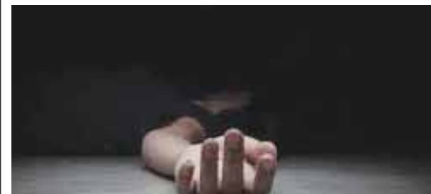
PTI ■ KOTA