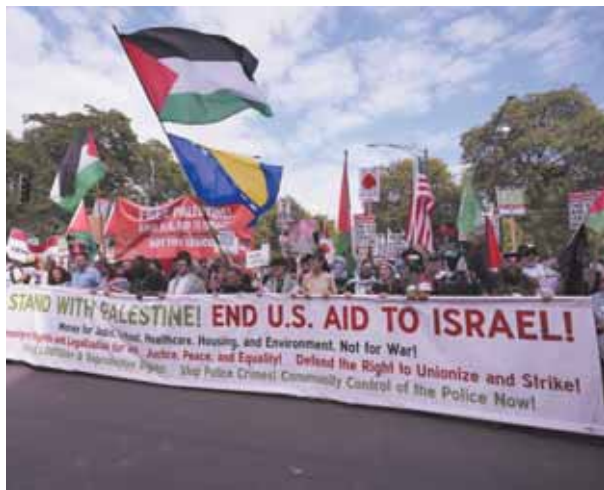
Protesters march to the Democratic National Convention after a rally at Union Park Monday, in Chicago.

The Israeli military said Tuesday that it recovered the bodies of six hostages taken in Hamas' October 7 attack that started the war in Gaza, as US and Arab mediators tried to advance an agreement to halt the fighting and release scores of other militant-held captives. The military said its forces recovered the bodies in an overnight operation in southern Gaza, without saying when or how the six died. A forum for hostage families said they were kidnapped alive. Hamas says some captives have been killed and wounded in Israeli airstrikes. An Israeli airstrike on Tuesday killed at least 10 people at a school-turned-shelter in Gaza City, in what the military said was a precise strike on a Hamas command center. Another strike killed a mother and her five children in central Gaza. The recovery of the remains is