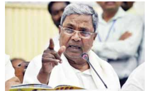
■ BENGALURU

Karnataka Chief Minister Siddaramaiah on Tuesday said Governor Thawarchand Gehlot should function like a representative of the President of India and not the central government. He said the Governor should not 'pick and choose' and be selective in the matter of granting sanction for prosecution. "Governor is a constitutional post and we respect it. What we say is that he should work as a representative of the President of India and not the Central government," Siddaramaiah told reporters here. Gehlot on August 16 granted sanction permitting investigation against Siddaramaiah under 17A of the Prevention of Corruption Act and prosecution under Section 218 of the Bharatiya Nagarik Suraksha Sanhita, 2023, in connection with the Mysuru Urban Development Authority site allotment 'scam'.