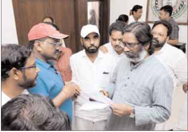
Chief Minister Hemant Soren meets people at his official residence in Ranchi on Tuesday.

Chief Minister Hemant Soren has taken seriously the calls coming to the women registered for Jharkhand Mukhyamantri Mainiya Samman Yojana regarding transfer of funds. In this regard, the Chief Minister said, information is coming in the context of Jharkhand Mukhyamantri Mainiya Samman Yojana that calls are being received on the mobile numbers of many beneficiaries regarding the scheme, which is completely fake. Therefore, sisters and daughters registered under the scheme are requested that on receiving calls regarding the scheme or transfer of funds, they should never share OTP or information related to their bank account with the caller. The Jharkhand govern-