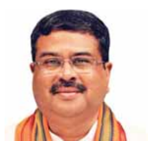
PTI ■ KOLKATA

Union minister Dharmendra Pradhan on Tuesday emphasised the need to enhance exports from eastern India and sought cooperation from the state governments in the region. He also underscored the government's commitment to ensuring the region benefits from various free trade agreements under the export promotion policy. In this year's budget, eastern India was highlighted as a priority area for development under the Purvodaya scheme, with matching infrastructure creation being a key focus, Pradhan said on the sidelines of an Exim Conference organised by the CII here. "We have initiated long-term policy reforms, particularly in the mineral sector, which have already begun benefiting the eastern states," he said. "The Centre is making efforts, but state governments must cooperate. Industrial growth and job opportunities are contingent on a stable environment," he said.