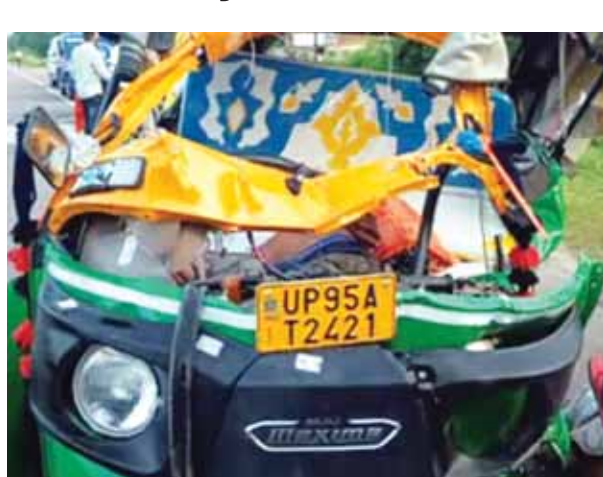
CHHATARPUR (MP)