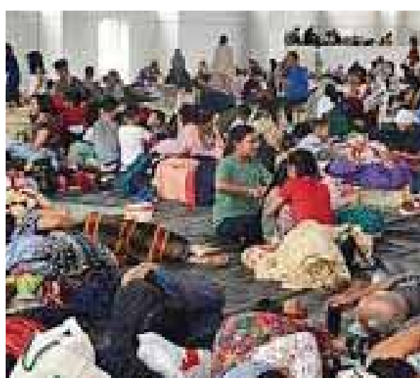
as of August 13. Refugees from Myanmar accounted for the highest number at 33,724, followed by IDPs from Manipur (7,999) and Bangladeshi refugees (2,014), it said. East Mizoram's Champhai district hosted the highest number of refugees, mostly Myanmar, at nearly 14,000, the department said. The Myanmar people mostly from the Chin state, who share ethnic ties with the Mizos, have been taking shelter in Mizoram since May 2023 due to ethnic violence between Meiteis and the Kukis in the neighbouring state.