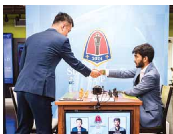
event. Petroff defense from Praggnanandhaa faced the Abdusattorov and could do

There was hardly any recovery time for Praggnanandhaa but it seems that the young gun has moved on from the last