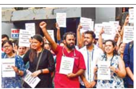
Doctors and medical students protest against the sexual assault and killing of a Kolkata based post-graduate trainee doctor, at Nair Hospital in Mumbai, on Tuesday