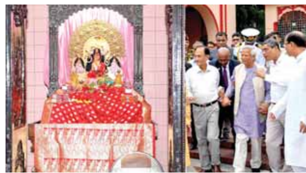
Bangladesh's Chief Adviser Muhammad Yunus with Hindu community members at the famous Dhakeshwari Temple in Dhaka, on Tuesday

Yunus, who took charge as the Chief Advisor of the interim Government on August 8 amid ongoing violence and vandalism, including against the minorities, also said each one's rights should be ensured and blamed "institutional decay" for the predicament that his country