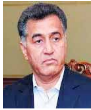
(Hameed's) political meddling will also be proved." Siddique quoted PTI founder Khan as saying that Hameed had supported his party inside Parliament by getting legislation passed and meeting the required number of members in the National Assembly. He said Hameed also remained involved in the general elections by backing the PTI. The senator said the former ISI chief had controlled the media and politicians and tried to control the judiciary as well.