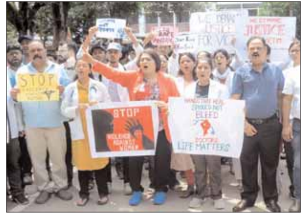
Jharkhand IMA officials along with RIMS Junior doctors protest against the rape and murder of a young medic from Kolkata at Rajendra Institute of Medical science in Ranchi on Tuesday.

Apart from junior doctors at RIMS, senior residents and junior residents of the other five medical colleges, including MGMCH Jamshepur, SNMCH Dhanbad, SBMCH