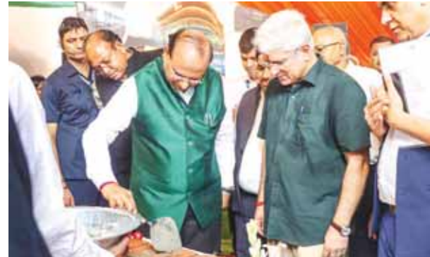
Delhi LG VK Saxena with Transport Minister Kailash Gahlot during foundation stone laying of multi-level electric bus depot, in New Delhi, on Tuesday

A controversy erupted with the jailed Chief Minister Arvind Kejriwal directing Cabinet member Atishi to do the same. "Lieutenant Governor is pleased to nominate Minister (Home), GNCTD,