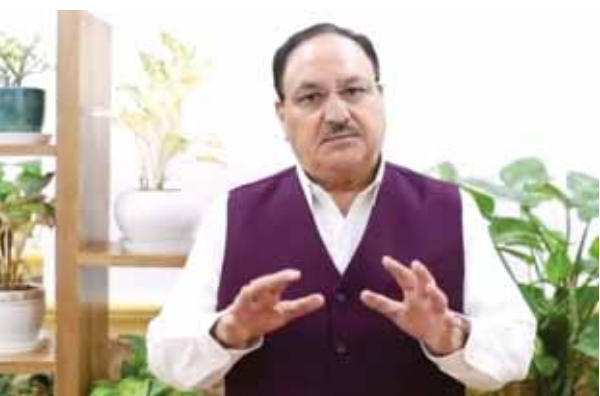
Union Health Minister JP Nadda speaks on the RG Medical College rape and murder incident, in New Delhi, on Tuesday

The administration issued an office memorandum drawing the attention of all resident doctors to the "Code of Conduct" as laid down by the High Court. It further stated that the violation of the High Court orders by the individual/students/employees/Resident Doctors/Associations/Unions etc will be in contravention of the directions of High Court and make them liable for disciplinary actions and also for contempt of court.