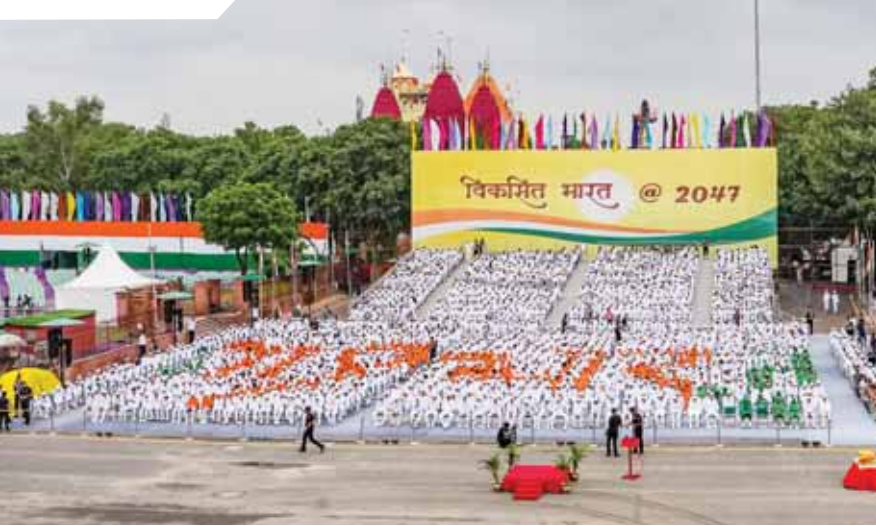
NCC cadets during full dress rehearsal for the 78th Independence Day celebrations at Red Fort, in New Delhi