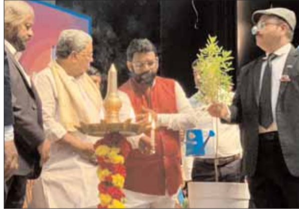
Jharkhand Education Minister Baidyanath Ram during the inaugural programme of the International Workshop on Human-Elephant Conflict organized by the Government of Karnataka in Bengaluru on the occasion of World Elephant Day on August 12.

The Education Minister said that Jharkhand is a land of forests. More than 29 per cent of the land is covered by forests. Jharkhand is a landlocked state with a healthy elephant population roaming around. The state is also surrounded by elephant migration friendly states on all sides and is marked as the East-Central Elephant Landscape. This scenario, while on the one hand, makes it difficult for proper scientific wildlife management, on the other hand, it points out the importance and need for mutual coordination among the concerned states. The latest census shows that Jharkhand is home to about 600 to 700 elephants. The lives of the people of