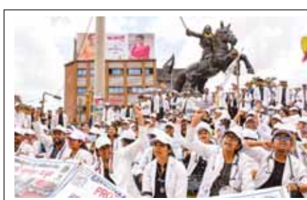
Junior doctors take part in protest at the Rani Chennamma Circle against the rape and murder of a trainee doctor in Kolkata, in Hubballi, on Tuesday